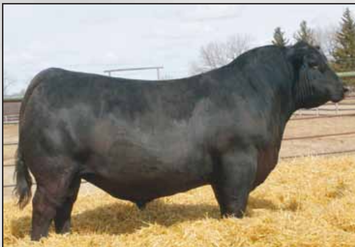
Ellingson Profound 8155, produced from a maternal sister to Lots 204-206.