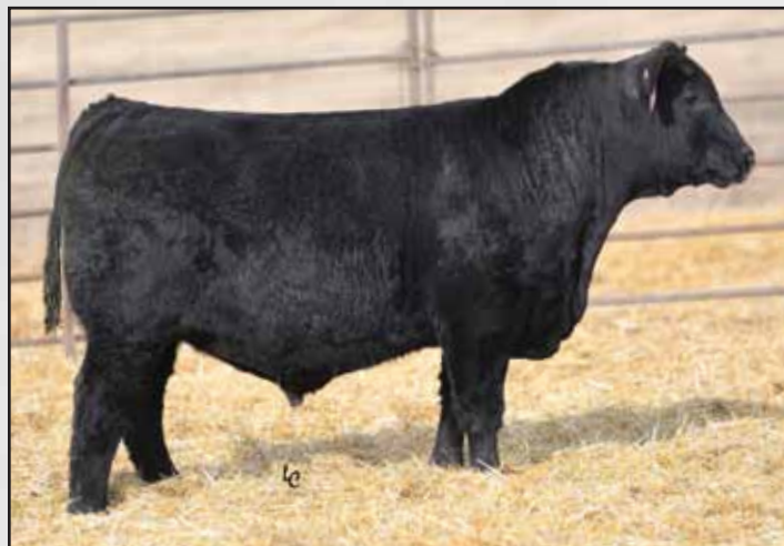
Lot 220, Ellingson Fundamental 0488.

Ellingson Fundamental 0488 proudly leads off the first Fundamental sons that we will offer. It is a sire group that will represent a large share of next year's calfcrop. Lot 220 is one of the younger individuals in the offering; however, you'd certainly never guess it appraising him in the same pen with bulls that are a month older than him. Truly a phenotypic standout, he packs extra red meat and shape into a clean-fronted, smooth-sided package and travels with fluency and authority. He earned a nursing ratio of 112 with an adjusted 205-day weight of 896 pounds. He ranks amongst the top 2 percent of the breed for both weaning and yearling weight EPDs. Coming from the Madame Pride family – a line that has called St. Anthony home for more than eight decades – you can count on his maternal potency to make long-lasting daughters. Lot 220's maternal sister is working for Logan Handyside.