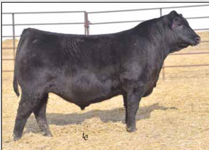
Ellingson Sagebrush 6234, Lot 53's maternal brother.