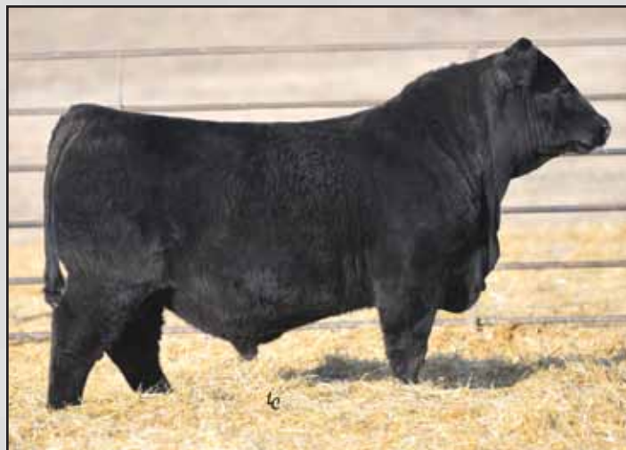
Lot 65, Ellingson Three Rivers 0162.