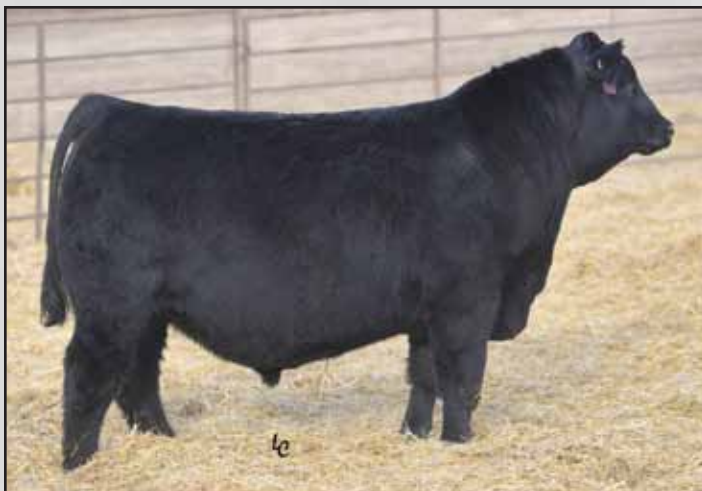
Lot 177, Ellingson Rainmaker 0233.