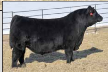
Right: Ellingson Revival 9500, Lot 3's maternal brother.