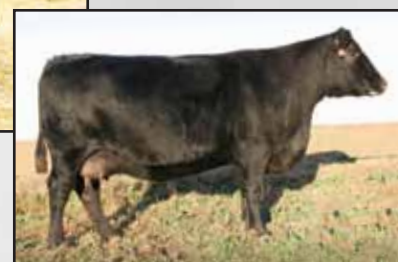
Lot 125's pedigree traces to EA Emblynette 434.