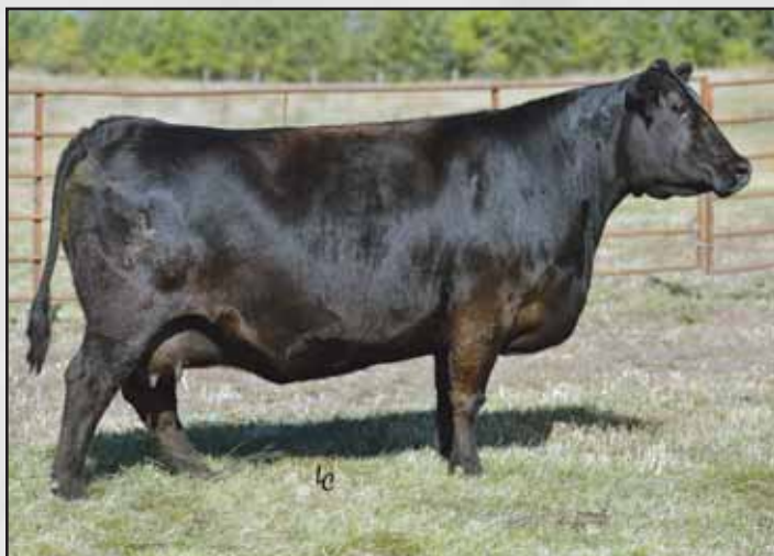
EA Primrose 9155, a maternal sister to Lot 54's dam and Lot 55's granddam.