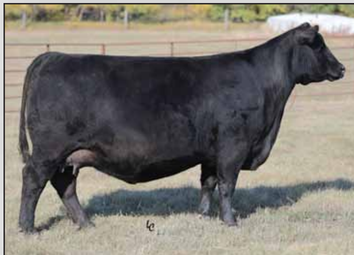
EA Emblynette 7480, Lot 46's dam.