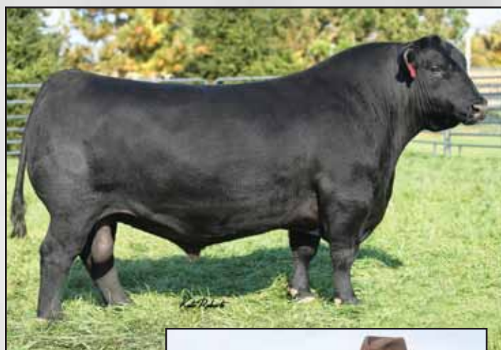
Above: Ellingson Homestead 6030, Lot 166's maternal brother.

Ellingson Frontiersman 9903 is a standout long-age bull that replicates his outstanding sire's fleshing ability, pounds and burly, stock-bull look. Expect Lot 166 to add pounds with his 103 nursing ratio and his 105 yearling ratio. His genomics solidified his actual performance projections, ranking him amongst the best in the breed. He is the natural-born son of a donor dam, EA Erica 1082, best known as the dam of Ellingson Homestead 6030, the $130,000 ST Genetics sire. She is a daughter of the legendary LT Territory 5824 of EA.