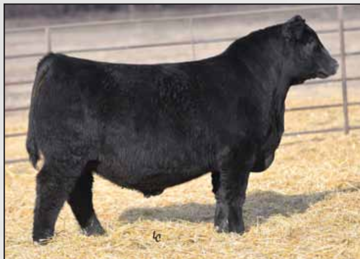
Lot 1, Ellingson Rider Pride 0285.

There is no better way to lead off the 2021 sale offering than with an individual that puts trait balance front and center like this bull. He exemplifies maternal, performance and phenotypic excellence. You will appreciate how he ties together tremendous center body mass and base width with a sound structural design and a proud stride. He came off his dam weighing 900 pounds and earning a 111 nursing ratio. His donor dam is a member of one of the greatest flushes ever produced on our ranch. His dam and many of her flush and maternal sisters have already been enrolled as donors here. She records an impressive nursing ratio of 2/111 and has settled to first-service A.I. every year of her production career. She is a direct daughter of the $35,000 pick of the cowherd in 2020, EA Bells Girl 2181, now owned by Ingram Angus. A flush brother, Ellingson Advance 7638, was Raven Angus' $15,000 selection in our 2018 sale. Lot 1 is a full brother in blood to Lot 2.