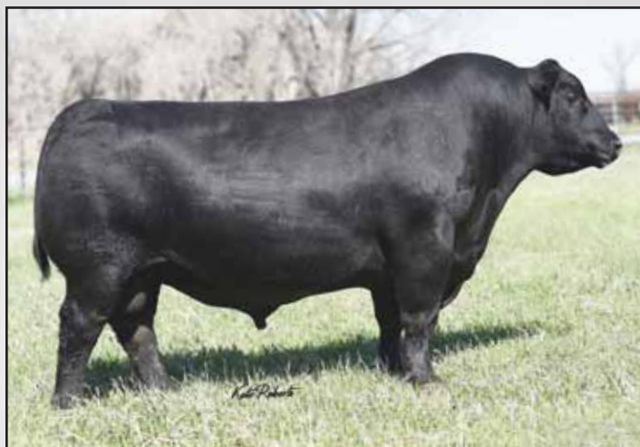
Ellingson Roughrider 4202, the maternal grandsire of Lot 249 and the maternal brother to the dam of Lot 251.