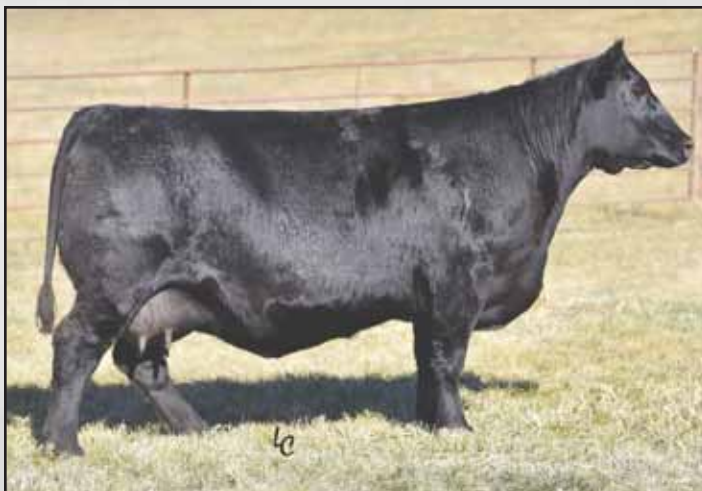
EA Emblynette 1085, Lot 188's maternal granddam.