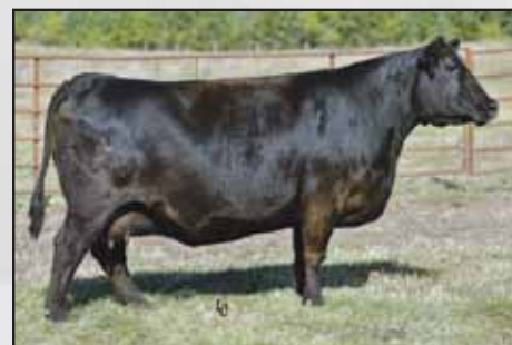
EA Primrose 9155, a maternal sister to the dam of Lots 163 and 164.