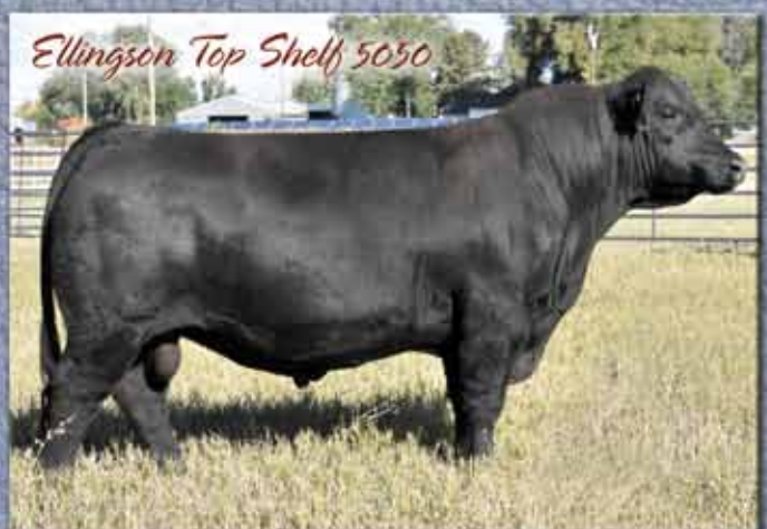
Ellingson Top Shelf 5050

Sire: Ellingson Plateau 1155 • MGS: SAV Final Answer 0035 Owned with: Hoffman Ranch, NE; Semex Alliance, Canada; & Top Shelf Syndicate