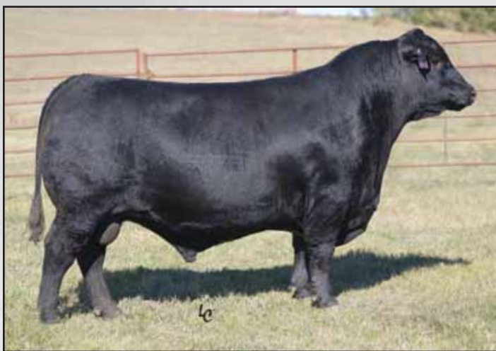
Ellingson Roundup 6206, the sire of Lots 244-246.

Here is a calving-ease bull linebred to Ellingson Chaps 4095, a cornerstone sire. His maternal pedigree includes Chaps, Substance, Alliance 6595 and the Emblynette cow family.