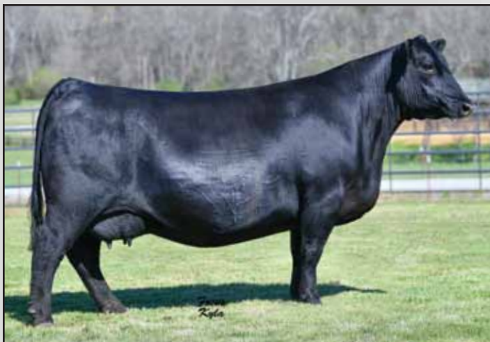
EA Hyalite Lady 1333, the maternal granddam of Lots 233-236 and the maternal sister to Lot 237.