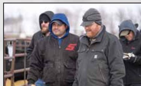
Old friends, the Debertins, surprised us at the sale. EA Rose 918, a maternal sister to Lot 151's dam.