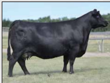
EA Hyalite Lady 4306, the dam of Lots 233-236.