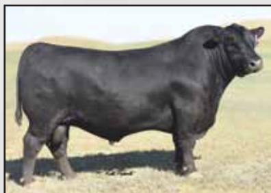
Ellingson Icon 5062, Lot 16's maternal brother.