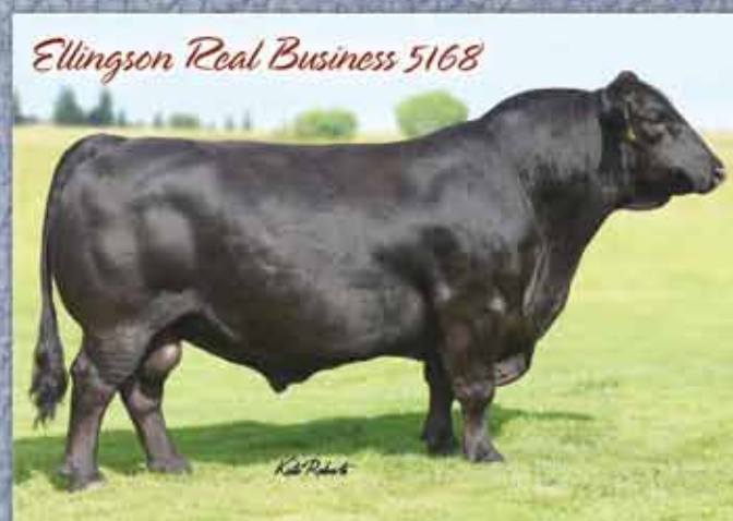
Sire: SAV Resource 1441 • MGS: Basin Max 602C Owned with: Alta Genetics, Canada, & Carstens Farms Ltd., IA