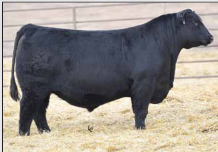
Lot 163, Ellingson Roughrider 9833.

Lots 163 and 164 are an impressive pair of embryo transplant flush brothers with balanced-trait packages to suit the needs of everyone in each aspect of the beef industry. Both their Advance dam and Territory granddam serve on our donor roster – spots they have rightfully earned through a combination of production, functionality and elite phenotype we all strive to propagate. Both bulls have moderate birthweights with the right level of performance for producing cattle that can thrive under harsher management settings. Use this pair of long-age flush brothers to settle more cows in their first year of service and to propagate the potent Roughrider line in a voluminous fashion. Lots 163 and 164 are flush brothers.