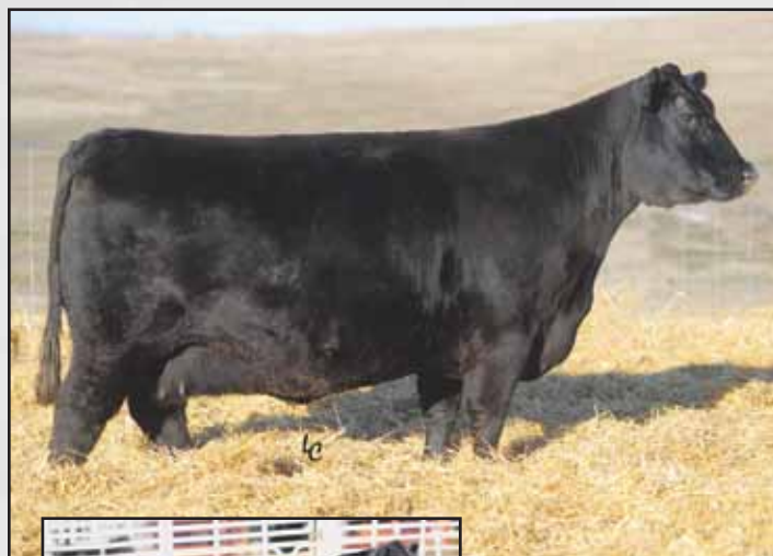
Above: EA Queen Dolly 7813, the maternal granddam of Lots 74, 78, 79 and 89.

Out of one of the top females on the ranch, Ellingson Three Rivers 0544 is sure to sire females that thrive in the grasslands of America. Lot 77's Ellingson Commanche 3119 dam serves on our donor team, just like her dam. His dam is a maternal sister to the $16,500 Ellingson Smokin' Gun 8245 that was selected by Potts Brothers Angus and Precise Cattle in 2019. His Pathfinder granddam was the $22,500 selection of Ingram Angus, where she now serves as a donor, also in 2019.