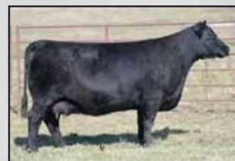
EA Miss Blackbird 5054.

This is an incredible – and incredibly rare – opportunity to make your personal selection of any cow from our herd. There are nearly 600 registered bred females to choose from. These females make up one of the top maternal cowherds in North America. They are responsible for producing one of the highest averaging volume bull sales each year. Most of our cow families have been established here for multiple decades, with some calling St. Anthony, N.D., home for 90-plus years. Our herd is culled as rigorously as any purebred program in America. It has been bred and developed in a disciplined fashion, with a focus on propagating balanced-trait cattle that excel in real-world performance, mothering ability, structural soundness and udder quality. More than 50 of the females eligible for selection have served, at some point, in our embryo transfer program. Also eligible to be picked are the dams, granddams and sisters to many leading A.I. sires. For a complete listing of the cows to choose from, along with their data and production records, call Stetson at (701) 595-1364. The buyer must make his or her selection by May 1.