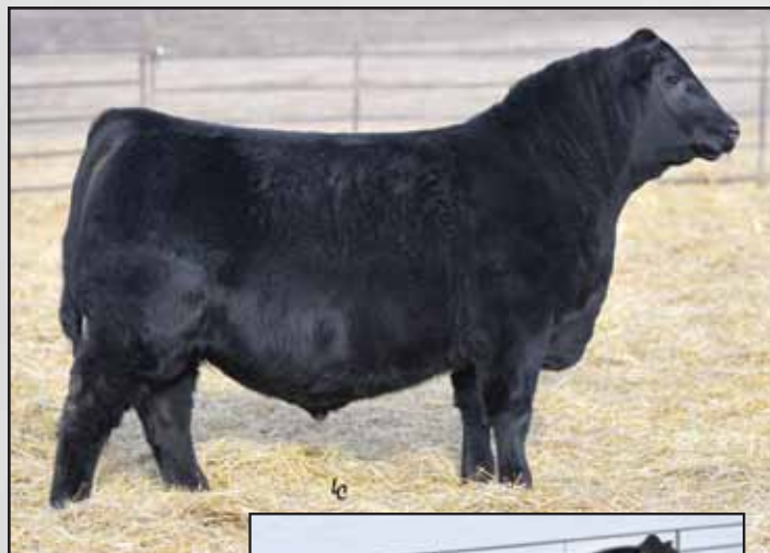
Above: Lot 3, Ellingson Rider Pride 0440.