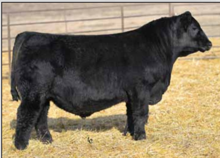
Lot 2, Ellingson Rider Pride 0290.