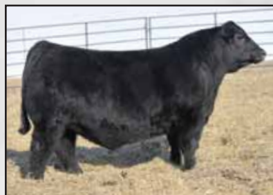
Ellingson Rough Terrain 9136, Lot 17's maternal brother.

Lot 17 is one of the top performers of his sire group. Undoubtedly, he will inject a substantial level of performance in just one generation to make your next load of feeder calves worth more. His Pathfinder dam has made a name for herself as an elite producer. She is the mother of the $30,000 Ellingson Rough Terrain 9136 working for Northway Cattle Company and the grandmother of the $45,000 Ellingson Aquifer 9137 purchased by Rust Mountain View Ranch and leased to the Breeder Link A.I. stud. He weaned at 950 pounds with a 109 weaning ratio.