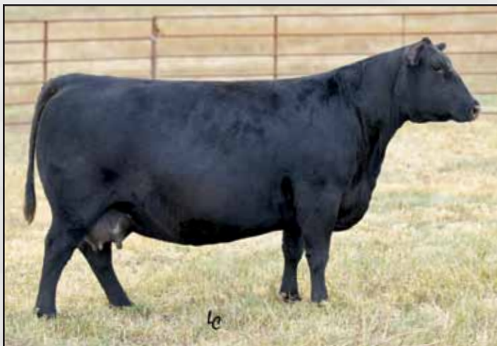
EA Blanche 7844, Lot 219's dam.

Ellingson 26 17 Emulous 0762 is a stout embryo transplant bull that will likely be the last son ever offered out of EA Blanche 7844. The Sitz Tradition RLS 8702 daughter is the dam of Ellingson Bandwagon 1053, the $23,000 Semex sire that has a featured sire group in this sale offering. Make sure to keep every daughter this bull sires, as they ought to be good ones.