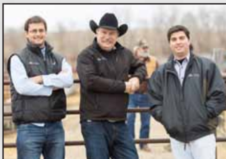
Alta Genetics and Diamond J Angus are partners on a bull out of the maternal sister to Lot 284's dam.