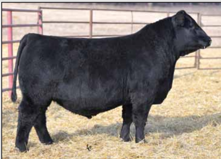
Lot 50, Ellingson Three Rivers 0252.