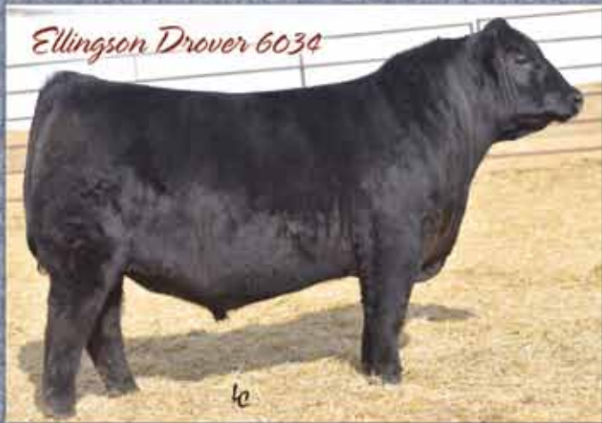
Ellingson Drover 6034

Sire: CTS Remedy 1T01 • MGS: SAV Final Answer 0035 Owned with: Boettcher Angus, NE, & Henderson Farms, IA