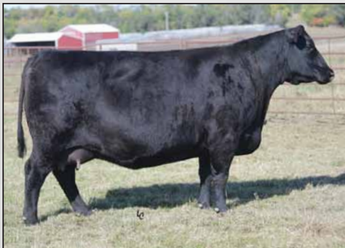
EA Primrose 2118, Lot 54's dam.