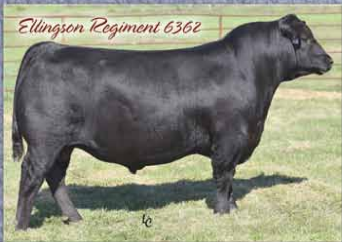
Ellingson Regiment 6362

Sire: CTS Remedy 1T01 • MGS: Tehama Blackcap Revolution Owned with: Ressler Angus, ND, & Sire Buyer, NE