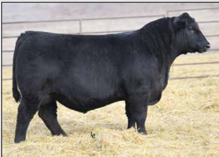
Lot 104, Ellingson Authorize 9840.