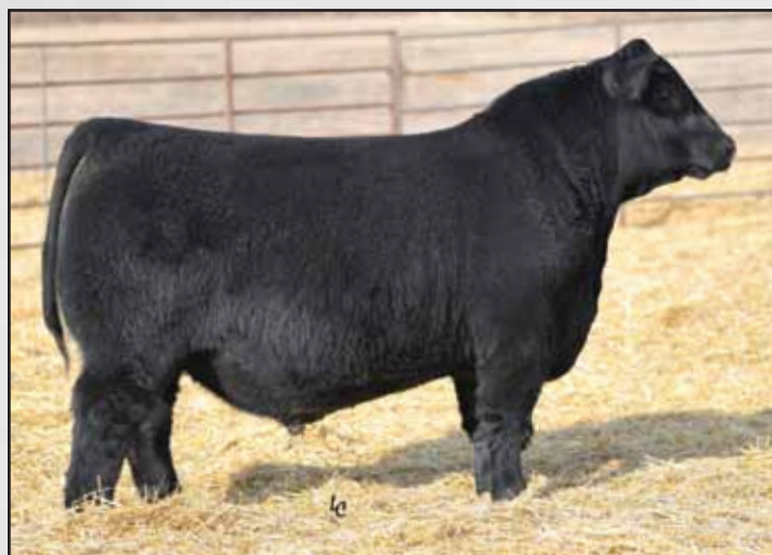
Lot 21, Ellingson Rider Pride 0118.