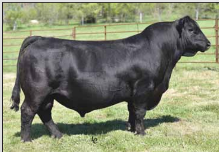
Ellingson Transcend 5212, the maternal brother to the dam of Lots 233-236.