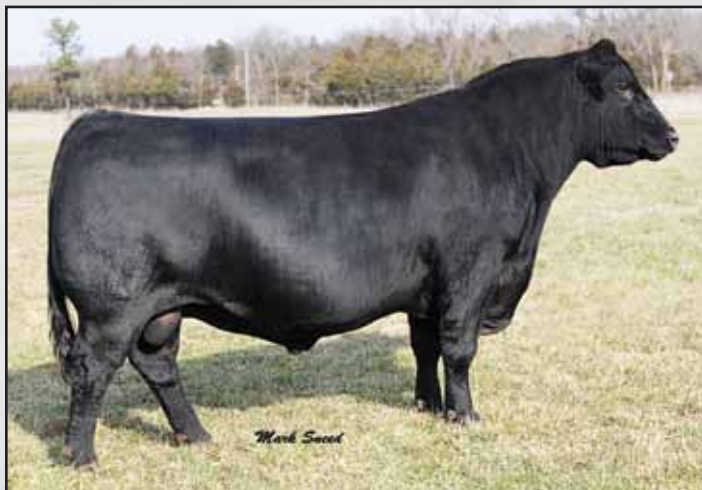
Ellingson Identity 9104, a maternal brother to Lot 263's dam.

Here is our personal favorite in the Powerpoint group. He is wide tracking, has tremendous muscle shape and substance of bone and earned a weaning ratio of 107. Unlike many bulls with big growth projections and little phenotype to back it up, he has the physical characteristics to go along with his numbers. His dam has a production nursing ratio of 5/106, a yearling ratio of 3/105, an IMF ratio of 3/101, a ribeye ratio of 3/102 and a 358-day calving interval. His maternal brother is featured as Lot 201. Another brother was selected by Penhros Farms in our 2020 sale.