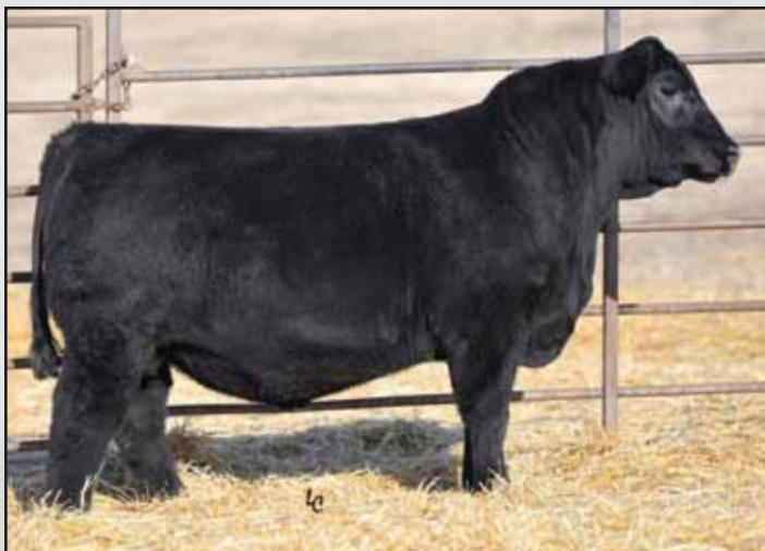
Lot 37, Ellingson Three Rivers 0056.