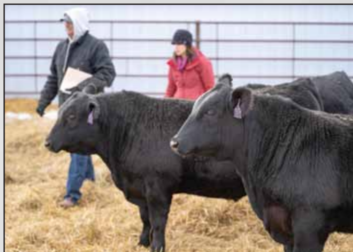
The Froelich Ranch is among the producers who have selected maternal brothers to Lot 48 in our previous sales.