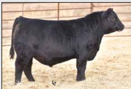
Ellingson Advance 7638, a flush brother to the dams of Lots 1 and 2.