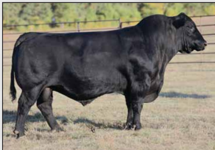
Ellingson Forage Converter, the sire of Lots 238-243.

Lot 239 is linebred to Ellingson Chaps 4095, a sire that has become a cornerstone of our program. This bull should be suitable for use on virgin heifers and sire more consistency and predictability having a tightly bred pedigree.