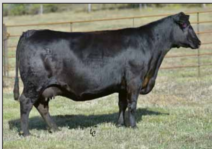
EA Lucy 2218, the dam of Lots 212-214.