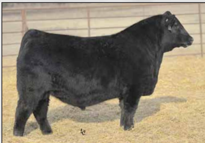
Ellingson Rough Country 9444, a maternal brother to Lots 215-218.