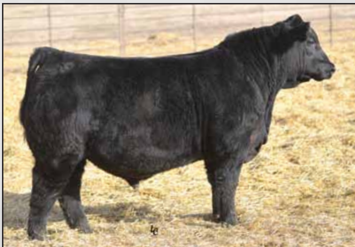
Lot 144, Ellingson Homegrown 0401.