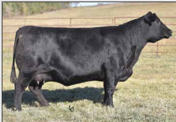
LT Beauty 1363, Lot 190's maternal granddam.

This is a stout-muscled Bandwagon 1053 son with added muscle expression in his hip and through his lower quarter. He is structurally sound and covers his track with athleticism and ease. Coming off his Active Duty dam at 885 pounds, Ellingson Bandwagon 0226 earned a nursing ratio of 105. His dam is an embryo transfer daughter of the Beauty 1363 donor dam. She exemplifies the fundamental traits we place added emphasis on to make a working range cow, including fertility, as she has settled to first-service A.I. every year of her production career thus far.