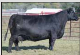
EA Madame Pride 3292.