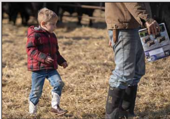
"Hey, wait for me. You have longer legs!"