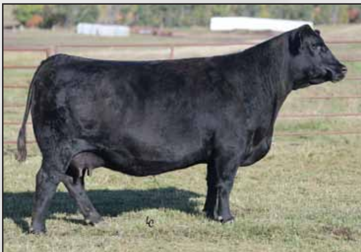
EA Emblynette 5099, the dam of Lots 202 and 203.

Diamond J Angus and Alta bought Ellingson Enterprise 3190, which is out of a maternal sister to the dam of Lots 202 and 203.