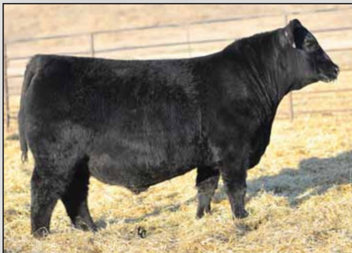
Lot 13, Ellingson Rider Pride 0308.