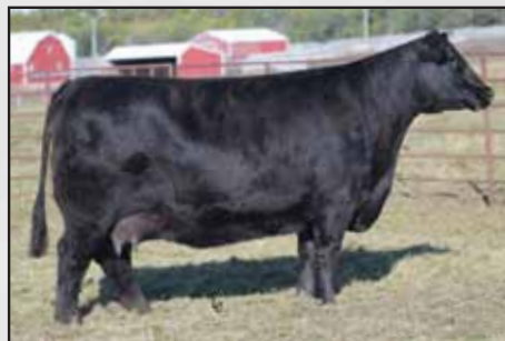
EA Primrose 5083, Lot 33's dam.