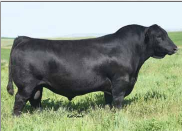
Ellingson Chaps 4095, Lot 81's maternal brother.