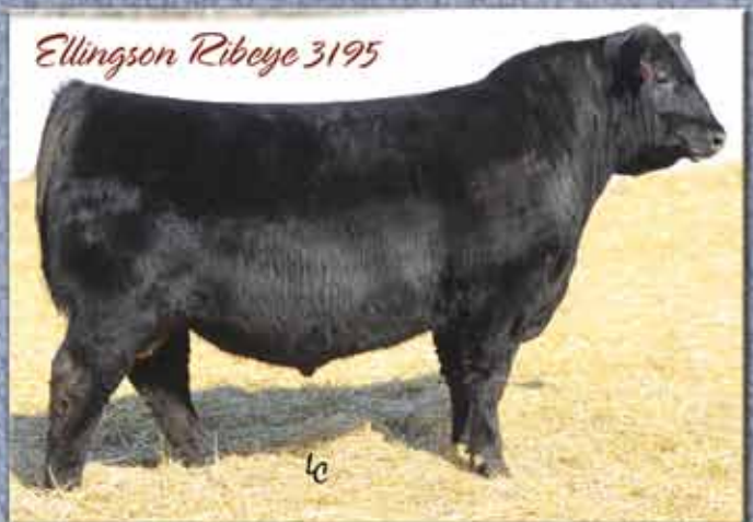
Ellingson Ribeye 3195

Sire: Ellingson Plateau 1155 • MGS: MAS Wide Butt 6032 Owned with: Brenner Angus, ND; Hatfield Angus, KY; & Select Sires, OH