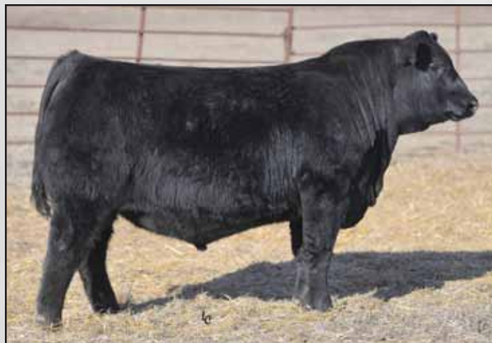
Ellingson Earnan 9230, a full brother to Lots 172-174.