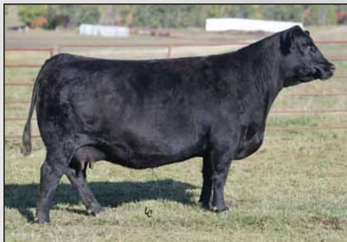
EA Emblynette 5099, Lot 284's dam.

Ellingson Impression 0660 may be a younger individual in the offering, but he has a ton of potential and a bright future. You will appreciate his added softness, bone and structural integrity. He earned a nursing ratio of 108. His dam has a production nursing ratio of 3/108, a yearling ratio of 2/106 and an IMF ratio of 1/118. She is a powerhouse female that blends together Earnan and Density. She is a maternal sister to the donor EA Emblynette 0025, a Pathfinder Territory daughter best known as the dam of the $35,000 Ellingson Enterprise 3190 that sold to Alta Genetics and Diamond J Angus in 2014. Four of Lot 284's maternal sisters are retained in our cowherd. Maternal brothers sell as Lots 202 and 203.