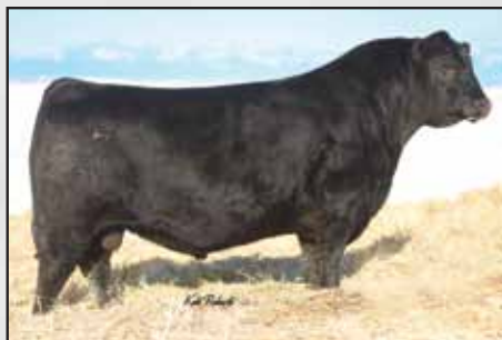
HA Cowboy Up 5405, the maternal grandsire of Lots 175 and 176.