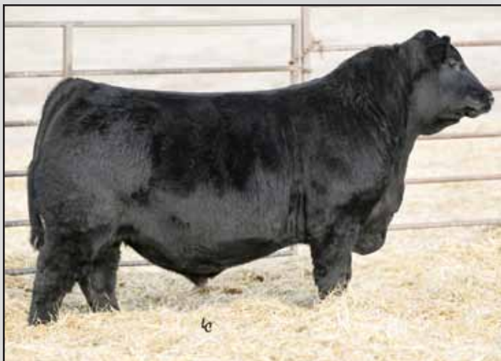
Lot 58, Ellingson Three Rivers 0299.