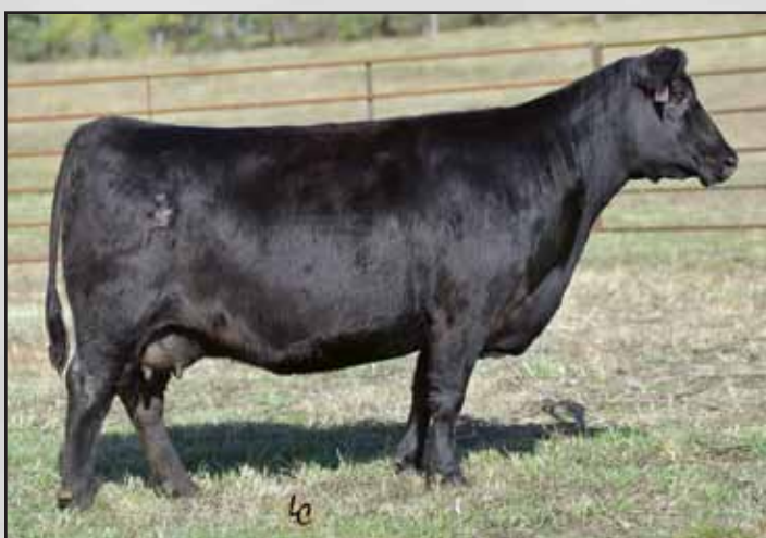
EA Emblynette 1173, the maternal granddam of Lots 127-131 and maternal great-granddam of Lot 126.