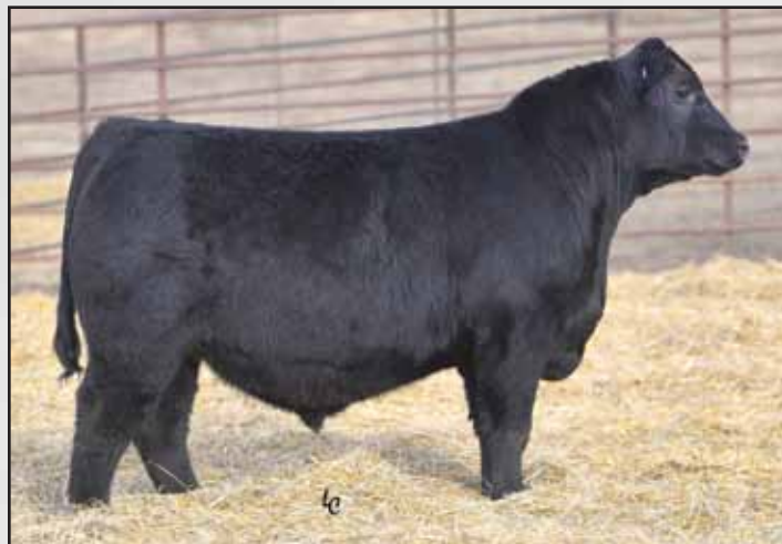
Lot 261, Ellingson Powerpoint 0303.

This is a unique opportunity to purchase a full brother to one of the elite up-and-coming herdsires for our breeding program. Ellingson Powerpoint 0303 is a full brother to the $40,000 Ellingson Profound 8155, the top-selling lot in our 2019 sale that sold to Peak Dot Ranch and was the heaviest used sire at Ellingson Angus for our 2020 spring breeding season. His dam is a second-generation donor that records a production birth ratio of 2/98, a nursing ratio of 2/106, a yearling ratio of 1/106, an IMF ratio of 3/103 and a ribeye ratio of 3/102 and has settled to first-service A.I. every year of her production career. His Pathfinder Territory granddam ranks as one of the top cows to ever walk our pastures. Other brothers are working for Will Ruland and Neiderman Ranch.