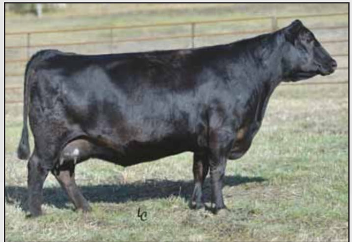
EA Emblynette 0068, Lot 225's dam.