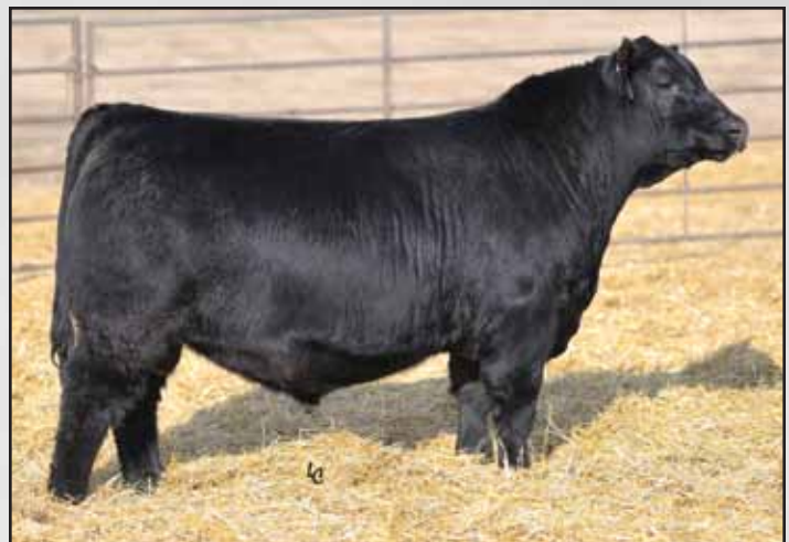
Lot 196, Ellingson 26 17 Emulous 0076.