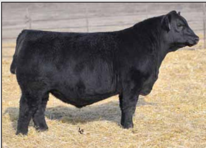
Lot 46, Ellingson Three Rivers 0312.