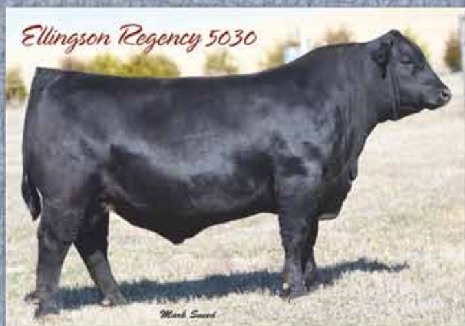
Sire: SAV Resource 1441 • MGS: Sitz Upward 307R Owned with: Diamond J Angus, ND, & Alta Genetics, Canada