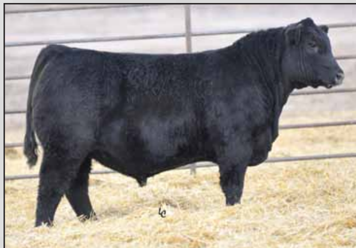
Lot 198, Ellingson 26 17 Emulous 0195.