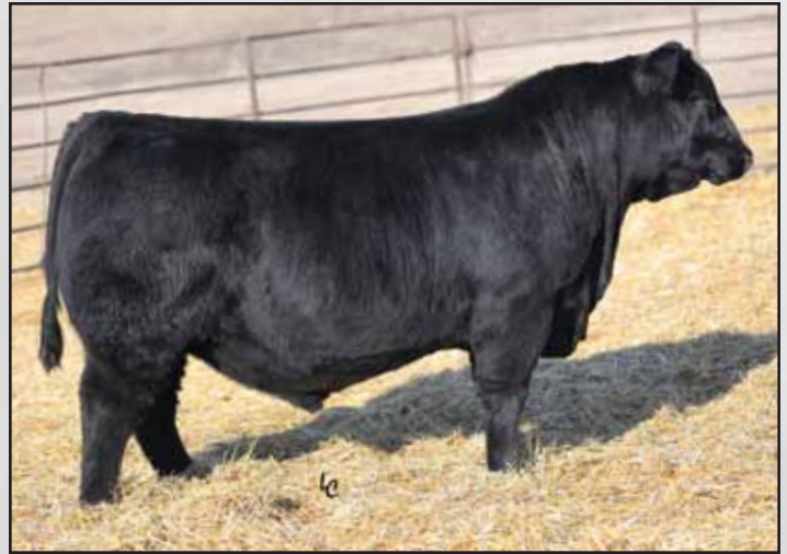
Lot 34, Ellingson Three Rivers 0019.

Ellingson Three Rivers 0019 is one of our favorites of the offering. He balances some of the most economically relevant traits to commercial cattle producers who sell their calves by the pound and expect their cowherd to thrive without being pampered. He weaned off his dam at 995 pounds and earned a 114 nursing ratio. His dam ranks as one of the top young cows in our herd. She is one you will more than appreciate for her stunning eye appeal, softness, angularity and near-perfect udder and foot structure. You will even appreciate her more for having a production birth ratio of 3/93, a nursing ratio of 3/109, a yearling ratio of 2/104, an IMF ratio of 1/122, a ribeye ratio of 1/105 and a calving interval of 361 days, having settled to first-service A.I. every year of her production career. Lot 34's two maternal sisters have both been retained in our cowherd and are some of the most elite young females on the ranch.