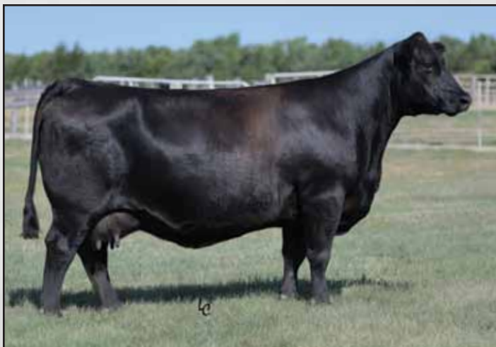
EA Bells Girl 2181, the maternal granddam to Lots 196-200.