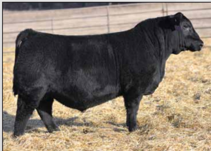
Lot 41, Ellingson Three Rivers 0170.