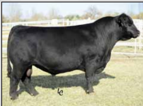
Ellingson Guaranteed 0023, Lot 12's outcross maternal grandsire.