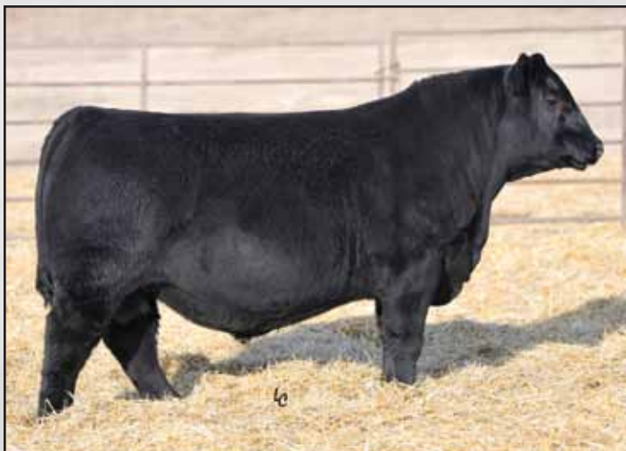
Lot 64, Ellingson Three Rivers 0157.