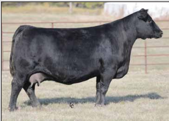
EA Emblynette 5652, Lot 95's maternal granddam.