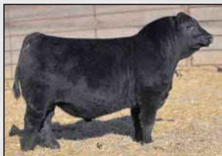
Ellingson Practical 9122, Lot 248's maternal brother.