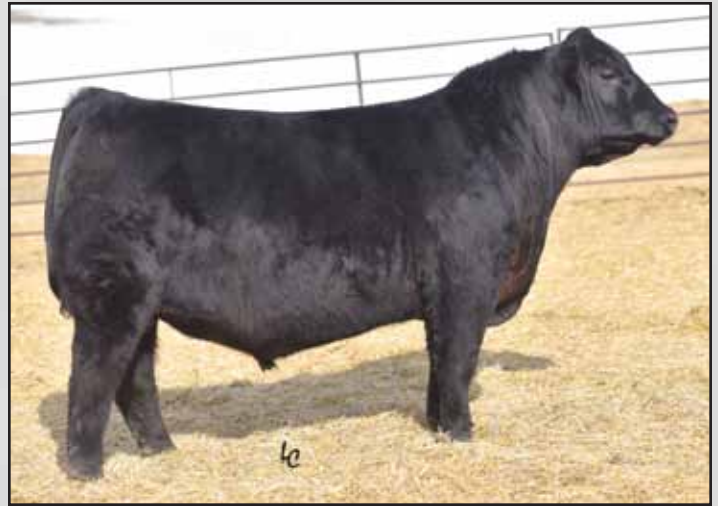
Ellingson Drover 6034, a maternal brother to Lot 55's dam.

Ellingson Three Rivers 0376 is another expansive-middled, deep-flanked bull that has the credentials of a true performance bull. He came off his Ellingson Format 2205 dam at 860 pounds to earn a nursing ratio of 105. His mother is a maternal sister to the $30,000 Ellingson Frontiersman 7132, the $21,000 Ellingson Drover 6034 and the $20,000 Ellingson Homestead 8028.