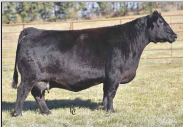
EA Blackclass 1027, the dam of Lots 215-218.