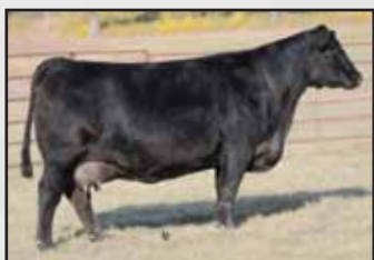
EA Emblynette 5365.