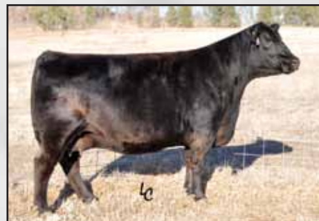
EA Madame Pride 430, Lot 270's maternal great-granddam.