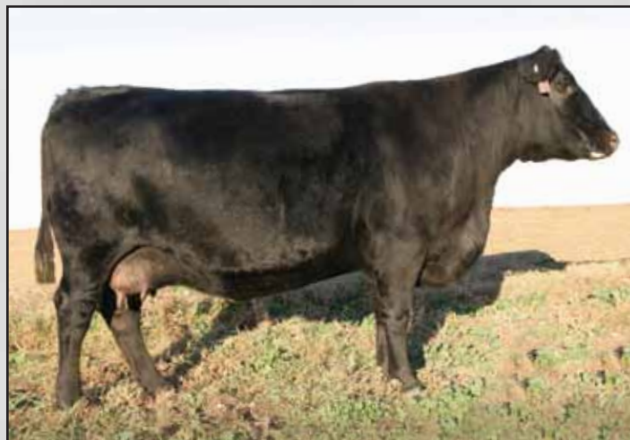
EA Emblynette 434, Lot 168's maternal granddam.