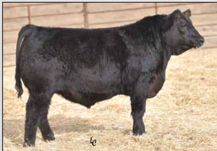
Ellingson Professional 7041, a maternal brother to Lots 140 and 141.

This is a well-balanced pair of flush brothers tracing to the longtime donor Blackclass 124. Their dam and multiple sisters have joined the donor roster at Ellingson Angus. They are maternal sisters to the $50,000 Ellingson Versatile and the $45,000 Ellingson Revolution. Their maternal brother, Ellingson Professional 7041, was a highlight calving-ease lot in 2018, selling to Ressler Ranch for $17,000. A full brother in blood sells as Lot 133. Lots 140 and 141 are flush brothers.