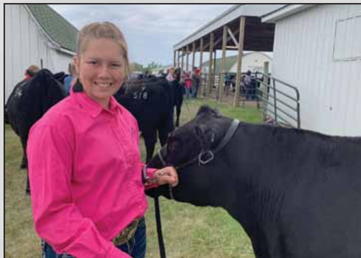
Sheridan showed a maternal sister to Lots 104-106, "Rachel," with much success in 2019 and 2020.