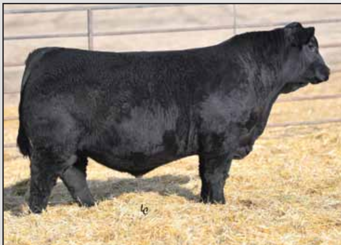
Lot 68, Ellingson Three Rivers 0305.