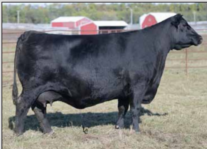
EA Queen Dolly 3246, Lot 50's dam and a maternal sister to Lot 51's dam.