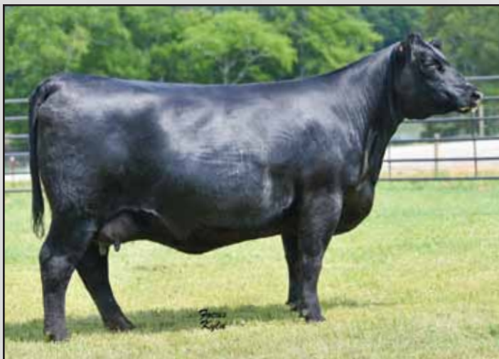
EA Madame Pride 6027, Lot 15's maternal sister.