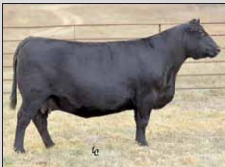
EA Hyalite Lady 7865, Lot 30's great-granddam.