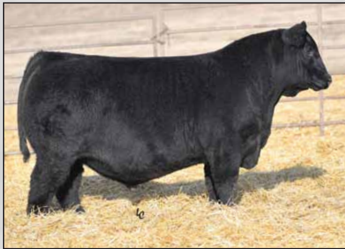
Lot 57, Ellingson Three Rivers 0065.

This is another bull that will certainly add payweight, size and length to your next potload of feeder calves. He came off his Top Shelf dam at 900 pounds and earned a nursing ratio of 110. His dam is a beautifully constructed female and a direct daughter of EA Blackcap 4053, a Pathfinder and donor. Lot 56's maternal brother was selected by Estevold Ranch in our 2020 production sale.