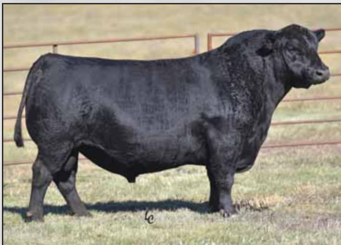
Koupal Advance 28, the maternal grandsire of Lots 1-8.

Ellingson Rider Pride 0286 is a modest-birthweight Rider Pride son that ranks amongst the top 10 percent of the Angus breed for both weaning weight and yearling weight. His dam by Advance has recorded a nursing ratio of 3/103. A maternal brother was a featured Roughrider son in last year's production sale and is now working for Kraenzel Ranch.