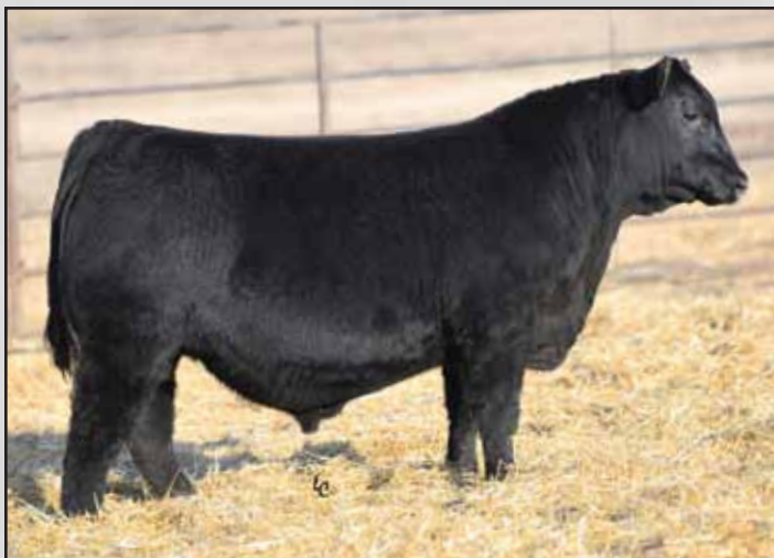
Lot 72, Ellingson Three Rivers 0292.