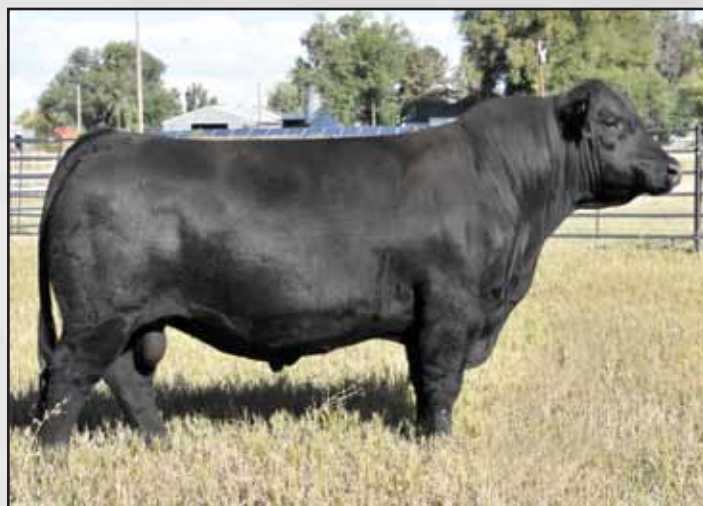
Ellingson Top Shelf 5050, a maternal brother to Lot 73's dam.

Ellingson Three Rivers 0259 is another strong performance herdsire prospect resulting from the Three Rivers x Roughrider pairing that has yielded good results. His easy-fleshing dam is a maternal sister to the $25,000 Ellingson Identity 9104. A maternal brother was purchased by Bill Pitz in last year's sale.