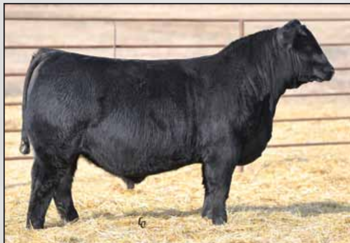
Lot 192, Ellingson Bandwagon 0383.