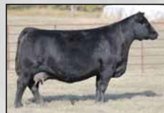
EA Emblynette 5652.