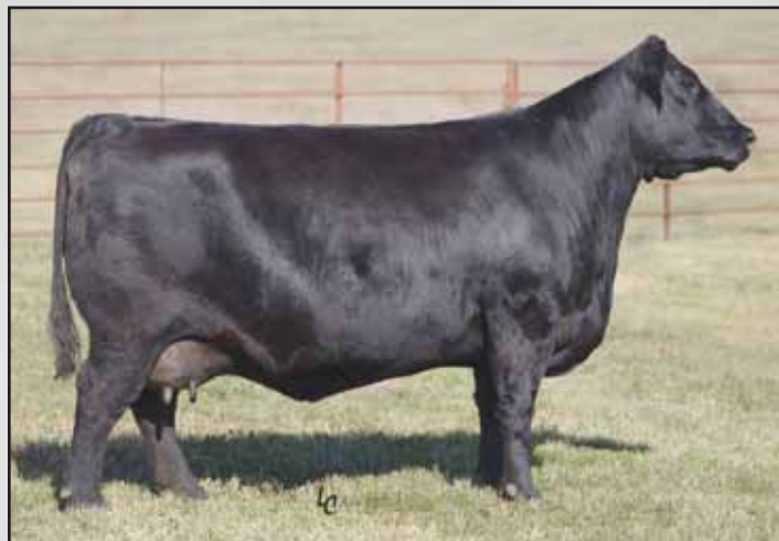
EA Madame Pride 3072, the dam of Lots 207-211.