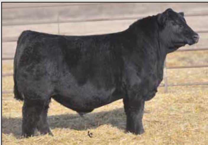
Lot 128, Ellingson Homegrown 0108.