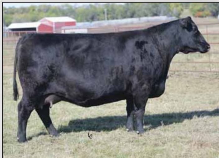
EA Primrose 2118, Lot 23's dam.