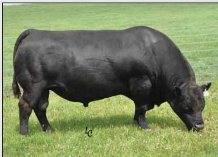
Tehama Blackcap Revolution, the maternal grandsire of Lots 107-109.