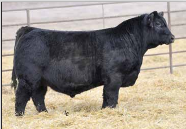
Lot 201, Ellingson 26 17 Emulous 0112.