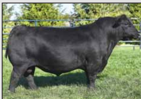
S Powerpoint WS 5503's influence sells.