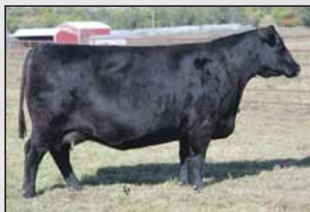
EA Primrose 2118, the maternal granddam of Lots 163 and 164.