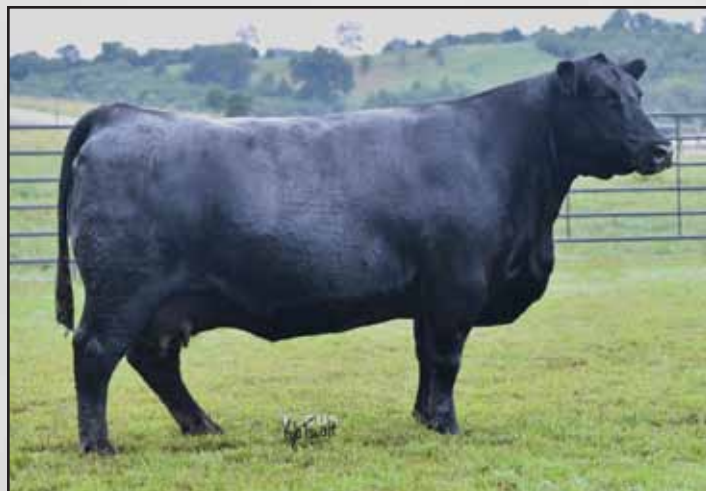
EA Blackclass 6353, Lot 201's maternal sister.