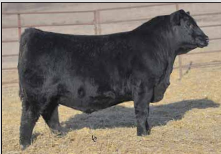
Ellingson Authorize 9030, Lot 262's maternal brother.