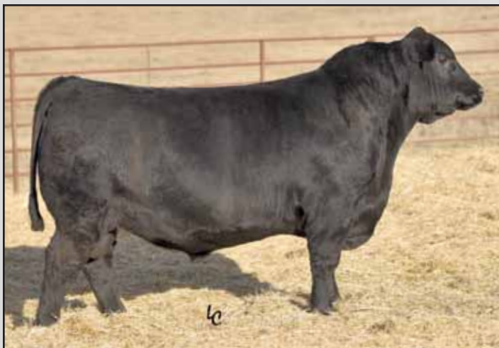
Ellingson Consistent 6235, Lot 221's maternal brother.