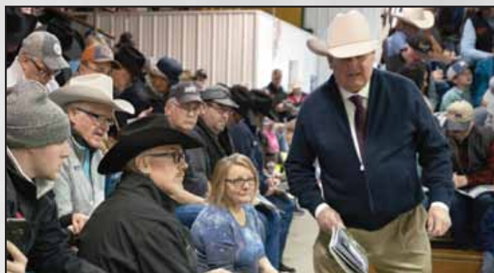
Lawlar Ranch selected a maternal brother to Lot 101 last year.

Here is a pair of long-age flush brothers that should cover more head in their first year of service compared to their yearling counterparts. They are maternal brothers to the $130,000 Ellingson Homestead 6030, the top-seller in 2017 to ST Genetics, where he has went on to be a leading semen-sales sire. Both posted outstanding genomic profiles, ranking amongst the best for calving ease, weaning and yearling weight, scrotal circumference, heifer pregnancy and ribeye. Lots 102 and 103 are flush brothers.