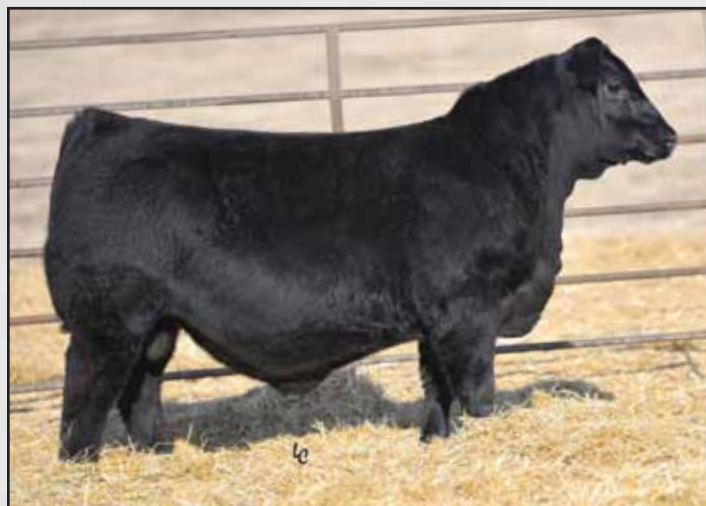
Lot 33, Ellingson Three Rivers 0262.

Lot 33 is an outstanding way to introduce the first sons to ever be offered by Ellingson Three Rivers 8062, our 2020 sale lead-off bull. Lot 33 displays tremendous power and mass packed into a bold-middled, sharp-fronted package. His phenotypic prominence, outstanding performance resume and second-to-none maternal heritage make him a strong herdsire prospect that should be considered by every program. His donor dam has risen to become one of the top females in our herd. She is a maternal sister to the $23,000 Ellingson Consistent 6235 that was purchased by Arntzen Angus in 2017 and is now a part of the Breeder Link sire lineup. Two of Lot 33's maternal brothers have been features in our past production sales, including Ellingson Homestead 8181, an $18,000 lot in 2019. Three of his maternal sisters have been retained in our herd.