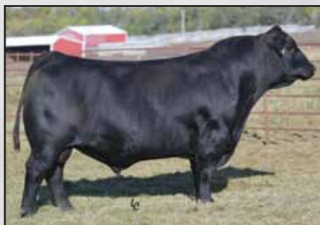
Ellingson Homegrown 6035's service sells.