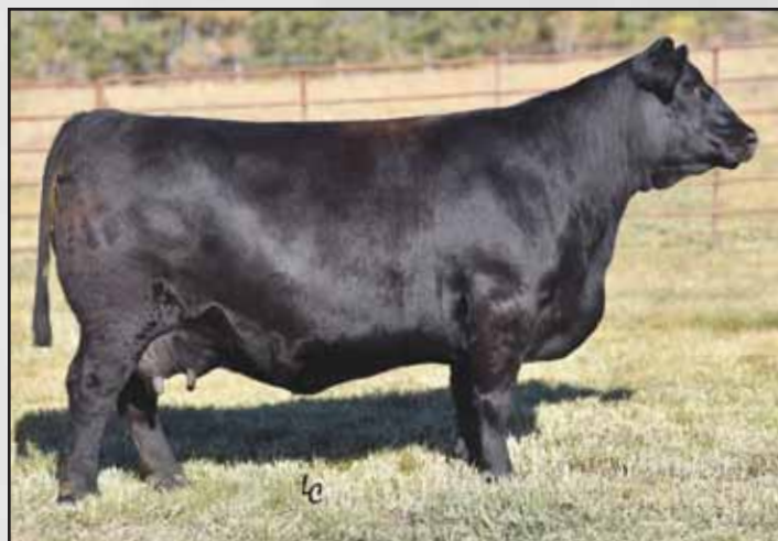
EA Emblynette 2091, Lot 142's dam.