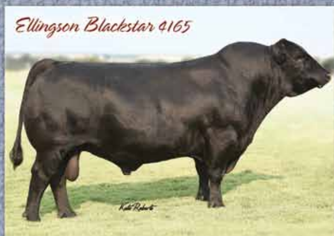
Sire: SAV Resource 1441 • MGS: SAV Final Answer 0035 Owned with: Alta Genetics, Canada