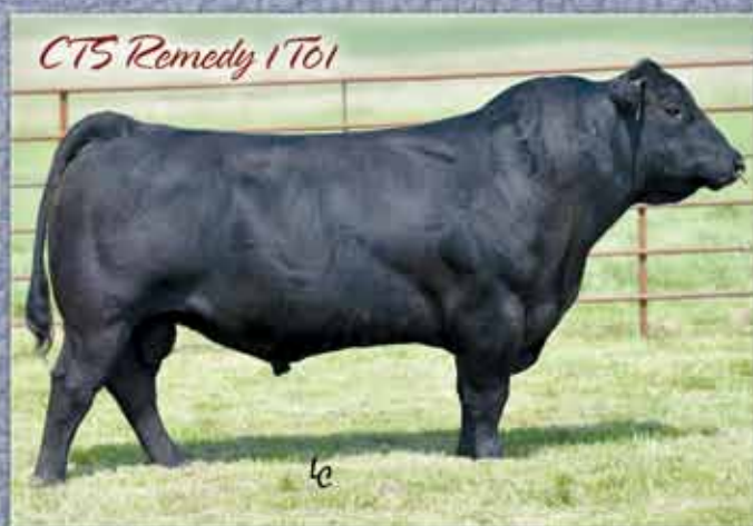
Sire: Connealy Thunder • MGS: LT 598 Bando 9074 Owned with: Holt Farms, TN; Jared Brown & Sons, TN; & Select Sires, OH