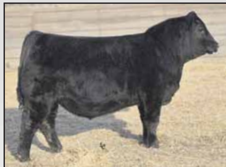
Ellingson Boardwalk 9266, Lot 13's maternal brother.