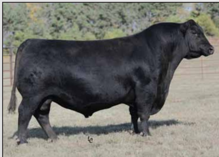
Ellingson Rider Pride 7282, a maternal brother to Lots 93 and 94.