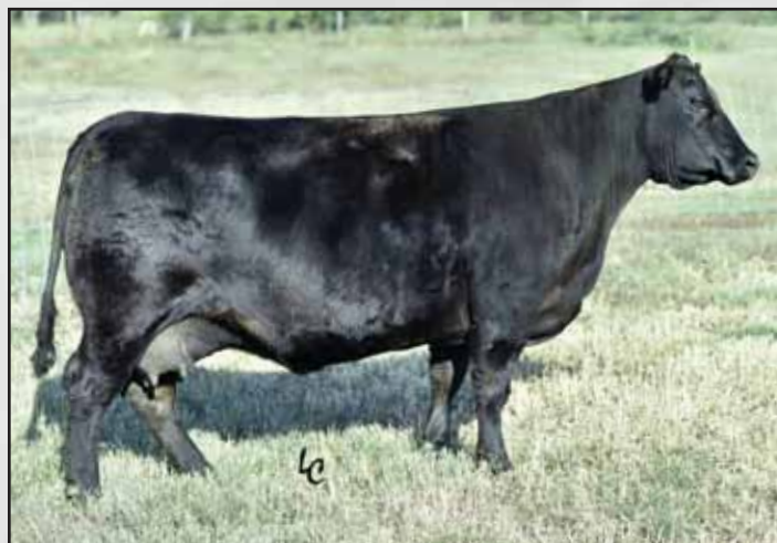
EA Blackclass 8914, the dam of Lots 172-174.