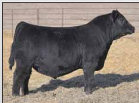
Ellingson Long Shot 9217, Lot 32's maternal brother.