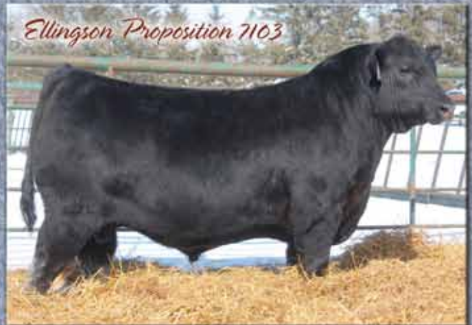
Ellingson Proposition 7103

Sire: S Powerpoint WS 5503 • MGS: CTS Remedy 1T01 Owned with: E/T Cattle, GA, & Peak Dot Ranch, SK, Canada