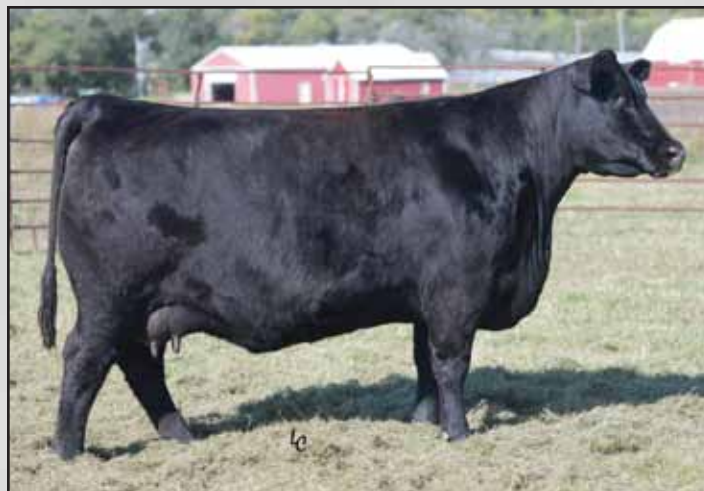
EA Emblynette 5169, the dam of Lots 127-131 and the maternal granddam of Lot 126.