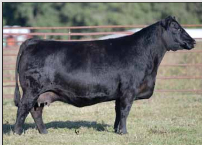
EA Blackbird 6294, Lot 72's dam.