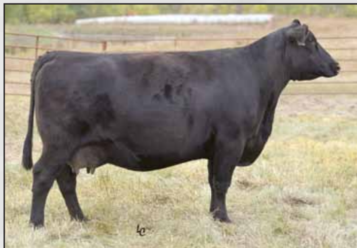
EA Emblynette 0025, a maternal sister to the dam of Lots 202 and 203.