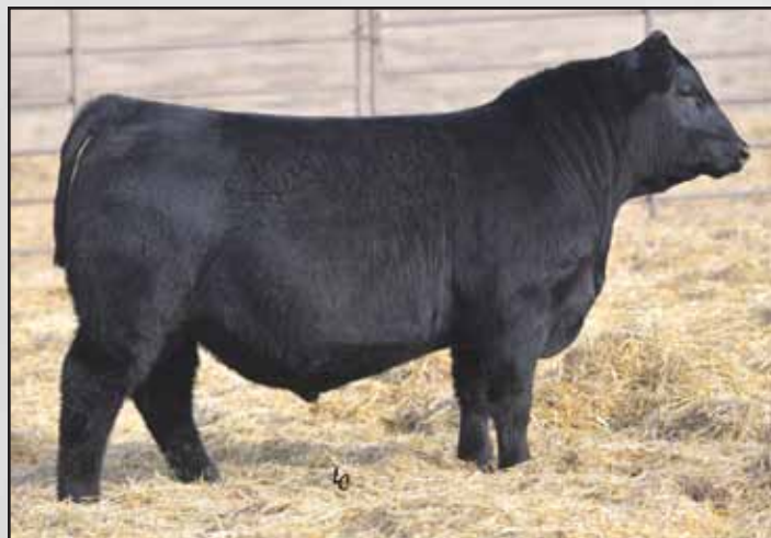
Lot 133, Ellingson Homegrown 0245.