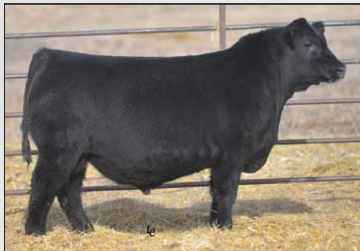
Lot 248, Ellingson Homestead 0421.

Ellingson Homestead 0421 is an elite calving-ease prospect that should be considered by even the most particular cattle producers. Not many times will you find a true calving-ease prospect that has the base width and true muscle dimension down his top like Lot 248 has. His maternal foundation is second to none and, therefore, we'd expect his impact to be long-term in producing fancy, productive daughters. His Advance dam has recorded a production birth ratio of 2/87 and a nursing ratio of 2/101. She is quickly gaining traction as a top young cow on the ranch, following in the footsteps of her donor dam, granddam and great-granddam. Lot 248's maternal brother was the Lot 1 featured Homegrown son in last year's sale and was selected by Weers Angus for $19,000. That bull has now joined the Breeder Link A.I. stud lineup. The credentials Lot 248 puts together should give him strong consideration for utilization beyond the breeding pasture.