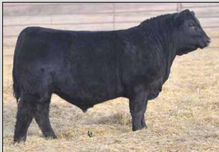
Lot 119, Ellingson Homegrown 0063.

Here is a powerhouse set of flush brothers out of a powerful Plateau donor that has featured many progeny in our past production sales. Their Pathfinder dam has recorded a nursing ratio of 5/106, a yearling ratio of 4/107 and a ribeye ratio of 3/105. She is a maternal sister to the dam of the $80,000 Ellingson Scotsman 0010, the top-selling bull selected by Select Sires in 2011. Maternal brothers are working for Kevin Braun, Harris Ranch, Knapp Ranch, Diede Ranch, Hager Operating, Ham Ranch and Jacobs Ranch, while 11 maternal sisters are working in our cowherd. Lots 118-121 are flush brothers.