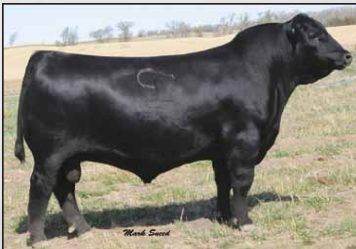
Connealy Earnan 076E, the maternal grandsire of Lots 132-141.