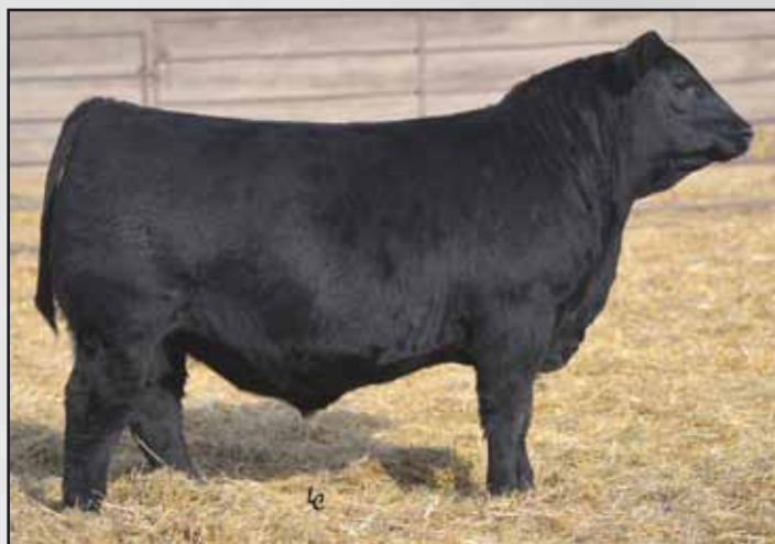
Lot 187, Ellingson Bandwagon 0182.

Ellingson Bandwagon 0182 is, without question, one of our favorites in the offering. He has a commanding herdbull presence about him – from his stout phenotype and fluent stride to his maternal backing and performance resume. He came off his Chaps dam at 930 pounds and earned a fantastic nursing ratio of 112. His young dam has started off a strong production career, posting a production birth ratio of 2/96, a nursing ratio of 2/110 and a yearling ratio of 1/106 and settling to first-service A.I. every year of her production career so far. With the sires Bandwagon, Chaps, Substance, Bushwacker and Bando 5175 in Lot 187's lineage, you can expect his daughters to be the foundational kind. His maternal brother was selected by the Leader Angus Farms program as a calving-ease feature in last year's production sale.