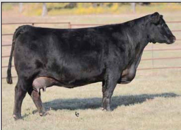
EA Emblynette 5365, Lot 58's maternal sister.