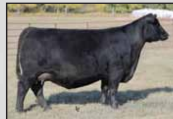
EA Emblynette 7480.