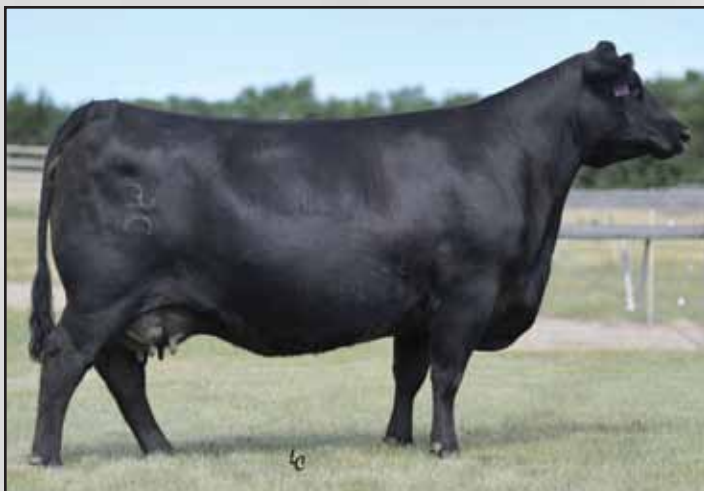
EA Hyalite Lady 4306, the dam of Lots 122-124.