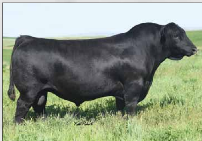
Ellingson Chaps 4095, a maternal brother to Lot 146's dam.

This stout bull is double bred to the foot-improving CTS Remedy 1T01. He ranks elite for weaning, yearling and carcass weight and ribeye. His great-granddam, EA Primrose 9155, is one of the top cows to grace our pastures and the dam of the $30,000 Frontiersman and the $21,000 Drover.