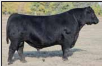
Ellingson Authorize 7057's dam is a maternal sister to Lot 53.