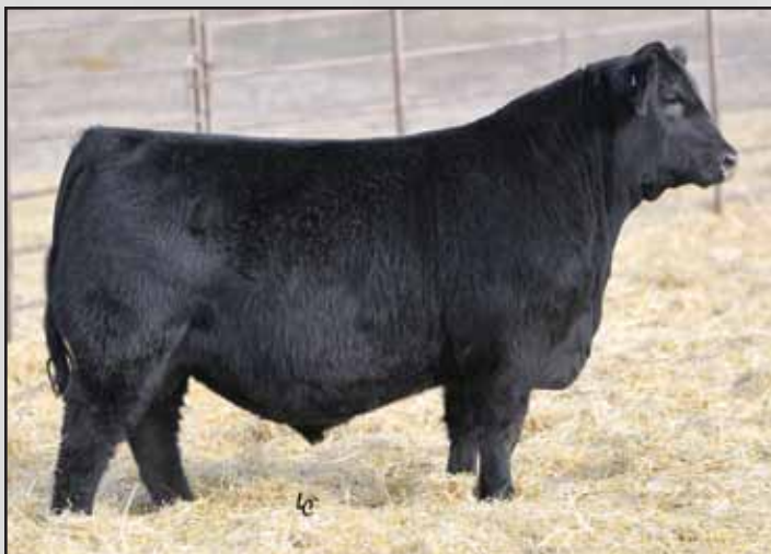
Lot 9, Ellingson Rider Pride 0343.