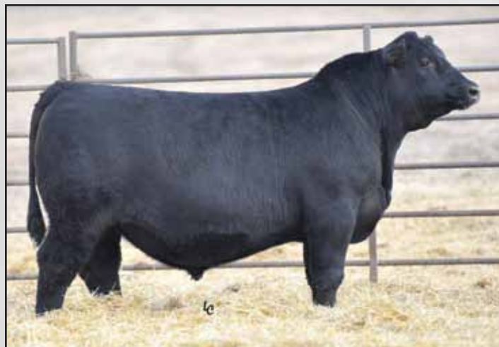
Lot 164, Ellingson Roughrider 9817.

"Whether you think you can or think you can't, you're right." — Henry Ford