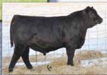
Left: Ellingson Superior 0031, a full brother to Starman's dam.

Connealy Consensus Brazila of Conanga 3991 839A Benfield Substance 8506 EA Rosetta 312