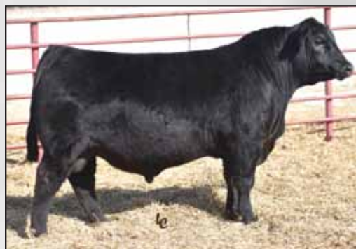
Ellingson Stetson, a maternal brother to Lot 117's dam.