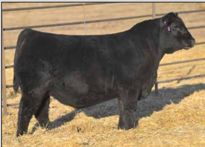
Lot 93, Ellingson Authorize 0350.