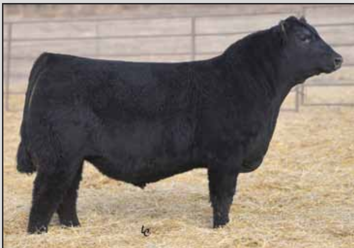
Lot 150, Ellingson Homegrown 0050.