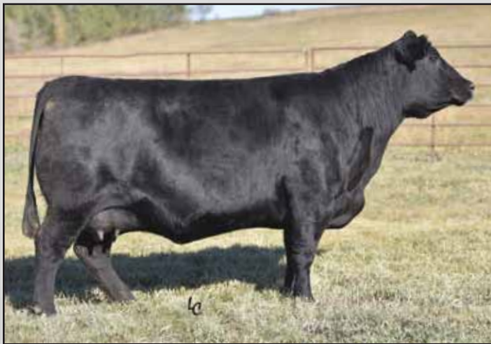
EA Beauty 1363, the maternal granddam of Lots 253 and 254.

Lot 253's genomic profile has him at the top of the breed for weaning, yearling and carcass weight, scrotal, docility, calving-ease maternal, milk and tenderness. Sheldon Holte, Prairie Diamond Ranch and Doug Maher own his dam's flush brothers. He is a full brother in blood to Lot 254.