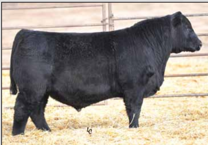
Lot 204, Ellingson 26 17 Emulous 0136.