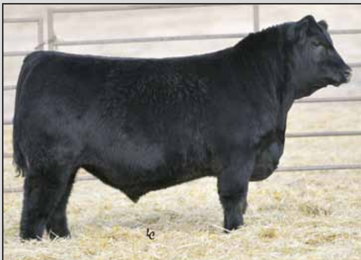
Lot 22, Ellingson Rider Pride 0260.