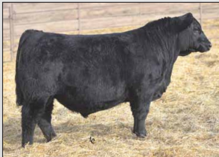
Lot 107, Ellingson Authorize 0395.

This is one of our favorite sets of flush brothers in the offering. They exhibit added width, muscle expression and the right level of performance to sire heavy feeder calves, yet still make daughters that will be fertile and easy fleshing and raise heavy calves. Their Pathfinder dam is a daughter of Tehama Blackcap Revolution and has recorded a nursing ratio of 7/104, a yearling ratio of 4/105, an IMF ratio of 4/109, a ribeye ratio of 4/110 and a calving interval of 365 days. She is the perfect blending of power, doability and function with superior production. Lots 107-109 are flush brothers.