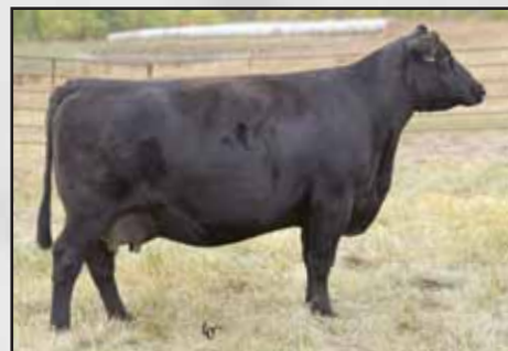
EA Emblynette 0025, a maternal sister to Lot 284's dam.