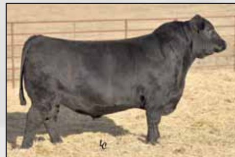
Ellingson Consistent 6235, a maternal brother to Lot 33's dam.