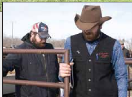
Right: Ruland Ranch owns a maternal brother to Lot 165.