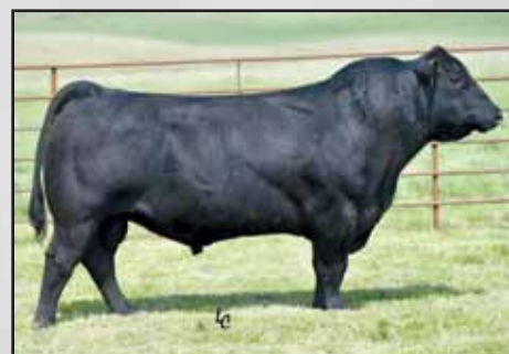
CTS Remedy 1T01's influence sells.