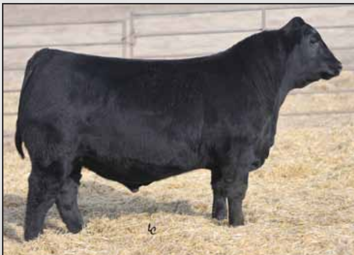
Lot 19, Ellingson Rider Pride 0087.