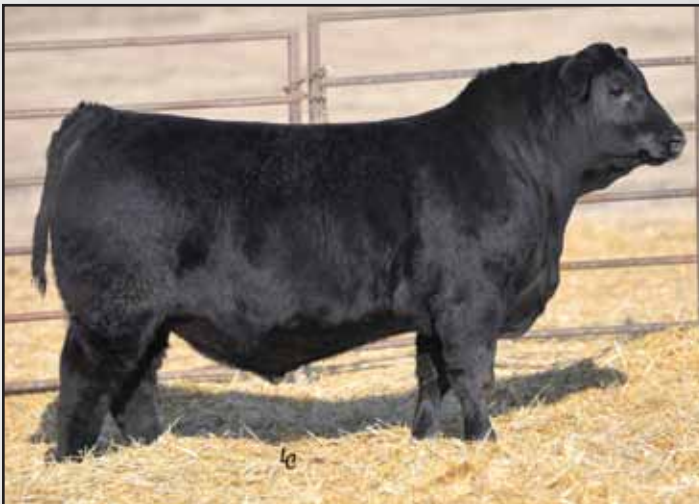
Lot 80, Ellingson Three Rivers 0316.

Ellingson Three Rivers 0298 is a dense-muscled, high-libido herdsire prospect that should add value for both the performance and maternal gauges of a cowherd. His Pathfinder dam by Wide Butt serves on the Ellingson Angus donor roster and has recorded a nursing ratio of 8/105, a yearling ratio of 5/108 and a ribeye ratio of 13/104. She also has a 365-day calving interval. Lot 81 is a maternal brother to multiple A.I. sires, including the $67,500 Ellingson Ribeye 3195 at Select Sires, the $27,500 Ellingson Chaps 4095 at ABS Global and the $18,000 Ellingson 26 17 Emulous 9147 owned with Sprunk Angus. Other maternal brothers are working for Tyler Messner, 12 Star Ranch, Arnston Ranch and Ham Ranch.