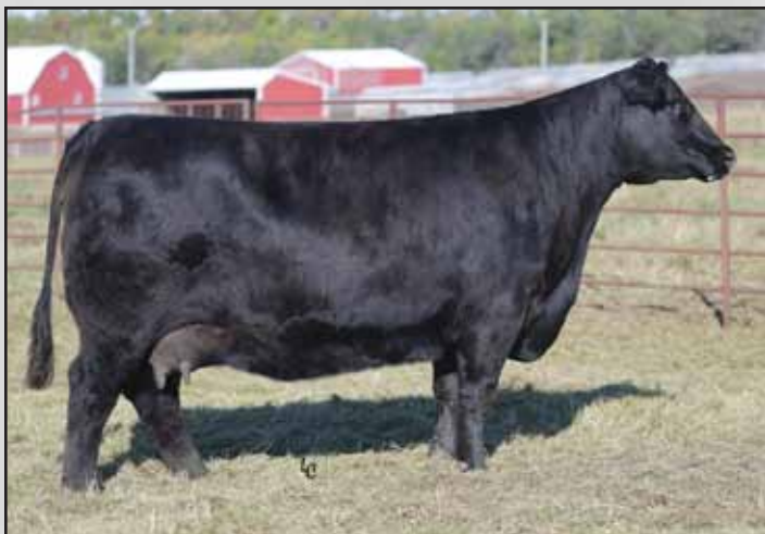
EA Primrose 5083, a maternal sister to Lot 160's dam.