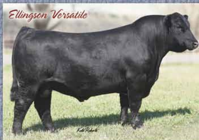
Sire: SAV Resource 1441 • MGS: Basin Max 602C Owned with: Talkington Angus Ranch, ND, & ST Genetics, TX