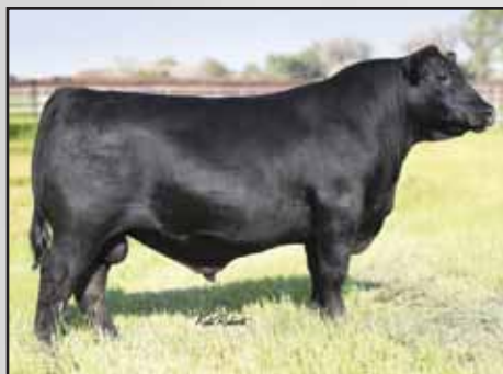
Ellingson Easy Rider, Lot 30's maternal brother.