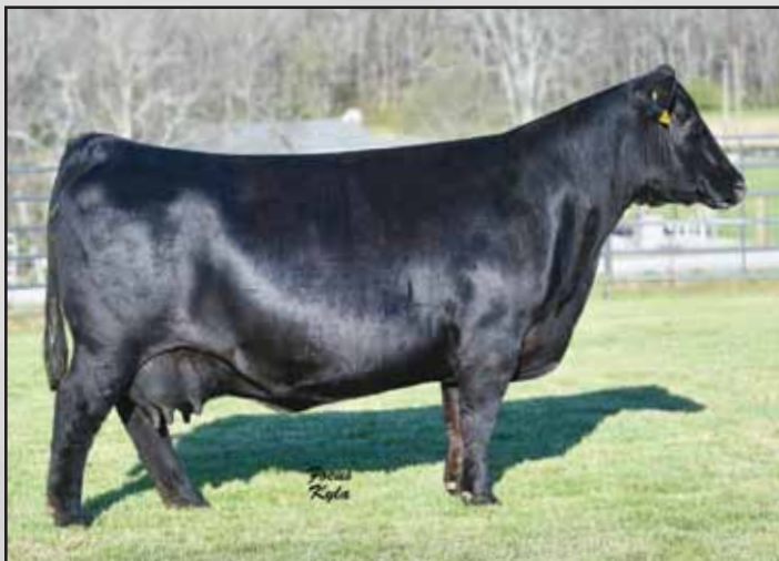
EA Emblynette 1195, Lot 77's maternal granddam.

Ellingson Three Rivers 0377 is a modest-framed Three Rivers son out of one of the easiest fleshing females on our operation. She is a direct daughter of Ellingson Roughrider 4202. Lot 75's maternal brother by Authorize was selected by Bill Pitz in our 2020 production sale.