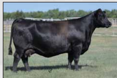
EA Bells Girl 2181, the maternal granddam of Lots 1 and 2.