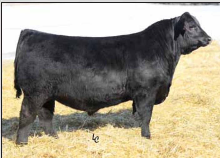
Ellingson Enterprise 3190, produced from a maternal sister to Lot 70's granddam.

This is a more modest-framed Three Rivers son in comparison to his brothers. He should contribute to the betterment of a cowherd in all profit measures. His added softness and muscularity should make him many friends on sale day. His young Authority dam is on a fast track to success, combining impressive body type with high-level production and consistent fertility. She has posted a production birth ratio of 2/95 and a nursing ratio of 2/105 and has settled to first-service A.I. every year of her production career. Her dam, EA Emblynette 5099, has served in our donor pen and is a maternal sister to the dam of the $35,000 Ellingson Enterprise 3190.