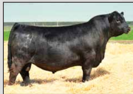
HA Cowboy Up 5405's influence sells.