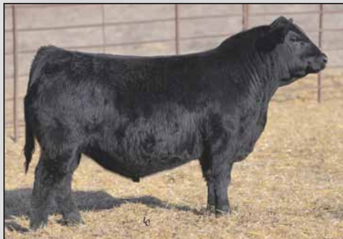
Ellingson 26 17 Emulous 9205, a maternal brother to Lots 143-145.