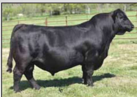
Ellingson Transcend 5212's influence sells.