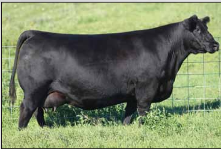
EA Rose 981, a full sister to the dam of Lot 306 and a full sister to Lot 307.

Lot 305's dam is a flush sister to EA Madame Pride 3072, the donor with many progeny featured in this sale and the mother of the $19,000 Ellingson Salute 3170. She is also a maternal sister to the $28,000 Ellingson Boardwalk 3032. She has posted a production nursing ratio of 6/103, a yearling ratio of 3/101 and an IMF ratio of 3/111.