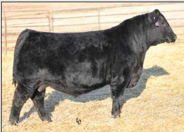
Lot 7, Ellingson Rider Pride 0177.