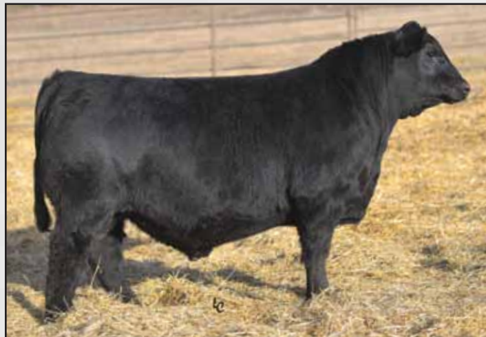
Lot 175, Ellingson Rainmaker 0204.

Lot 175 has a progressive pedigree, combining Rainmaker, Cowboy Up, Resource, Duke, Traveler 004 and Pro Trend. We believe this bull exemplifies trait balance, which we expect to translate to less inputs, but increased outputs, in his new owner's herd.