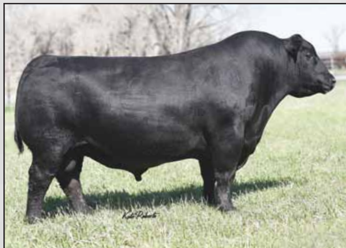
Ellingson Roughrider 4202, the maternal grandsire of Lots 96-98.

Lot 100 is a double-digit calving-ease-direct Authorize son we expect will work without problem on virgin heifers. He combines Authorize, Chaps, Territory, Traveler 004, Larks Canyon and EXT all in his immediate lineage. With those bulls anchoring his pedigree, expect his daughters to be adaptable to nearly all types of topography and climate. A maternal brother is working for Olson Farm and Ranch.