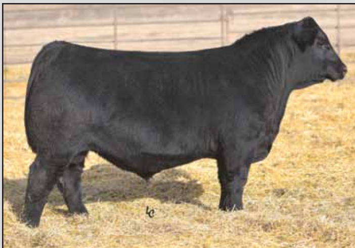
Lot 132, Ellingson Homegrown 0051.