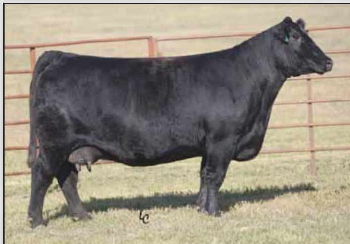
EA Emblynette 4274, a maternal sister to Lot 249's dam.

Here is another well-balanced Homestead son out of one of the top young cows in our program. His Roughrider dam is feminine, easy fleshing and structurally correct and has flawless udder suspension and teat size. She is a direct daughter of an elite Pathfinder donor, EA Emblynette 1077, the dam of Lots 59-66 in this sale. His maternal brother was selected by Eaves Angus Genetics as a calving-ease feature in last year's sale.