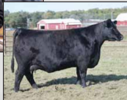
EA Emblynette 5159, Lot 22's maternal sister.

Scott Katus is among the producers who have purchased maternal brothers to Lot 22.