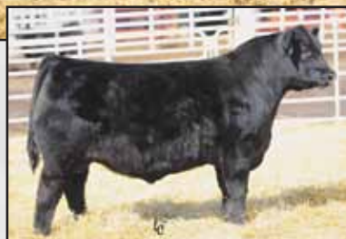
Left: Ellingson Commanche 3119, Lot 77's maternal grandsire.