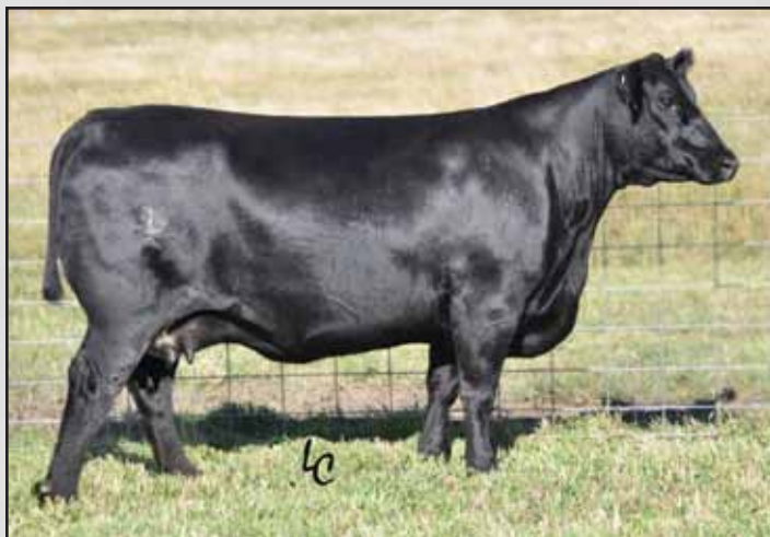
EA Blackclass 6821, Lot 193's maternal granddam.