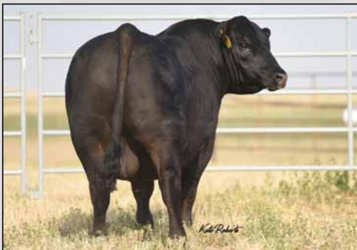
DL Dually, the sire of Lots 297-300.