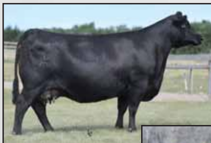
Left: EA Hyalite Lady 4306, the dam of Lots 297-300.