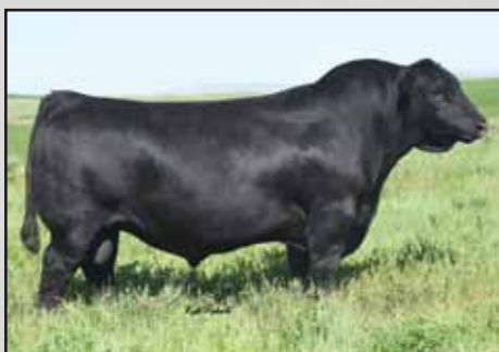
Ellingson Chaps 4095's influence sells.