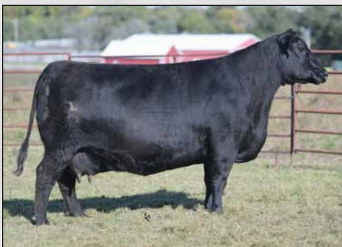
EA Madame Pride 3292, Lot 27's dam.