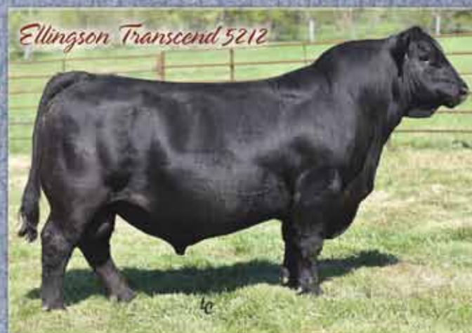
Sire: SAV Resource 1441 • MGS: Tehama Blackcap Revolution Owned with: Spickler Ranch North, ND