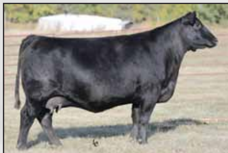
EA Rosetta 7361, Lot 187's dam.