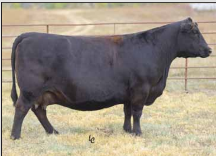
EA Queen Dolly 8804, Lot 24's maternal granddam.