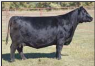
EA Blacklass 4024.