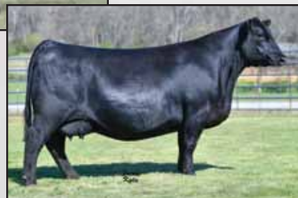
Right: EA Hyalite Lady 1333, the maternal granddam of Lots 297-300.