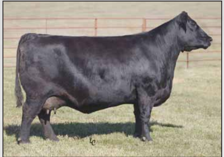
EA Madame Pride 3072, Lot 85's dam.