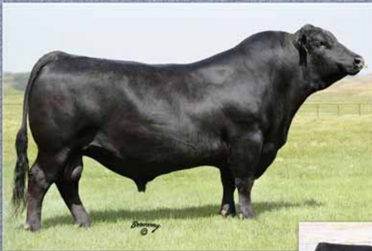
Ellingson Starman 4157