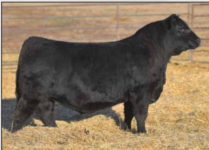
Lot 94, Ellingson Authorize 0380.