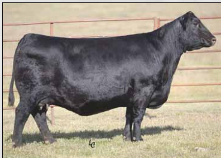
EA Blackclass 9232, Lot 48's dam.

Lot 49 is sure to add payweight, size and appetite for gain to your next load of feeder calves. His dam has recorded a production birth ratio of 7/98, a nursing ratio of 7/105, a yearling ratio of 5/103 and an IMF ratio of 4/105. McPherson Angus, Rick and Roy Reno, Bruski Ranch and Gottsch Cattle Company have selected maternal brothers in past production sales.