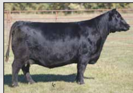
EA Blackclass 4024, Lot 248's maternal granddam.