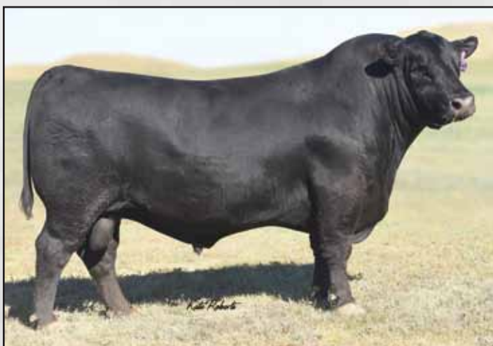
Ellingson Icon 5062, produced from a maternal sister to Lot 223's dam.

Ellingson Fundamental 0577 is a strong performance prospect with a royal pedigree. His elite Pathfinder dam has recorded a production birth ratio of 6/98, a nursing ratio of 6/105, a yearling ratio of 5/108 and an IMF ratio of 4/114. His dam is a maternal sister to the $30,000 Ellingson Frontiersman 7132, the $20,000 Ellingson Homestead 8028 and the $21,000 Ellingson Drover 6034. His maternal brother, Ellingson Consistent 6235, was the $23,000 selection by Arntzen Angus and Richard Angus Ranch in our 2017 sale. He has went on to be a potent breeding piece for them, siring Arntzens' high-selling sire group and now earning his spot on Breeder Link's sire roster. Four of his maternal sisters have been retained in our cowherd, including one that serves as a top-tier donor.