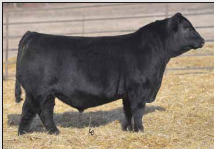
Lot 233, Ellingson Chaps 0414.