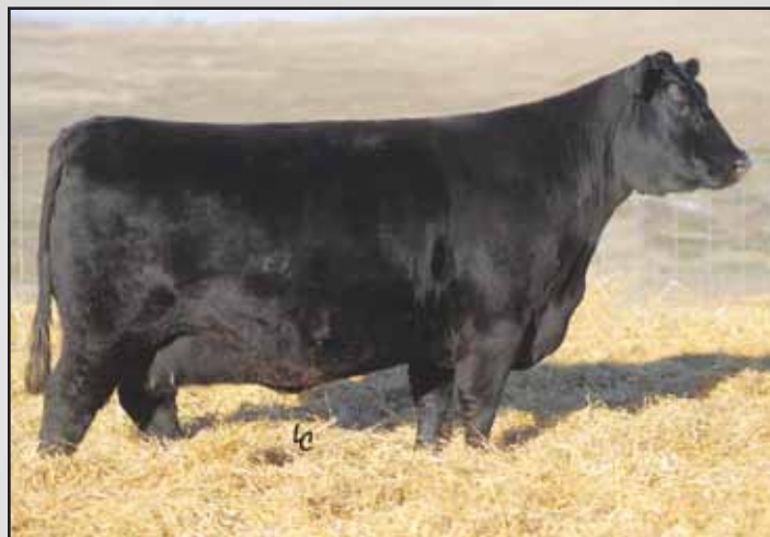
EA Queen Dolly 7813, Lot 230's maternal granddam.

Lot 230 is stout made and wide chested with flawless structural integrity. His genomic profile ranks him with the best in the breed for weaning and yearling weight, scrotal circumference, milk, carcass weight, ribeye area and tenderness. His powerhouse Resource dam has a nursing ratio of 2/103, a yearling ratio of 1/106 and a 365-day calving interval. She is a maternal sister to the $25,000 Ellingson Identity 9104.