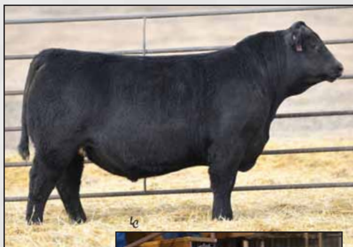
Above: Lot 166, Ellingson Frontiersman 9903.

Like the Roughrider line has become so well known for, Ellingson Roughrider 9867 possesses an extraordinary amount of body capacity and rib shape. He comes straight out of our embryo transfer program. His donor dam is a lead matron in our fall program, where she sets a high standard for combining the best in a powerful, easy-doing phenotype with production that will consistently top all other contemporaries. Four of Lot 165's maternal sisters have been retained in our cowherd. A maternal brother is working for Ruland Ranch.