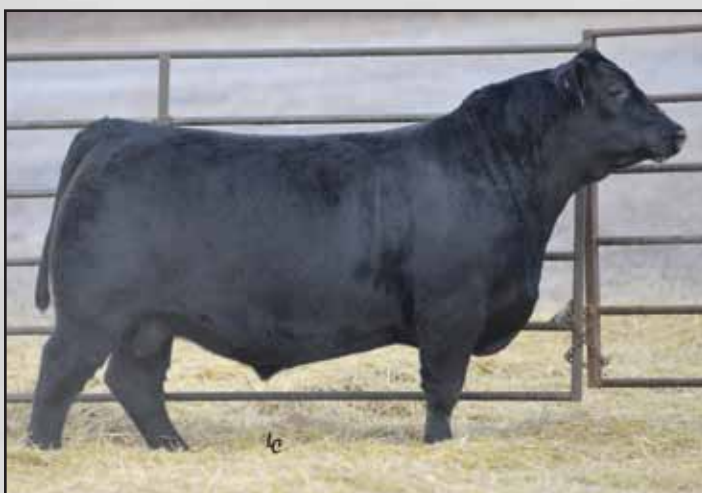
Lot 136, Ellingson Homegrown 9826.

A royal flush of quality backed by proven and predictable genetics, these long-age Homegrown sons are out of one of our top donor cows. Blending power, pounds and maternal superiority, expect these flush brothers to add value to all segments of your ranching operation. Their Connealy Earnan dam has posted a production birth ratio of 5/94, a nursing ratio of 5/104 and a yearling ratio of 4/104. Their maternal brothers have highlighted past sales and are now working for the progressive outfits of Prairie Diamond Ranch, Ham Ranch, Entze Ranch and Doug Maher. Four of their flush sisters have been retained in our herd to carry on the EA Primrose 3149 legacy here. Lots 136-139 are flush brothers.