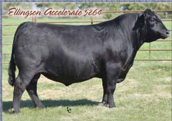
Ellingson Accelerate 5264

Sire: Koupal Advance 28 • MGS: Ellingson Plateau 1155 Owned with: ST Genetics, TX