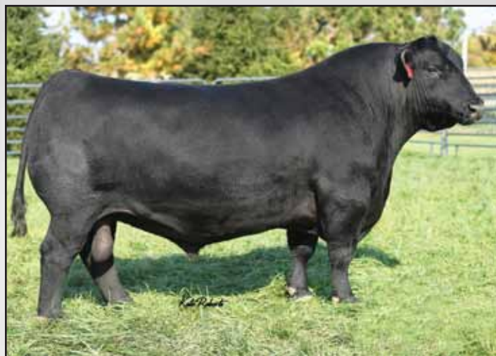
Ellingson Homestead 6030, a maternal brother to Lots 102 and 103.

If you are in search of a bull suitable for virgin heifers but that won't sacrifice top shape and dimension, study Ellingson Authorize 0295. His dam has a production birth ratio of 2/99, a nursing ratio of 2/100, a yearling ratio of 1/105 and an IMF ratio of 1/114 and has settled to first-service A.I. all three years of her production career. His maternal brother was a feature calving-ease bull selected by Lawlar Ranch in last year's sale.