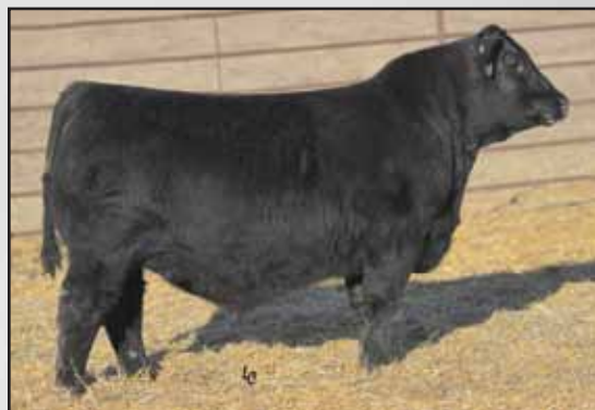
Ellingson Roughrider 9369, a maternal brother to Lots 93 and 94.