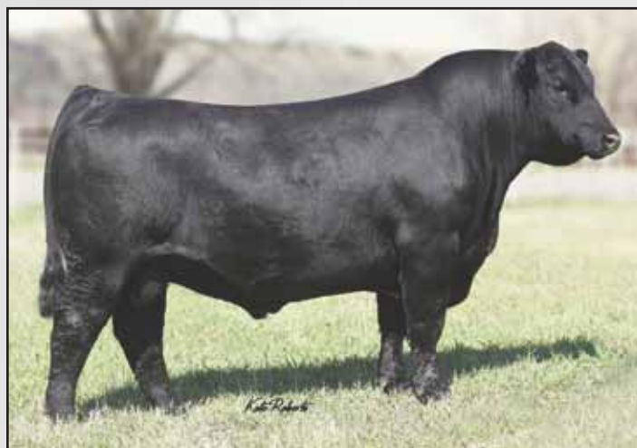
Ellingson Versatile, a maternal brother to the dams of Lots 265 and 266.

Ellingson Powerpoint 0701 is a well-balanced and functional bull that will be safe to use on virgin heifers. His Advance mother is a modest-sized, easy-keeping female with superior udder quality. She is a product of our embryo transplant program and is a part of a large flush of females that have started off strong production careers. A maternal brother was selected by Bruski Ranch in last year's production sale.