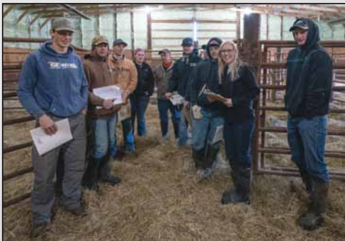
It takes a village to host a sale. We are grateful for these "Village People."