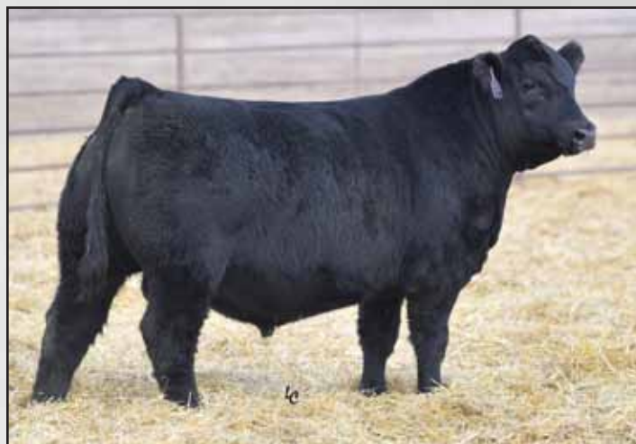
Lot 270, Ellingson Raindance 0180.