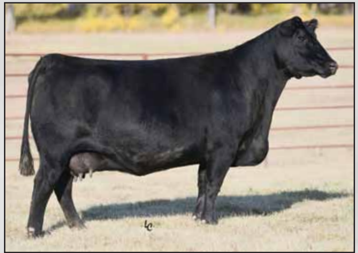
EA Abigale 6207, Lot 34's dam.

This is a powerhouse pair of flush brothers that should find many friends on sale day. Lot 35 earned the top actual and 205-day adjusted weaning weight of any bull in the offering, a feat not easily accomplished. Both these bulls boast tremendous performance, power, explosive body capacity and fluent structural soundness. Best of all, their donor dam, EA Blackcap 4053, is one of the top females on the ranch and has earned Pathfinder status with a production birth ratio of 5/97, a nursing ratio of 5/107 and a yearling ratio of 3/102. Their maternal brother, Ellingson Homestead 8202, was the $22,000 Lot 1 bull in our 2019 production sale. Other maternal brothers are working for Marty Buseman and Harris Ranch, while seven of their maternal sisters have been retained in our cowherd. Lots 35 and 36 are flush brothers.