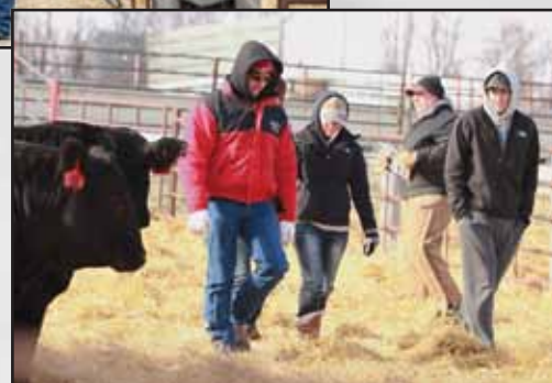
Right: Rhein Valley Farms selected a maternal brother to Lot 10 in our 2020 sale.