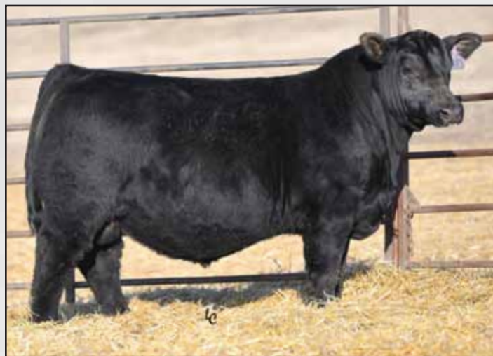
Lot 38, Ellingson Three Rivers 0082.