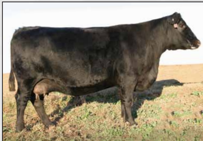
EA Emblynette 434, Lot 228's maternal granddam.

Here is a moderate-framed Commissioner son that covers all the bases to produce profitable cattle. His pedigree lines together Commissioner, Transcend, Territory, Bushwacker and the Emblynette cow family. A maternal brother was selected by Penhros Farms in our 2020 production sale.