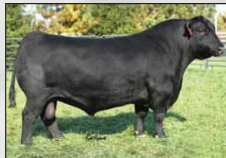
Ellingson Homestead 6030's influence sells.