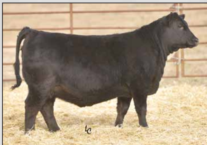
EA Emblynette 7480, Lot 192's maternal sister.

Ellingson Bandwagon 0258 offers truly new and refreshing genetics that likely could be utilized by any longtime Ellingson Angus patrons. He came off his dam at 870 pounds and earned a nursing ratio of 107. His Remedy granddam, EA Emblynette 4274, was the $19,000 top-selling female in 2015 to Van Zee Cattle Company, where she has gone on to be frequently flushed, much like her Pathfinder dam before her.