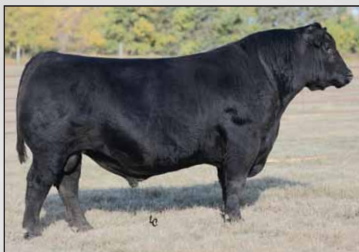
Ellingson Authorize 7057, a maternal brother to Lots 127-131 and to the dam of Lot 126.