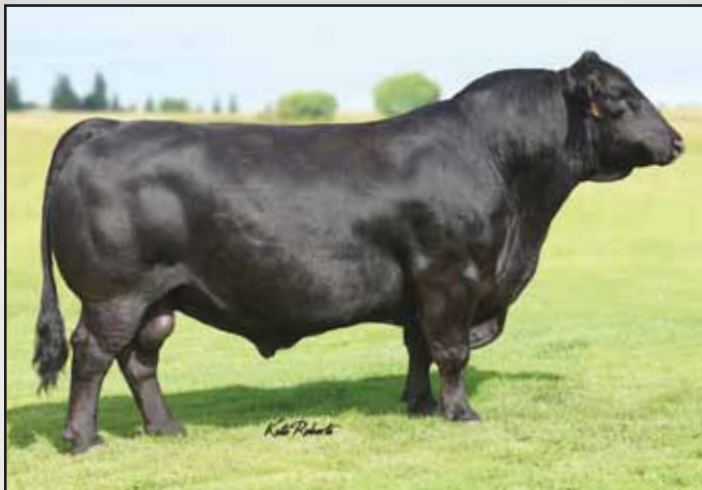
Ellingson Real Business 5168, a maternal brother to Lot 277's dam.

Ellingson Raindance 0060 offers more size and stretch than most of his paternal counterparts. He reigns from the Madame Pride cow family that has produced a countless number of impactful breeding sires.