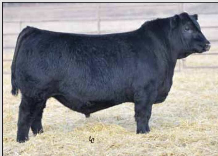
Lot 48, Ellingson Three Rivers 0002.

Ellingson Three Rivers 0271 is a moderate-framed bull with added muscle definition and a well-balanced phenotypic package built for a long-term contribution. His Accelerate dam from the Blackclass cow family is a deep-flanked, production-oriented cow with near-perfect udder structure, teat size and placement. She has settled to first-service A.I. all three years of her production career. A maternal sister is working for 1 Bar Ranch.