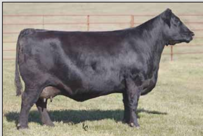
EA Madame Pride 3072, a flush sister to Lot 305's dam and Lot 310's granddam.