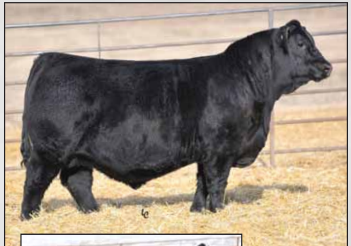
Above: Lot 35, Ellingson Three Rivers 0052.