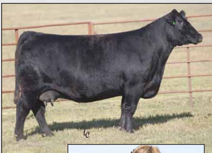
Above: EA Emblynette 4274, a maternal sister to Lots 59-66.