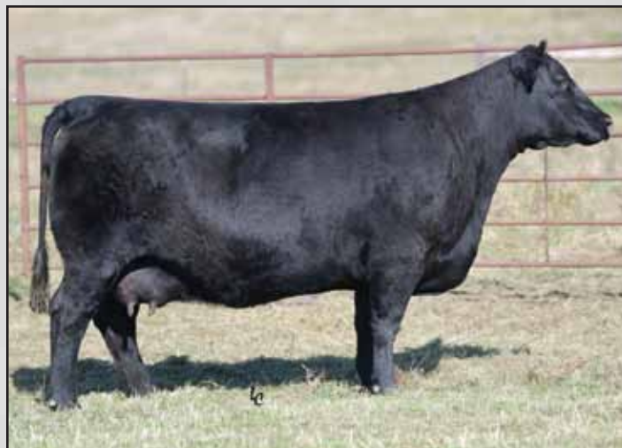
EA Miss Blackbird 5054, the dam of Lots 37-42.