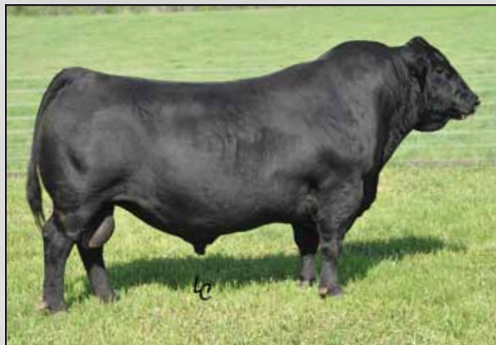
LT Bandwagon 3105, an anchor sire in the pedigrees of Lots 270-272.