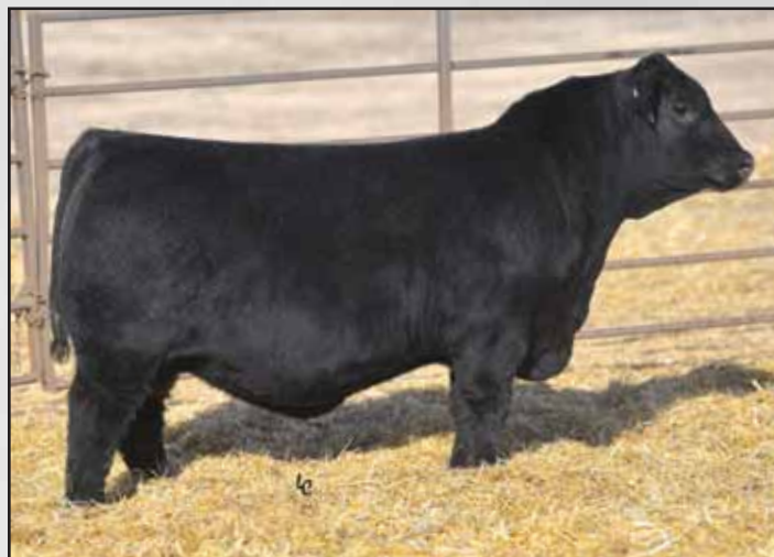
Lot 117, Ellingson Homegrown 0121.

Ellingson Homegrown 0121 puts together one of the most balanced phenotypic and genotypic packages of any bull in the offering – a near-perfect blending of softness, power and athleticism. Ranchers who place a premium on eye appeal will certainly appreciate this bull. He stood out in the performance department too, coming off his 2-year-old dam at 930 pounds and earning a nursing ratio of 115. You can expect foot integrity to be second to none in this bull too, as he combines two proven breed leaders for claw and angle EPDs, Homegrown and Plateau. Lot 117's dam is a favorite amongst the bred heifers we calved out this past spring and a maternal sister to the $32,500 Ellingson Stetson that sold to Alta Genetics in our 2015 production sale. His grand-dam is a staple of our breeding program and has earned elite Pathfinder status. His no-holes EPD package and outcross pedigree to many of the popular lines of cattle today should make him employable in many cattle outfits. Without question, Lot 117 is one of the top Remedy descendants we have produced to date.