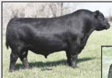
Ellingson Roughrider 4202, the paternal grandsire of Lots 1-32 and a maternal brother to Lot 13's dam.