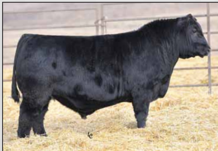
Lot 207, Ellingson 26 17 Emulous 0081.

Lots 207-211 are true stock bulls that will add value to any commercial program's bottomline. They are uniformly stout-muscled with added bone and shape. Their female flushmates are all angular designed and soft middle, have a production-oriented appearance and, even at a young age, look like they should have superior udder quality. Their donor dam is a flush sister to the $19,000 Ellingson Salute 3170 and a maternal sister to the $28,000 Ellingson Boardwalk 3032. She is a fourth-generation donor herself, descending from the $52,000-valued EA Pride 346 as her dam and many other notable females before that. She has a production nursing ratio of 6/103, a yearling ratio of 4/104, an IMF ratio of 8/109 and a 365-day calving interval. Maternal brothers are working for Jacobs Ranch, DBW Ranch, Larry Thompson and Gullickson Ranch, while another is featured in this sale as Lot 85. Lots 207-211 are flush brothers.