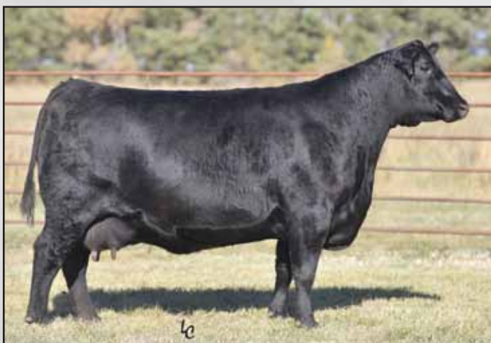
EA Primrose 3149, the dam of Lots 136-139.