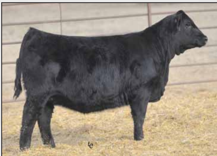
EA Hyalite Lady 9304, a maternal sister to Lot 32's dam.

This strong-topped, wide-based Rider Pride son comes right out of the legendary Everelda Entense cow family. A maternal sister to Lot 29 was selected by Katus X7 Ranch in our 2019 production sale.