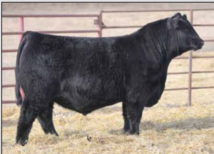
Lot 12, Ellingson Rider Pride 0058.