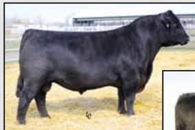
Ellingson Plateau 1155, the maternal grandsire of Lots 117-126.

These brothers boast balanced-trait packages, added mass, volume and width, a strong maternal foundation and impressive carcass merit. Their donor dam recorded a nursing ratio of 4/103, a yearling ratio of 2/108 and a ribeye ratio of 3/106. They are maternal brothers to the $77,500 Ellingson Authorize 7057 at ABS. Lots 127-131 are flush brothers.