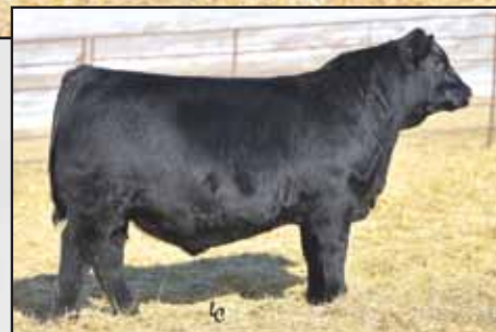
Left: Ellingson Homestead 8202, a maternal brother to Lots 35 and 36.