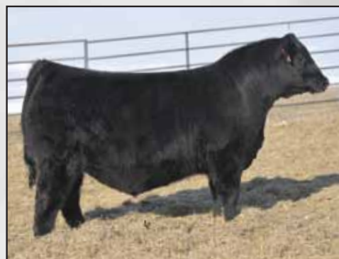
Ellingson Homegrown 9162, Lot 196's maternal brother.