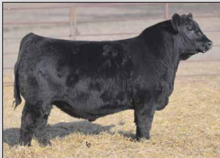
Ellingson 26 17 Emulous 9346, a maternal brother to Lot 7's dam.