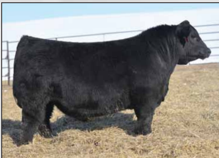
Ellingson Snapshot, Lot 71's maternal brother.

Ellingson Three Rivers 0071 is a maternal brother to Ellingson Snapshot, the Genex sire that was a featured calving-ease lot in our 2020 production sale and has been proclaimed by many who see him at stud as one of the most phenotypically intriguing bulls to have sold anywhere in America last year. Lot 71 came off his dam at 920 pounds this fall and earned a nursing ratio of 105. Another maternal brother is working for the Diamond Cross Ranch.