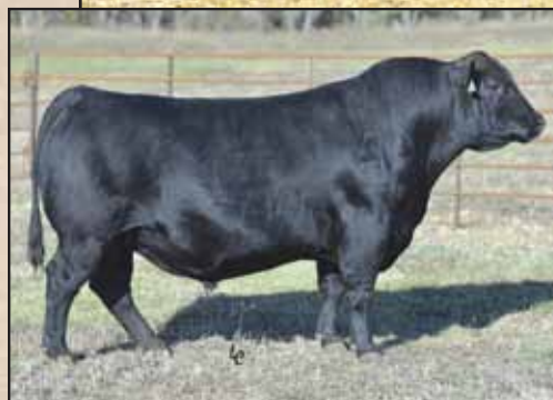
Left: Ellingson Boardwalk 3032, a maternal brother to the dam of Lots 99 and 100.