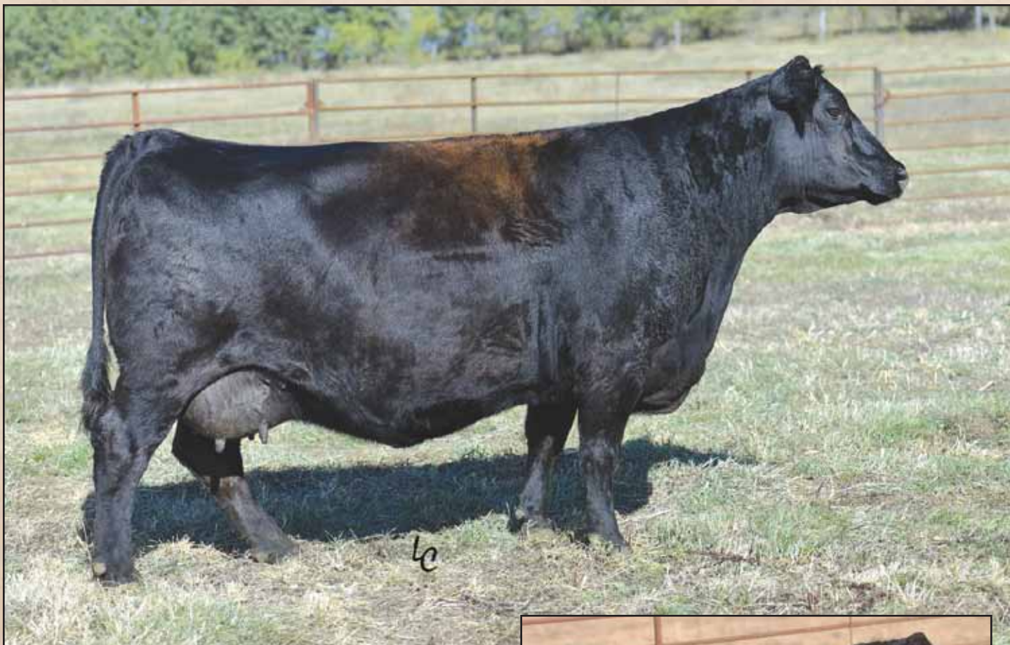
Lot 243, EA Rosetta 1127.