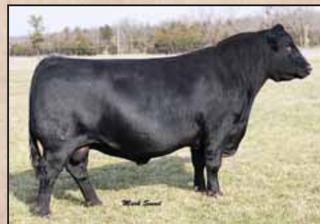
Ellingson Identity 9104's influence sells.