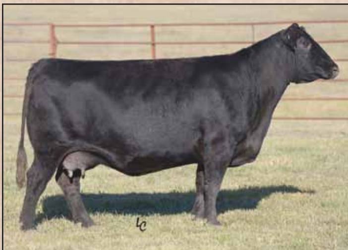
EA Blackcap 0360, Lot 129's dam.

This bull is a maternal brother to the popular ABS Global sire Ellingson Chaps 4095, the $27,500 feature in our 2015 sale. His Pathfinder dam has a birth ratio of 6/100, a nursing ratio of 6/104, a yearling ratio of 4/110, an IMF ratio of 6/102 and a ribeye ratio of 6/101.