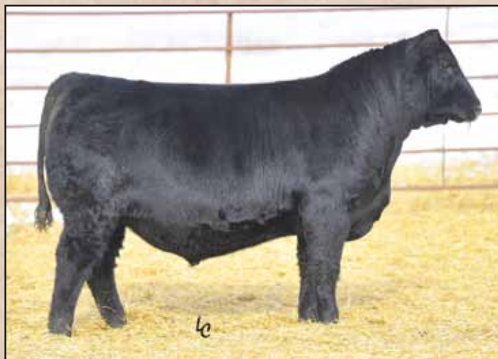
Lot 78, Ellingson Chaps 8025.

Ellingson Chaps 8025 is one of our favorites in the entire offering. He perfectly illustrates what our breeding program is driven to propagate. He boasts as strong of a maternal lineage as any in the offering, combining Chaps, Motivation, Territory, Traveler 004 and Saugahatchee. He is the product of many generations of strategically planned matings focused around making females with longevity. This bull is balanced both on paper and in the flesh. He is smooth designed with outstanding depth of flank and adequate base width and, most importantly, can move like an athlete. He has a strong curve-bending spread and out-does his popular sire. He ranks in the top fifth percentile for CED, the top 11th for birth, the top 15th for weaning, the top eighth for yearling and the top fourth for docility in his genomic profile. His performance rankings were validated coming off his dam at 975 pounds and earning a weaning ratio of 114. For those with a passion to develop an elite set of females that require few inputs and never get old looking at, this is one of the best young bulls to do just that.