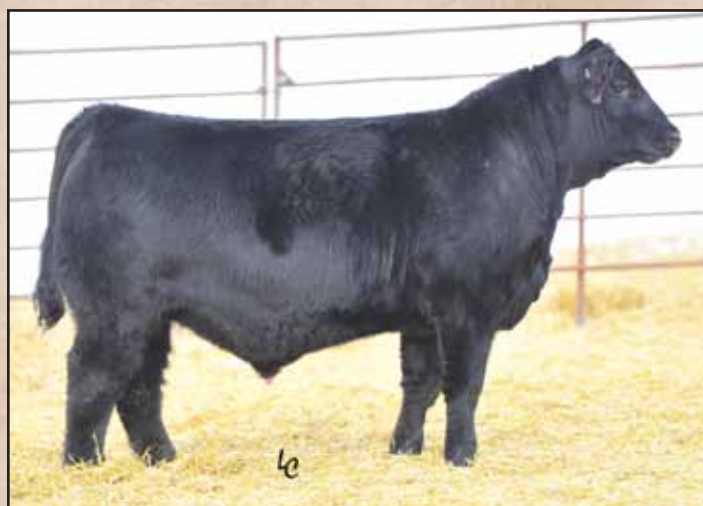
Lot 33, Ellingson Homegrown 8160.

Ellingson Homegrown 8309 is a wide-based Ellingson Homegrown son that is suitable for use on virgin heifers. He will perpetuate depth of body, substance and functionality in his calves. His Chaps dam comes from the foundation Emblynette cow family that is the most populous cow family at Ellingson Angus today.