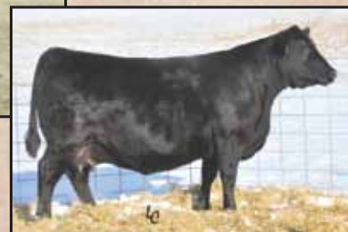
EA Pride 346, Lot 85's maternal granddam.