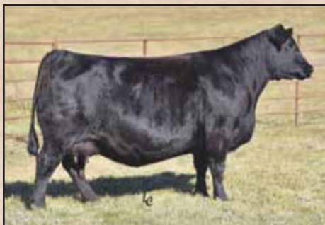
EA Blanche 1137, Lot 222's maternal granddam.