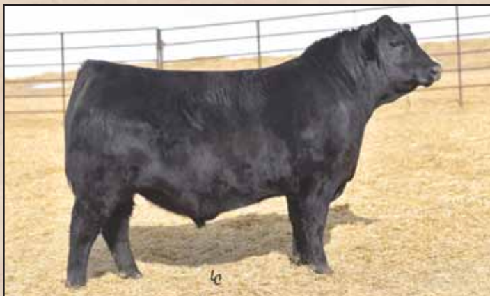
Ellingson Homegrown 6035, produced from a maternal sister to Lots 21 and 22 and Lot 23's dam.