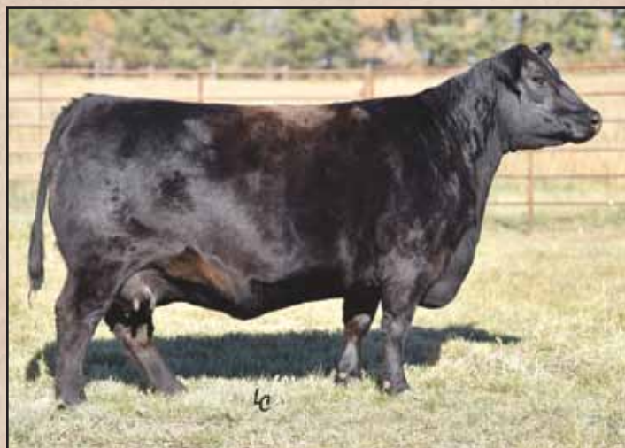
EA Queen 3325, Lot 16's maternal sister.