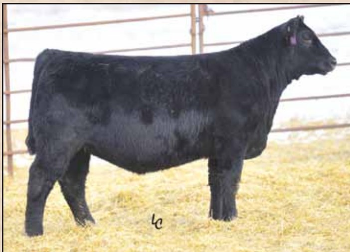
Lot 220, EA Queen Dolly 8082.