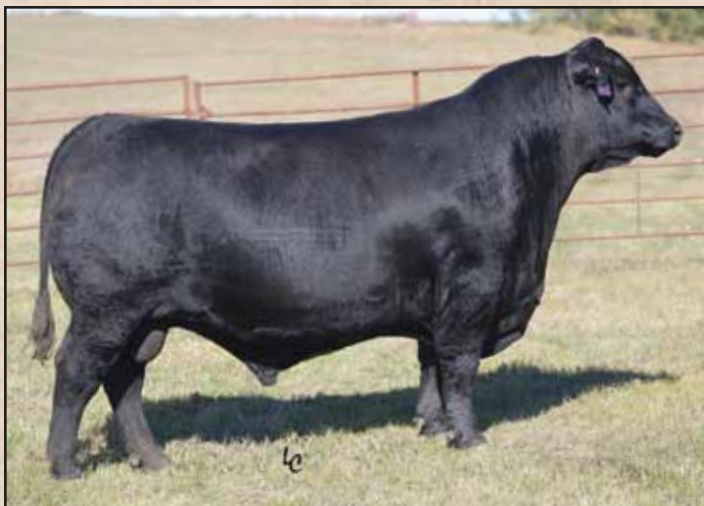
Ellingson Roundup 6206, the sire of Lots 97 and 98.