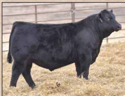
Ellingson Remedy 6078, Lot 1's maternal brother.