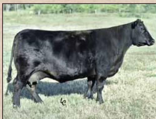
EA Blackclass 8914, Lot 3's dam and Lot 4's maternal granddam.

"Excellence is a continuous process, not an accident."