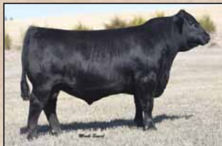
Ellingson Real Business 5168, a maternal brother to the dam of Lots 56 and 57.