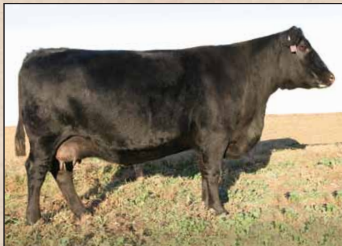
EA Emblynette 434, the maternal granddam of Lots 62 and 63.