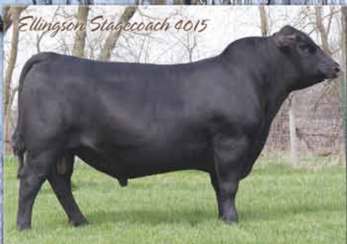
Ellingson Stagecoach 4015

Sire: Koupal Advance 28 • MGS: Ellingson Scotsman 0010 Owned with: Diamond J Angus, ND, & Alta Genetics, Canada