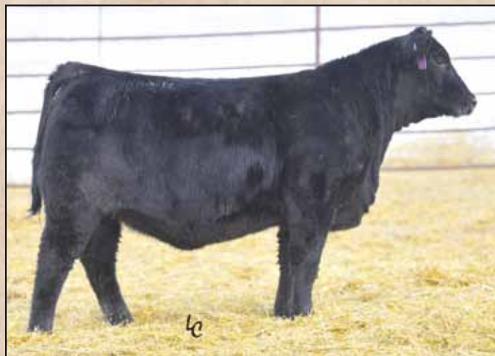
Lot 225, EA Emblynette 8119.

This Emblynette heifer has a negative birthweight and a breed-leading ribeye EPD. She is from the Homegrown-Traction mating that is responsible for some of the best stock in this offering. She is wide based and boldly sprung with added muscle shape. We expect this heifer will produce many powerhouse bulls that are still within reason for calving ease. She stems from the EA Emblynette 104 donor and has sires like EXT 6106 and Bushwacker in her immediate pedigree. She earned a birth ratio of 97 and a weaning ratio of 103.