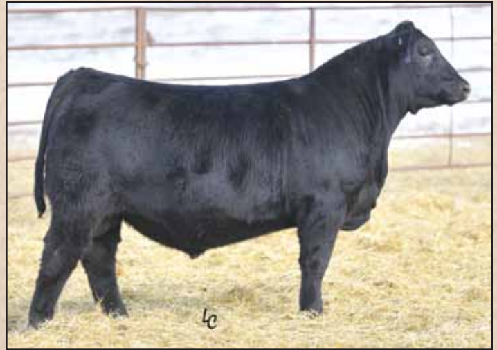
Lot 6, Ellingson Homestead 8028.

Cattlemen that appreciate balance and eye appeal won't have a difficult time finding this bull. He combines the best of his popular A.I. sire and donor dam. He headlines an impressive flush out of EA Primrose 9155, a favorite of visitors. He should be suitable to work on virgin heifers. His pedigree combines some of our finest work in the maternal department. This bull is a near replica of Ellingson Drover 6034, a 7/8 brother that was selected by Henderson Farms and Boettcher Angus in 2017 for $21,000. A maternal brother, Ellingson Frontiersman 7132, was the lead-off bull in last year's sale. He sold to Van Zee Cattle Company, Wright Charolais and Angus and Maher Ranch for $30,000.