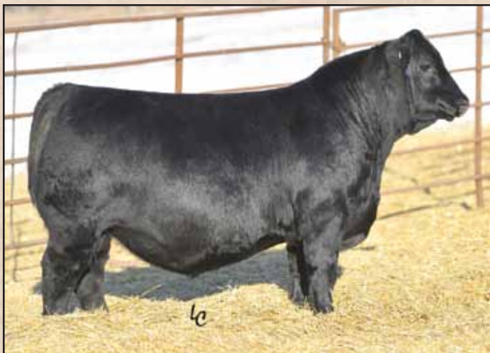
Lot 63, Ellingson Transcend 8161.