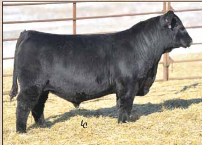
Lot 148, Ellingson Cowboy Up 8156.

Ellingson Cowboy Up 8156 is a bull intentionally mated with the progressive commercial cattle producer in mind. He combines the outcross growth of Cowboy Up with a Territory daughter that is the broodiest female on the ranch. His dam is an absolute powerhouse female that is heavy milking and boasts a calving interval of 362 days. He weaned off his dam at an impressive 980 pounds to earn a weaning ratio of 111. He has even surpassed our expectations for performance targets and outstanding eye appeal. His genetic potency will give him the ability to sire feeder calves that will bring a premium in whatever market conditions. Maternal brothers to Lot 148 are working for Dieder Ranch, Dallas Schott, Tim Schmidt and Craig Braaflat.