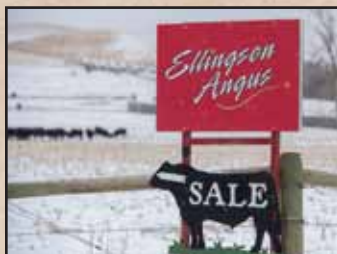
Sale day is approaching. A hotel block is available at the Ramkota.