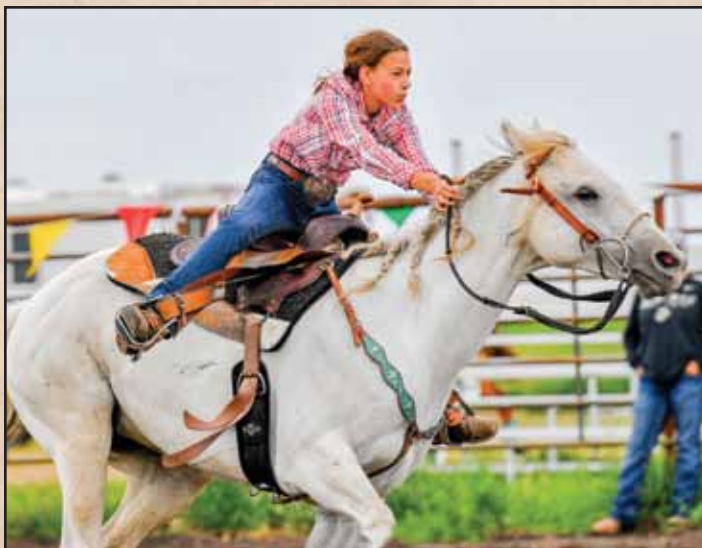
Medora and her new barrel-racing steed Cocoa Baby are discovering that dreams are accomplished outside comfort zones.