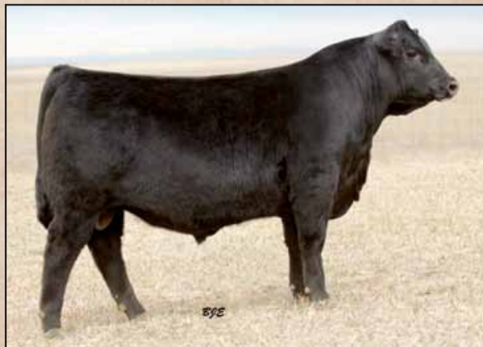
EA Scotsman 0010, a maternal brother to Lot 64's dam.