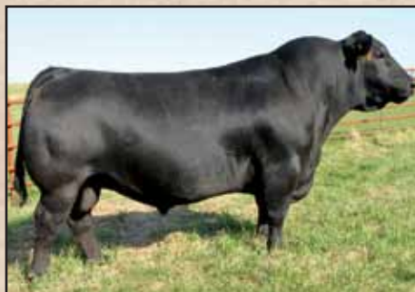
SAV Resource 1441's influence sells.