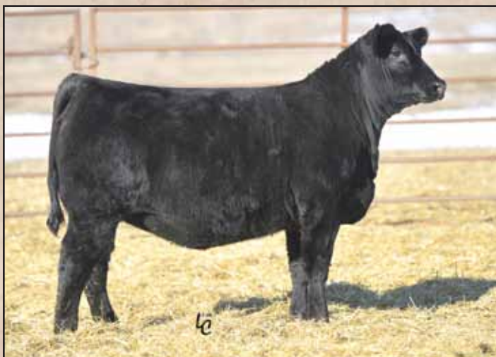
Lot 222, EA Blanche 8355.

EA Blackclass 8328 is one of Stetson's favorites in the offering. She portrays her sire's maternal capabilities well. She is designed nearly flawlessly and has the type and kind to immediately grab your attention as soon as you enter her pen. She is feminine and smooth designed with added extension, rib shape and a powerful top and rear quarter. Her dam is a model Angus female with excellent structural soundness, udder and foot quality, angularity and depth of side. After you study her powerful physical display and look at her genomic and EPD tabulations, it is a no-brainer that she belongs in an elite category. She ranks in the second percentile for CED, the first percentile for birthweight, the 19th percentile for weaning weight and the fourth percentile for yearling weight. Her curve-bending EPD spread and strong dollar indexes offer plenty of mating flexibility.