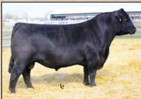
Ellingson Plateau 1155's influence sells.