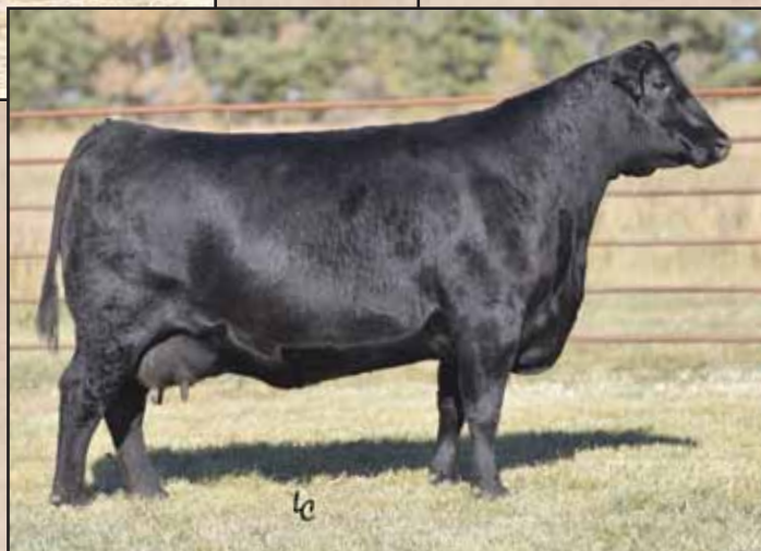
Right: EA Primrose 3149, Lot 190's dam.