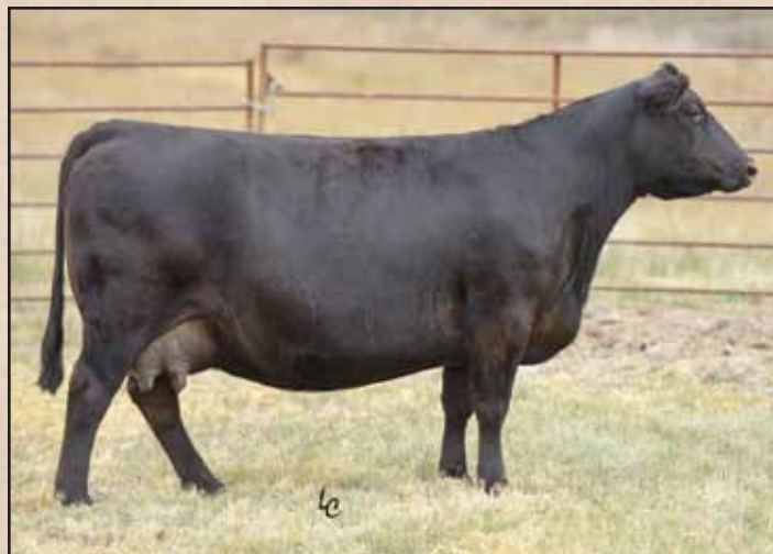
EA Queen Dolly 9205, a maternal sister to Lot 32's dam.