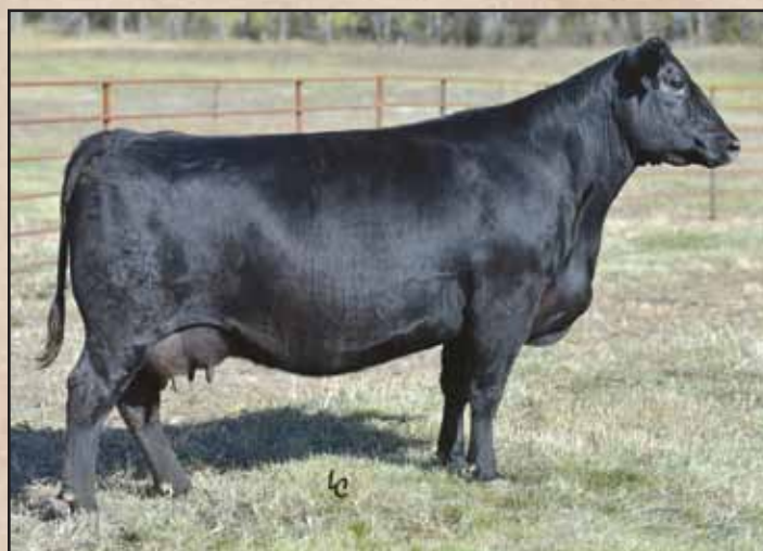
EA Hyalite Lady 1333, a maternal sister to Lot 81's dam.