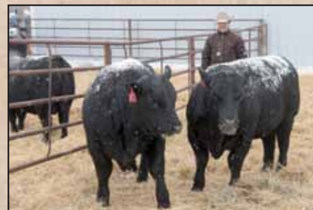
Jeff Kuntz owns a maternal brother to Lot 121.