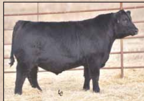
Ellingson Progressive 7170, service sire.