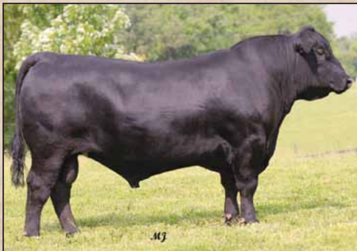
Ellingson Secretary 2011, a maternal brother to Lots 112 and 113.