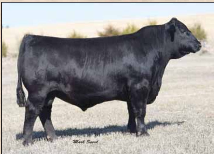
Ellingson Real Business 5168, a maternal brother to the dams of Lots 67 and 68.