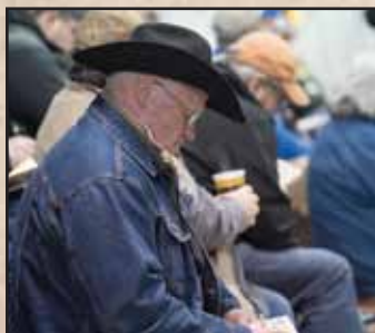
Kelly Dressler also owns a maternal brother to Lot 173.