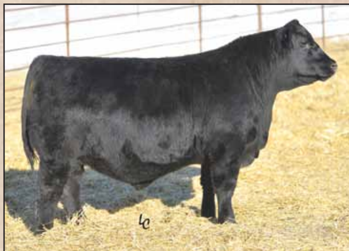
Lot 121, Ellingson Roughrider 8218.