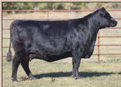
EA Emblynnette 4098, Lot 62's dam.