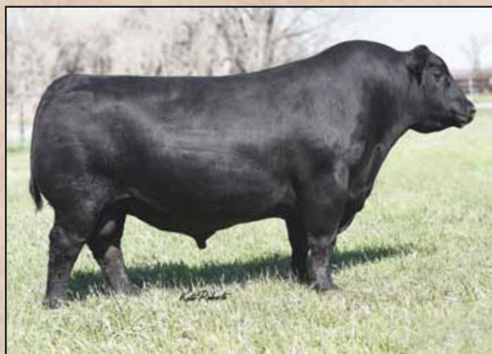
Ellingson Roughrider 4202, a maternal brother to Lot 218's dam.

Lot 219 has added substance and muscle. He represents the first calfcrop of the $580,000 Baldrige Colonel. His donor dam stems from the globally popular Forever Lady family.