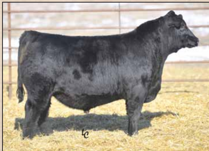
Lot 45, Ellingson Powerpoint 8010.