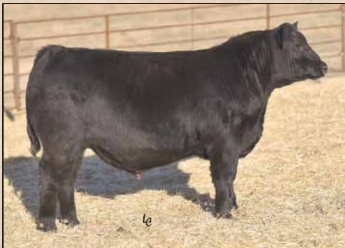
Ellingson Pinpoint 7168, Lot 68's maternal brother.