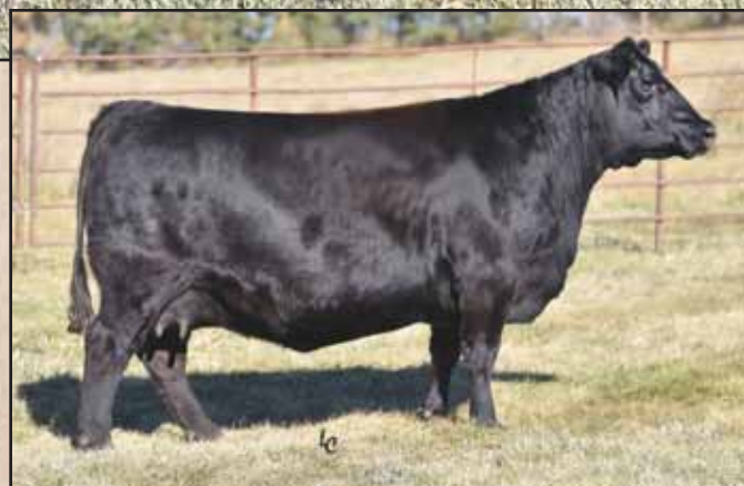
EA Emblynnette 3311, Lot 246's maternal sister.