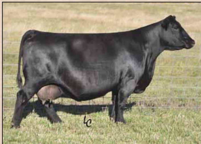
EA Emblynnette 401, Lot 245's anchor dam.