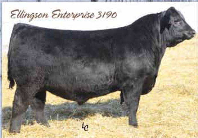
Ellingson Enterprise 3190

Owned with: Sprunk Angus, ND, & Brenner Angus, ND