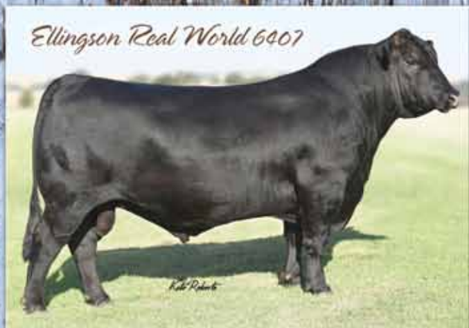
Ellingson Real World 6407

Sire: CTS Remedy 1T01 • MGS: Ellingson Identity 9104 Owned with: Alta Genetics, Canada