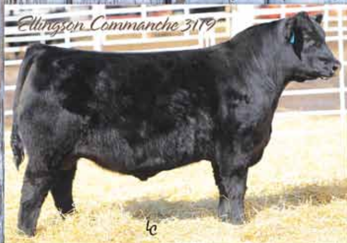
Ellingson Commanche 3179

Owned with: Lindskov-Thiel Ranch, SD; Genex, WI; Benfield Farm, VA; & TJ Cattle, VA