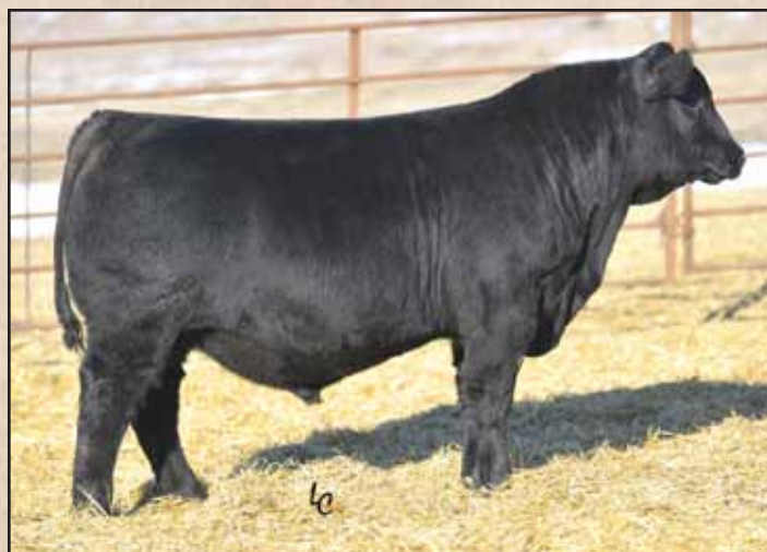
Lot 2, Ellingson Homestead 8062.

Ellingson Homestead 8062 is a legendary breeding bull in the making. He more than fulfills all the parameters to be considered with the most elite. He is one you will like from a genomic and EPD standpoint, but, most importantly, he is one you'll like for his type and kind when you see him in person. His performance resume is second to none and would rank with the best that have ever graced Ellingson Angus. Rarely do you come across a bull like this with so much power paired with flawless phenotypic balance and structural integrity. Like his sire, who is the high-selling bull for our ranch, Lot 2 portrays an unmistakable herdbull presence with tremendous length of side and levelness. He pounded down the scales this past fall at 1,025 pounds to earn a weaning ratio of 120. He was a masterpiece to observe as he stood next to his dam this fall, as he had nearly outgrown her. All the while, she stayed in great condition. She is everything we look for in a brood female and has a bright future ahead here. His Pathfinder granddam has left a tremendous legacy here too, along with his great-granddam, the $35,000-valued donor that is the matriarch of our favorite Emblynette females. Ellingson Commissioner 7267 is a 7/8 brother to his dam. He sold to Wright Charolais and Angus for $18,000 and was used in our program. Make sure to spend a little extra time studying him, as his credentials are in short supply today.