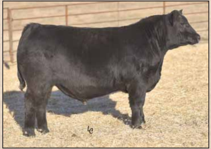
Ellingson Pinpoint 7168, Lot 56's full brother in blood.

This bull offers an outcross pedigree that is hard to find. He is what we'd consider a no-holes bull with the ability to advance your program. You'll be sure to appreciate him both phenotypically and genotypically. He aligns Powerpoint, Dominance and Larks Canyon in his pedigree. He came off his 2-year-old dam at 935 pounds to earn a weaning ratio of 110. His granddam was a long-time producer here. Many of her daughters are still working here today.