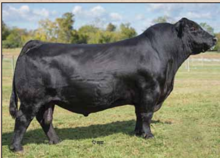
Connealy Capitalist, the sire of Lots 214 and 215 and Boyd Authority 3100.