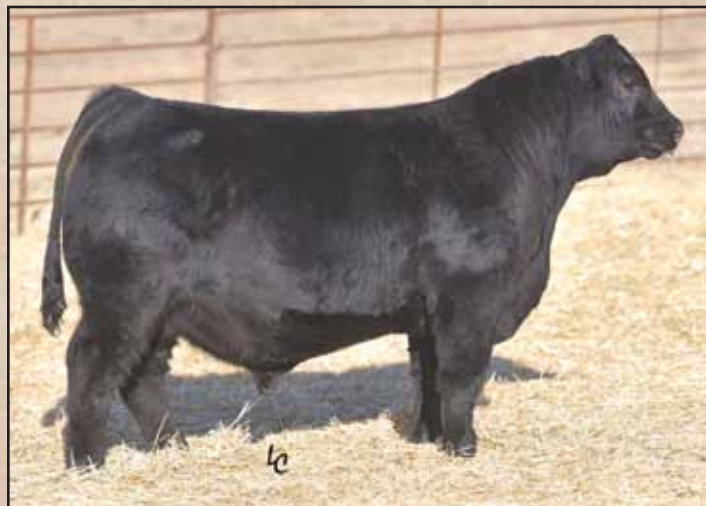
Ellingson Theodore 7159, Lot 14's maternal brother.