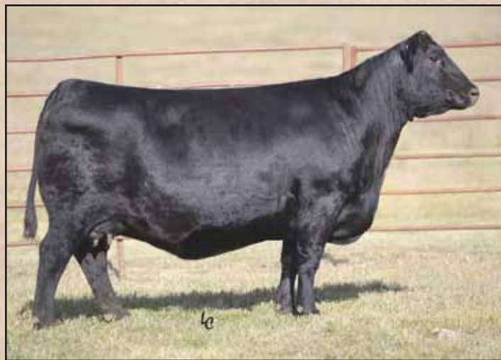
EA Blackclass 9232, Lot 139's dam.