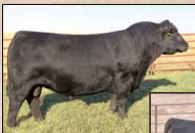
Right: Ellingson Herdsman 6648, the maternal brother to the dam of Lots 150-156.

Here is one of the top weaning- and yearling-EPD bulls in the sale. This embryo son ranked in the fifth percentile for weaning weight, the third percentile for yearling weight and the eighth percentile for carcass weight, scrotal, docility and tenderness. His well-balanced dam is out of an impressive group of flush sisters from the Queen Dolly 7813 donor. His extra age should allow him to cover more cows this summer.