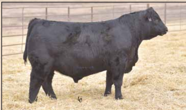
Ellingson Fort Laramie 6169, Lot 30's maternal brother.