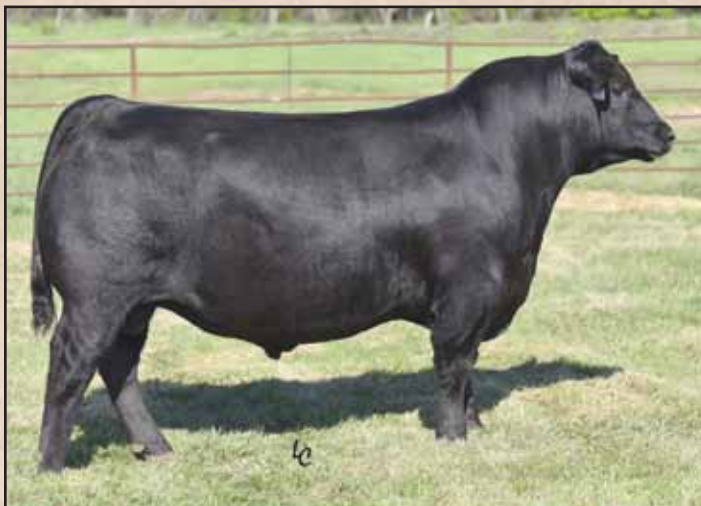
Ellingson Regiment 6362, the sire of Lots 39, 40 and 41.

This is a high-performance option from the first calfcrop of Ellingson Regiment 6362. Lot 40's Plateau dam is a super-functional female with a picture-perfect udder and feminine look. She is part of the Blackclass line that produced Plateau. His genomics ranked him as an elite individual for weaning weight, yearling weight, carcass weight, ribeye and scrotal. He earned an impressive 104 weaning ratio.