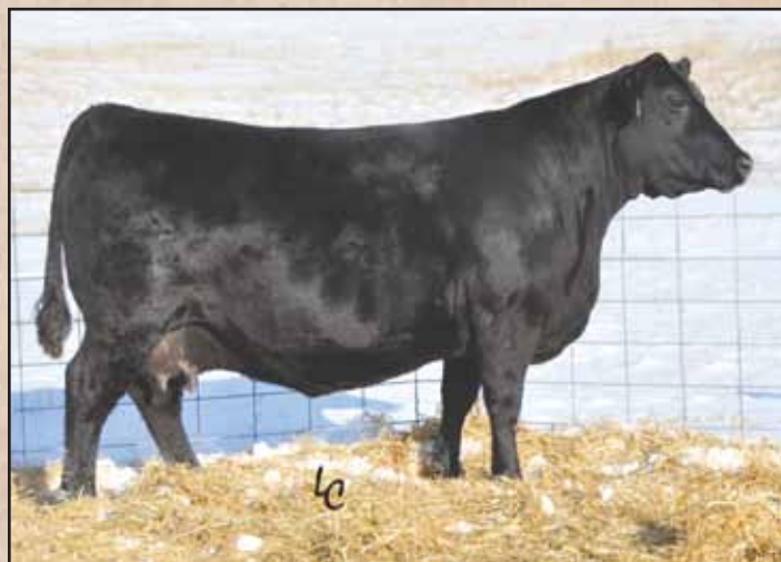
EA Pride 346, Lot 50's anchor dam.

This is one of our personal favorites and a bull that never fails to catch your eye as you walk through the bulls. He defines the meaning of balance – both in his phenotypic and genotypic measurements. He packs a tremendous amount of muscle and depth into a moderate frame score. He shows to have successfully bent the growth curve, starting out in light-birthweight fashion, but still performing well at weaning and yearling time. He has many generations stacked together of proven low-birthweight genetics used in large commercial projects. His maternal heritage is strong, as he comes from the famed Madame Pride cow family. The best attribute of this bull may be his gentleness. He ranked in the first percentile for docility. He deserves serious consideration from those who want to perpetuate common-sense, profit-ensuring traits.