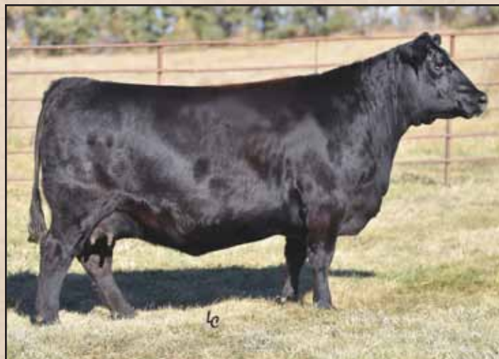
EA Emblynnette 3311, Lot 202's maternal granddam.