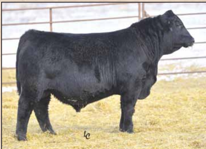
Lot 35, Ellingson Homegrown 8044.