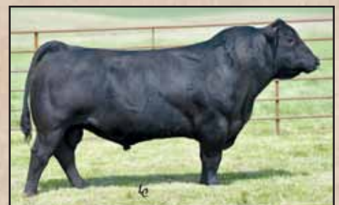
CTS Remedy 1T01, the sire of Lot 42 and the grandsire of Lots 1-41.