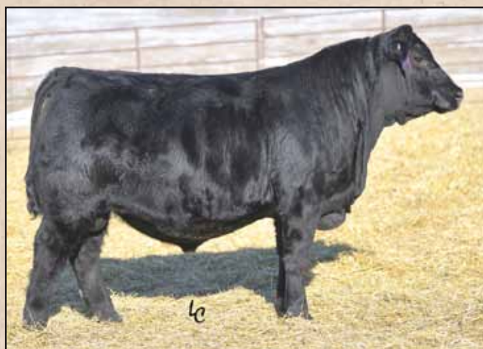
Lot 50, Ellingson Powerpoint 8178.

Utilize this Powerpoint son on virgin heifers to achieve more live calves each calving season without sacrificing pounds in the fall. His young dam is a model Angus dam, and his granddam is in her 10th year of production on the ranch. Maternal brothers to his dam are working for the Meyer Ranch, Maher Ranch and Hills Valley Ranch.