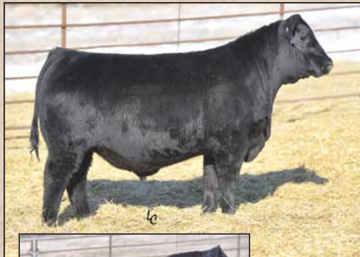
Above: Lot 124, Ellingson Roughrider 8086.