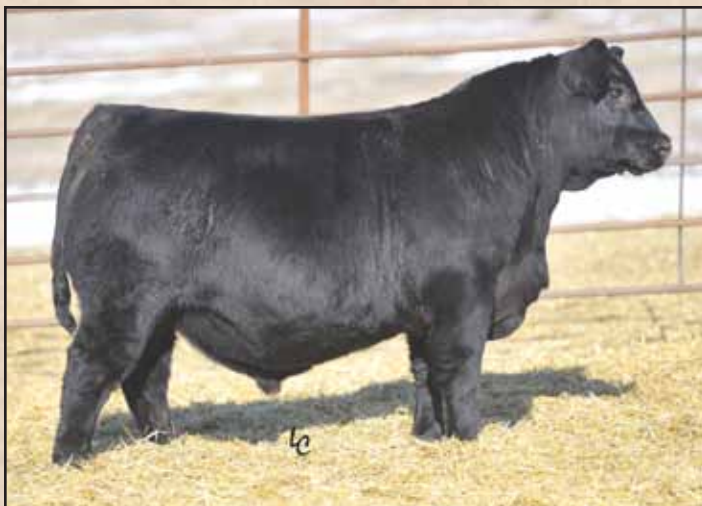
Lot 44, Ellingson Powerpoint 8155.