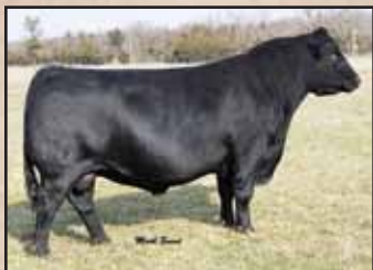
Ellingson Identity 9104, a maternal brother to Lot 52's dam.