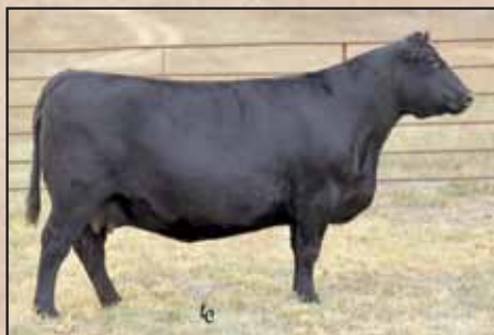
EA Hyalite Lady 7865, Lot 121's great-granddam.