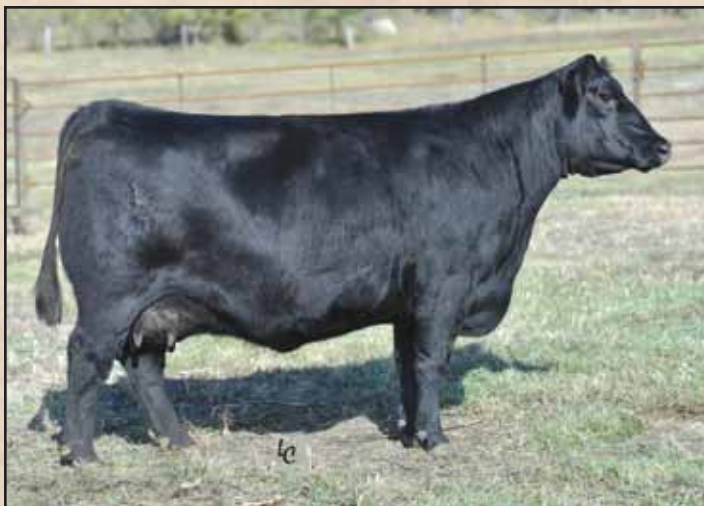
Lot 244, EA Blackclass 0083.