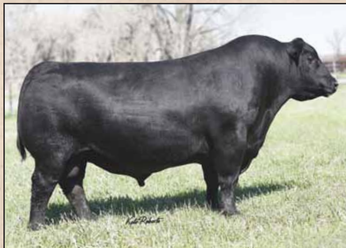
Ellingson Roughrider 4202, a maternal brother to Lot 3 and Lot 4's dam.

Here is another Homestead son that offers an astounding birth-to-yearling spread in a sound phenotypic package. He will add size, extension and, most importantly, payweight to your feeder calves. Feeders will be sure to appreciate the tremendous gainability in his calves. He combines the $130,000 Ellingson Homestead 6030 with a maternal sister to the $70,000 Ellingson Roughrider 4202. He came off his dam at 925 pounds and earned a weaning ratio of 109.