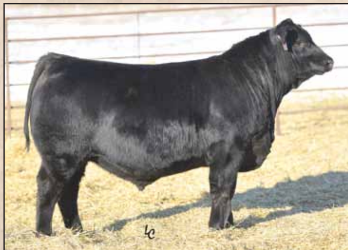
Lot 66, Ellingson Transcend 8171.