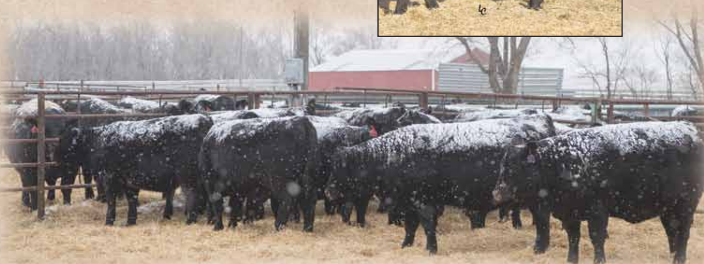
Left: Ellingson Consistent 6235, a maternal brother to Lot 5's dam.