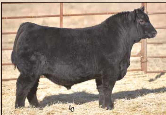
Ellingson Badlands 7146, Lot 172's maternal brother.