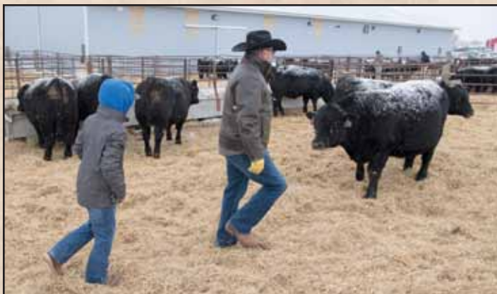
Visitors are always welcome to come and appraise the sale offering.