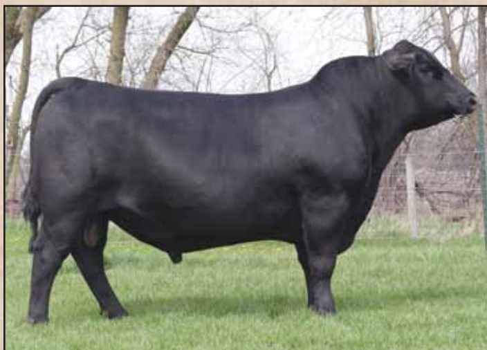
Ellingson Stagecoach 4015, produced from a maternal sister to Lot 133's dam.

Ellingson Roughrider 8403 is an extremely thick-topped and stout-constructed individual that has validated his growth potential from both his phenotype and genomics. He ranked in the seventh percentile for weaning weight and the fifth percentile for yearling weight. His Emblynette dam by Advance is a maternal sister to the dam of the $65,000 Ellingson Stagecoach 4015 that is owned with Alta Genetics and Diamond J Angus. She is a model Angus female with lots and lots of rib and a picture-perfect udder. A maternal brother to Lot 133 was the lead-off bull of his sire group at last year's production sale and was selected by Ottmar Ranch.