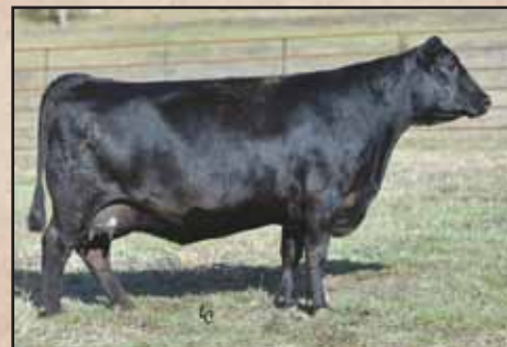
EA Emblynette 0068, Lot 241's great-granddam.