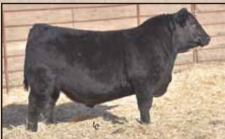
Ellingson Frontiersman 7132, a maternal brother to Lots 6-10.

Here is a maternal brother to the $30,000 Ellingson Frontiersman 7132. He should be safe for use on virgin heifers.