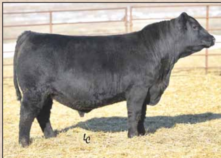
Lot 150, Ellingson Cowboy Up 8644.

Lot 150 is one of our favorites in his sire group. He is a well-designed herdbull prospect with extra shape and length. He ranks in the eighth percentile for weaning weight, the second percentile for yearling weight and the fifth percentile for carcass weight. He should be able to cover more cows this coming summer than his younger counterparts.