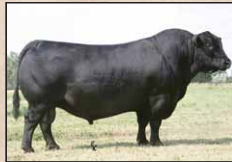
SAV Final Answer 0035's influence sells.