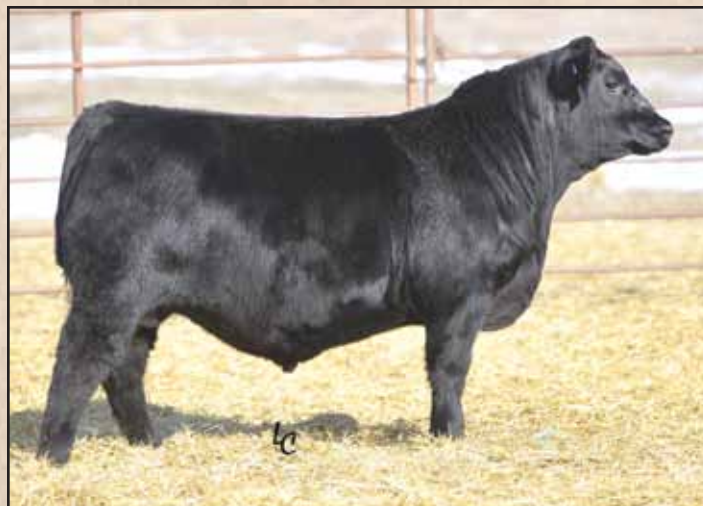
Lot 48, Ellingson Powerpoint 8147.

Here is one of the deepest sided and boldest ribbed bulls in the entire offering. His outstanding phenotypic physique and outcross lineage will offer lots of mating flexibility for his new owner. He has been verified through sound performance and genomic predictions as a calving-ease bull that will add pounds in an ideal-sized frame score. His impressive EPD profile bends the curve from birth to yearling and includes strong carcass figures and dollar indexes. This bull has gained a fan club from ranch visitors from around the globe. His 2-year-old Traction dam has a bright future ahead of her, just like her own dam that is 11 years old and still in production here. Lot 48 has all the credentials to be in serious consideration for use beyond the breeding pasture.