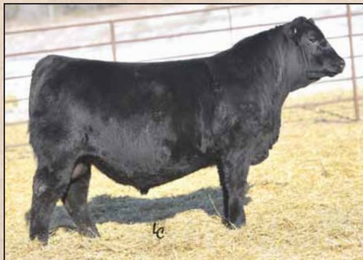
Lot 149, Ellingson Cowboy Up 8332.

You would have to travel many miles to find a bull that can even come close to matching the amount of true natural thickness and substance this bull possesses. He is one of the stoutest bulls we have ever raised, packing an unreal amount of performance into an ideal-sized package built like a freight car. He weighed 1,010 pounds at weaning to earn a 122 ratio and honors as the second heaviest of his contemporaries. His genomics have verified his performance merit, ranking him in the first percentile for weaning weight and the second percentile for yearling and carcass weight. He has the outcross genetics of Motivation, Scotsman and Providence on his bottom side to make him usable in many matings. An individual with his level of genetic superiority deserves strong consideration beyond his natural service duties. A maternal sister sold to Clarence Tays and Sons.