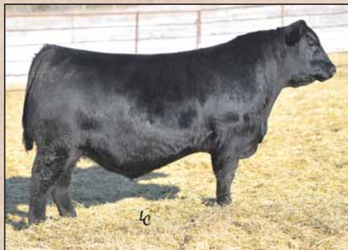
Lot 62, Ellingson Transcend 8007.

Ellingson Transcend 8007 is possibly the greatest Resource descendant that has been produced at Ellingson Angus. His unmistakable herdbull look makes him easy to find amongst his contemporaries. He has amassed a resume of achievements like none other. He is a no-hole individual with as balanced genotypic and phenotypic traits as you'll find anywhere. He earned the honor of being the heaviest weaning weight bull in the history of the ranch, coming off his dam at 1,150 pounds and earning a commanding 122 weaning ratio. His performance credentials are impressive, although his maternal heritage is what solidifies his authenticity as a potent breeding piece. His Earnan dam ranks as one of the most elite females on the ranch and portrays impeccable foot and udder quality with tremendous volume and angularity. She records a nursing ratio of 3/110 and a calving interval of 358 days and has settled to first-service A.I. every year. She will soon join the donor lineup, just like her dam and granddam did before her. His granddam, EA Emblynnette 434, is the $34,000-valued female that is the most influential cow in the Emblynnette tribe. Ellingson Transcend 8007 has the attributes to make a long-term impact far beyond the breeding pasture.