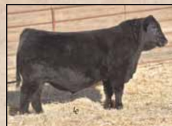
Ellingson Roughrider 7234, Lot 13's maternal brother.