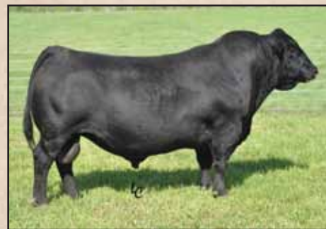
LT Bandwagon 3105's influence sells.