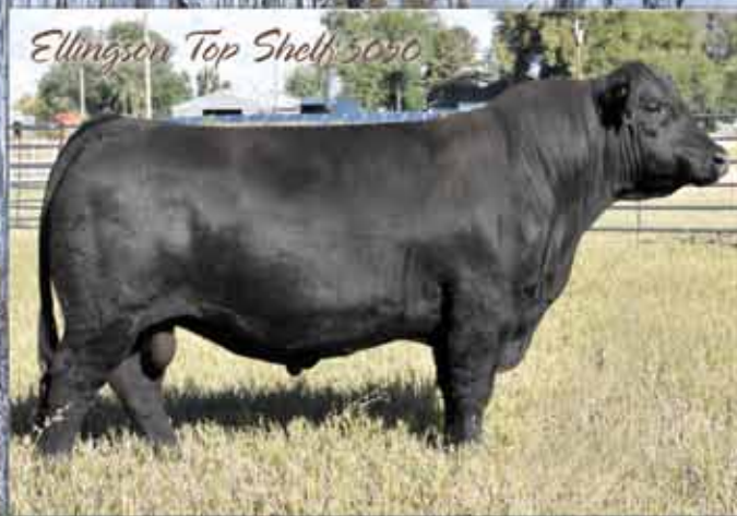
Ellingson Top Shelf 5050

Sire: Ellingson Plateau 1155 • MGS: SAV Final Answer 0035