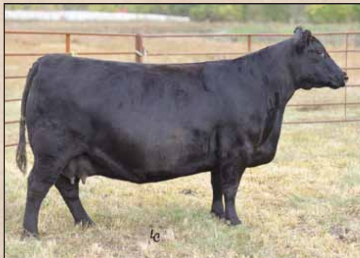
EA Blanche 8901, Lot 178's maternal granddam.