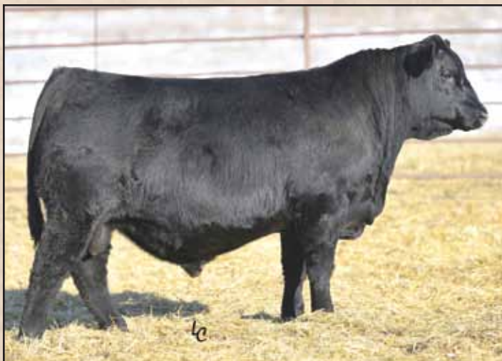
Lot 132, Ellingson Roughrider 8219.