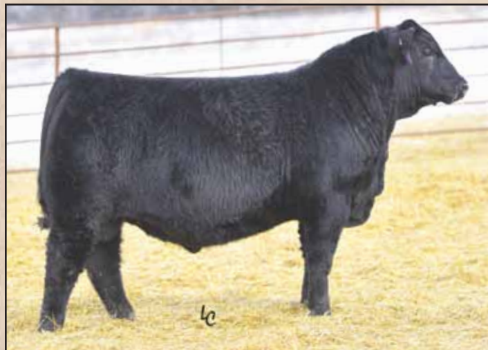
Lot 31, Ellingson Homegrown 8108.

Ellingson Homegrown 8108 proudly represents the first calf-crop of his popular Genex sire. He has authentic Angus breed character and the type and kind to be a real cowmaker. He is moderate in his frame score with tremendous spring of rib, softness and natural width throughout. He is smooth profiling, square hipped and sound footed. His outcross lineage should make him employable in many cowherds today. Combining Homegrown, Advance, Dominance, Traveler 004 and EXT in line, you should expect daughters that foundations can be built from. His actual data, confirmed by his genomic data, indicates that he should be a sleep-all-night heifer bull. He ranks in the fourth percentile for CED and the seventh for birthweight. His great-granddam is still in production at Ellingson Angus at 13 years of age. He and his dam were some of the most asked-about cattle on the North Dakota Angus Tour this fall. If your goal is to apply downward pressure on mature weight and height while still increasing weaning and yearling weights, Ellingson Homestead 8108 can help you achieve your production goals.