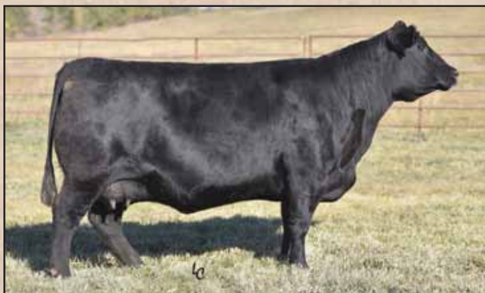
LT Beauty 1363, Lot 24's maternal granddam.

This is a full brother to Lot 22. There is no question they would be the perfect pair to turn out together to add consistency to your next calfcrop. They both should be suitable for use on heifers and add size and extension to a cowherd. Their dam is a maternal sister to the dam of the $41,000 Ellingson Homegrown 6035 featured at Genex and Mohnen Angus.