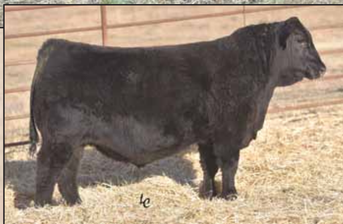
Ellingson Roughrider 7234, Lot 243's son.