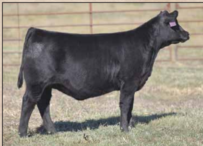
EA Emblynnette 6138, a maternal sister to Lot 169's dam.