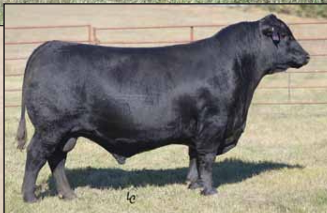
Ellingson Roundup 6206, Lot 242's son.