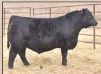
Ellingson Herdsman 6648, a maternal brother to Lot 52's dam.