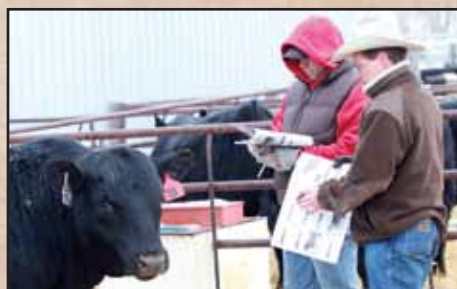
Dallas Miller owns a maternal brother to Lot 41.