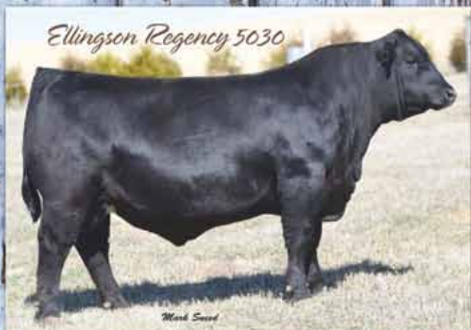
Ellingson Regency 5030

Sire: SAV Resource 1441 • MGS: Sitz Upward 307R Owned with: Diamond J Angus, ND, & Alta Genetics, Canada