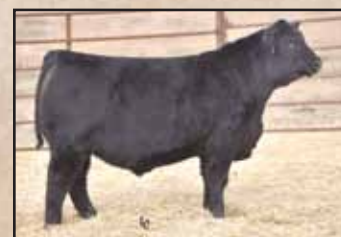
Ellingson Authorize 7057, produced from Lot 105's maternal sister.