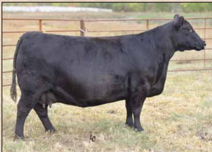
EA Blanche 8901, Lot 110's dam.