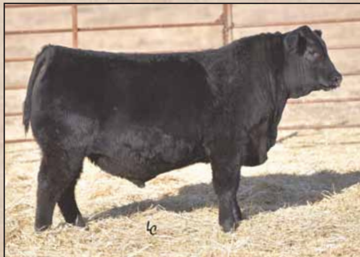
Ellingson Roughrider 7256, Lot 180's maternal brother.

Ellingson Fort Knox 8586 is a huge-centered individual with added size and outline. He will perpetuate more pounds and substance into his calves than most bulls will. He earned a weaning ratio of 102. His Advance dam is no stranger to the spotlight, as she is the dam of last year's Lot 1 bull that was selected by Arntzen Angus of Montana for $25,000. She is a maternal sister to the $30,000 Ellingson Secretary 2011, a member of the Select Sires roster.