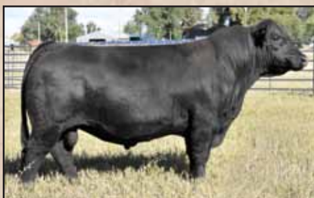
Ellingson Top Shelf 5050, Lot 42's maternal brother.

Here is the only son of Remedy in the sale. He is a maternal brother to our $50,000 Top Shelf bull featured at Semex and scanning a 19.5-inch ribeye at a year. His Pathfinder dam has a nursing ratio of 6/105 and a ribeye ratio of 8/105.