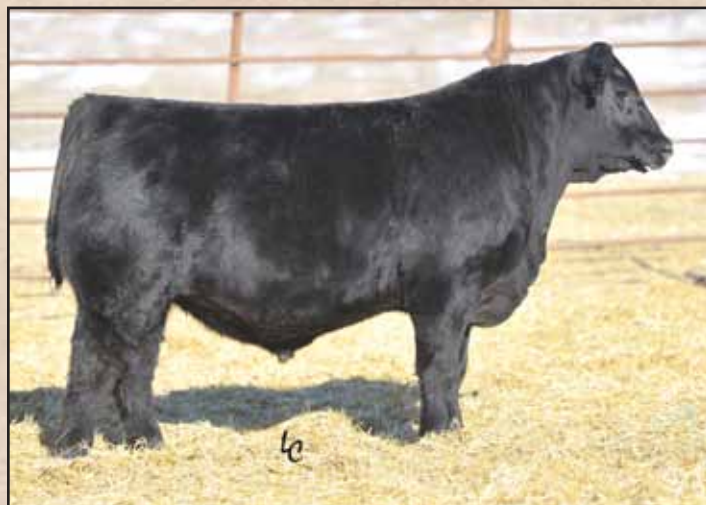
Lot 52, Ellingson Powerpoint 8140.

This is a tremendous performance bull that should be used on mature females to add payweight to your next calfcrop. His added size, length, muscle shape and substance will make an immediate one-generation impact. He came off his 2-year-old dam at 930 pounds to earn a 111 weaning ratio. His dam is a soggy, functional female that has a bright future ahead of her. She comes from a tribe of full sisters that are favorites on the ranch. She is a maternal sister to the $25,000 Ellingson Identity 9104 whose influence is felt in purebred and commercial herds across the country.