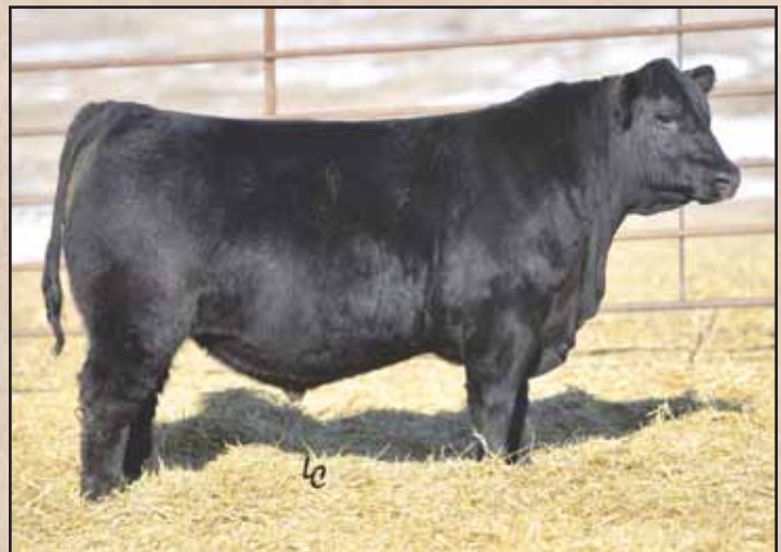
Lot 43, Ellingson Powerpoint 8179.

This impressive Powerpoint son has the physique of a real beef bull with curve-bending figures. He is long sided with added base width and rear quarter all put together in a correctly designed package. He is a full brother in blood to Lot 44. The two make a dominating pair. Their Capitalist dams were the only resulting females from their flush, and they haven't missed a step. A true testament to the genetic level they possess is the fact that they produced Lot 43 and Lot 44 on their very first try! The bulls' donor Blackbird granddam is a powerhouse Territory-6106 female that is often a favorite of ranch visitors. Lot 43 came off his 2-year-old dam at 910 pounds, earned a weaning ratio of 109 and hasn't looked back since. His genomic predictions identify him not only as a strong calving-ease and growth prospect, but one, even more importantly, that ranks near the top of the breed for fertility measures like heifer pregnancy and scrotal circumference. Ellingson Powerpoint 8179's strong economic-driving traits will allow him to be successful even beyond the breeding pasture.