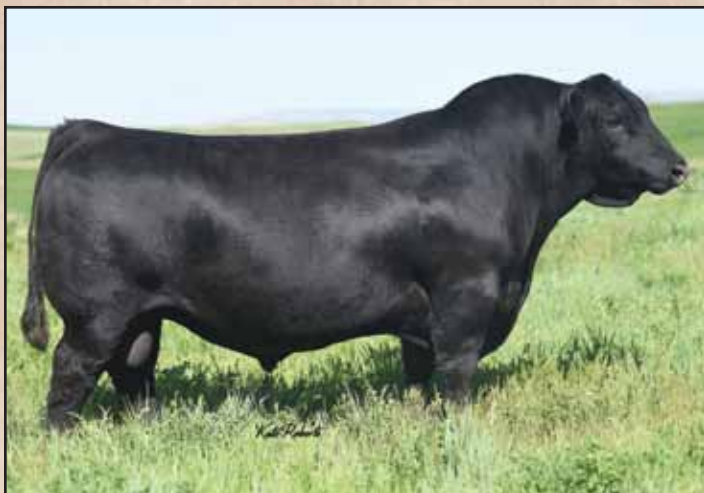
Ellingson Chaps 4095, Lot 229's sire.