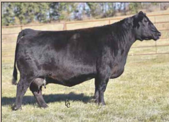
EA Blackclass 1027, Lot 127's dam.

Ellingson Roughrider 8076 and his outstanding donor dam were visitor favorites all throughout the summer, and rightfully so. He offers tremendous stoutness and rear quarter – traits that come standard in the Roughrider line – with added length of side and extension. He weaned off his dam at 960 pounds and earned a weaning ratio of 105. His Main Attraction dam has joined the donor pen, aspirating 76 oocytes in one flush alone last spring. Her impact will continue to be felt for years to come as many full and half siblings are due this spring. She has a birth ratio of 6/96, a nursing ratio of 6/104, a yearling ratio of 2/104 and a ribeye ratio of 2/104, as well as a 364-day calving interval. His maternal sister is the dam of the $20,000 top-selling heifer in our 2017 sale that sold to Ingram Angus, where they report her having one of the standouts in their 2018 calfcrop. Lot 127's maternal brother was a $15,000 feature in last year's sale and is owned in conjunction with Maher Ranch. We used him in the breeding pasture last summer.