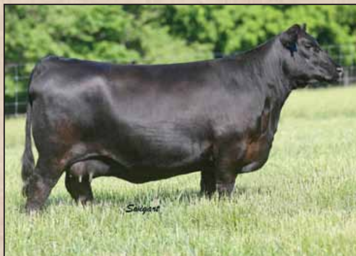
EA Enchantress 6005, Lot 236's maternal sister.

"America was not built on fear. It was built on courage, on imagination and an unbeatable determination to do the job at hand."