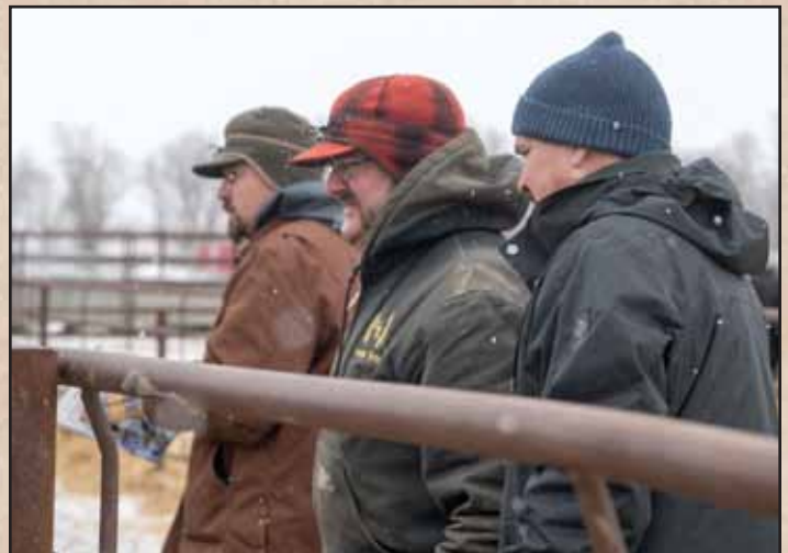
The Kraenzel brothers check out the yearling bull offering at last year's sale.