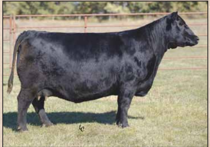
EA Blackclass 4024, Lot 92's dam.