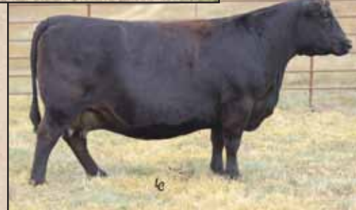
Right: EA Queen Dolly 8804, Lot 103's maternal granddam.