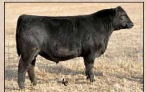
Ellingson Revolution 1047, a maternal brother to the dam of Lots 56 and 57.