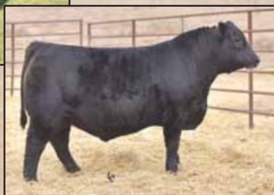
Left: SAV International 2020, the maternal grandsire of Lots 150-155.