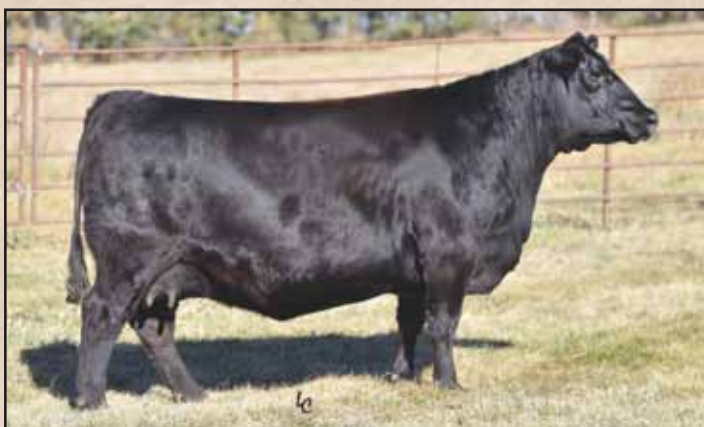
EA Emblynette 3311, Lot 19's dam.