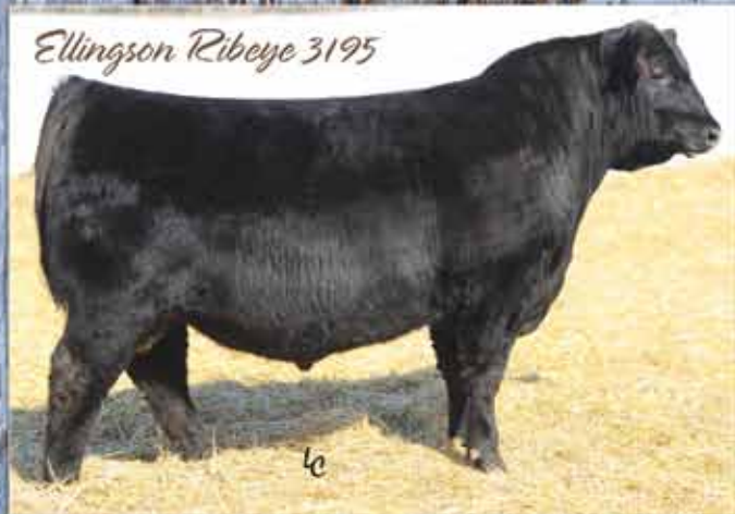
Ellingson Ribeye 3195

Owned with: Alta Genetics, Canada, & Diamond J Angus, ND