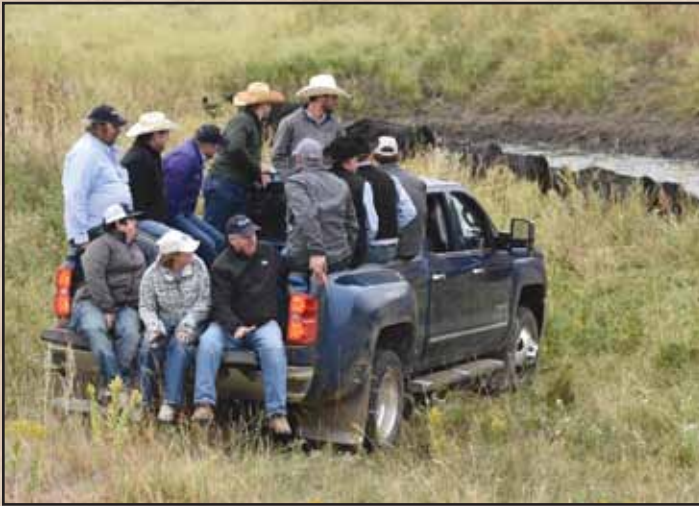
Ellingson Angus hosted the ST Genetics Sales Conference in September.

This is a double-bred calving-ease prospect that is a grandson of a long-time donor, Blackclass 124. He has an impressive curve-bending EPD spread that has been calibrated using accurate performance data and genomic predictions. His dam is a maternal sister to the $50,000 Ellingson Versatile that is owned with Talkingdon Angus and ST Genetics.