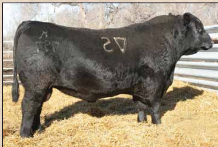
Koupal Juneau 797, the sire of Lots 237, 238 and 240.