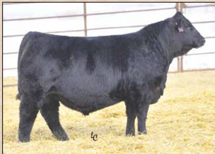
Lot 82, Ellingson Chaps 8374.

Ellingson Chaps 8374 is another one of our personal favorites amongst the bull offering. His lineage has been designed for function and eye appeal. His Chaps, Format, Traveler 004 and EXT 473 influence should give him a step ahead of his competitors in making great, long-lasting females. This bull gives up a little age to most of the bulls he is penned with, but you can't tell. He offers outstanding rib capacity and depth of flank, travels wide and square and has a commanding herdbull presence. He should be safe to use on heifers, but expect calves with tremendous calf vigor and growth.