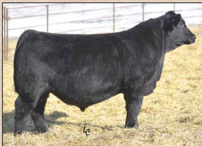
Lot 3, Ellingson Homestead 8090.