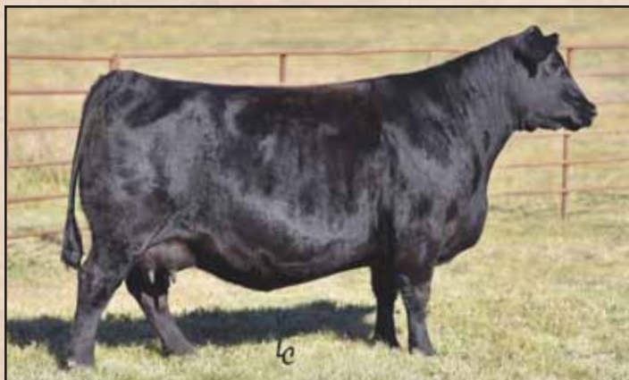
EA Blanche 1137, Lot 21's dam and Lot 22's and 23's maternal granddam.