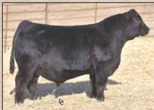
Ellingson Theodore 7159, a maternal brother to the dams of Lots 43 and 44.