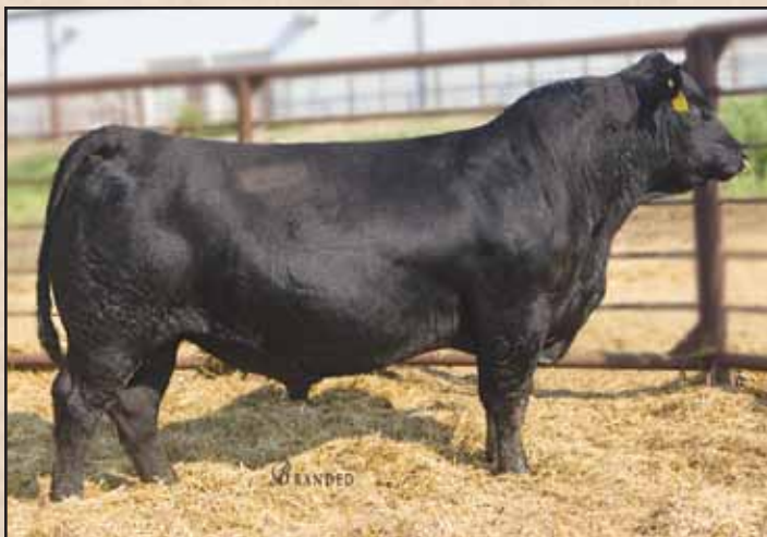
Ellingson Top Gun 5049, a maternal brother to Lot 226 and a full brother to Lot 227's dam.