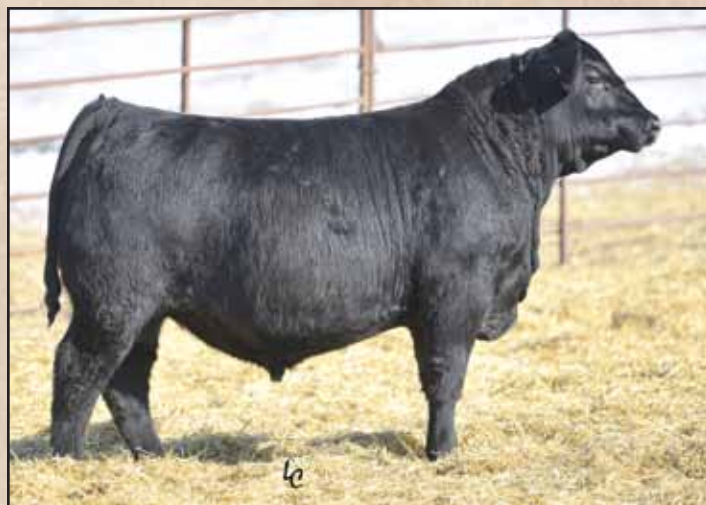
Lot 174, Ellingson Fort Knox 8169.