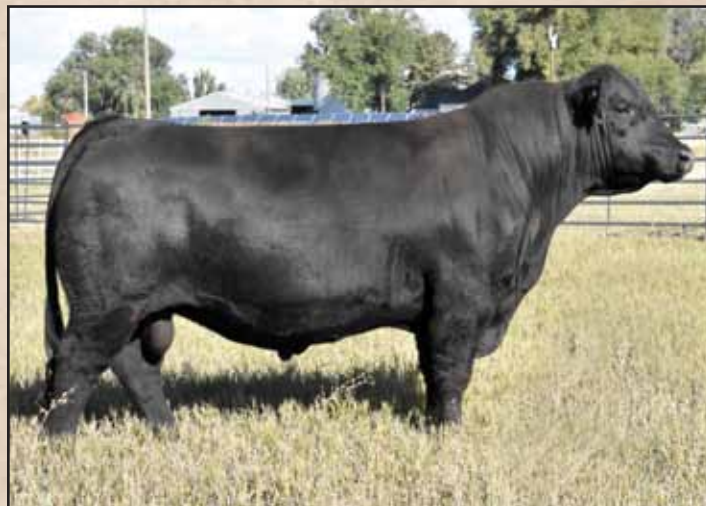
Ellingson Top Shelf 5050, Lot 11's maternal brother.