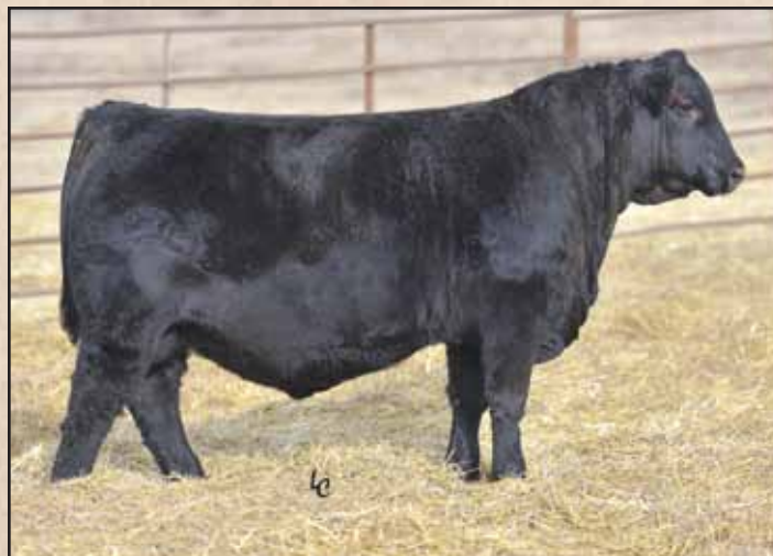
Ellingson Chaps 6081, Lot 36's maternal brother.