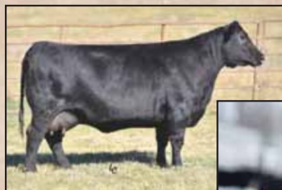
Left: EA Emblynette 3176, Lot 193's dam.

Check out the high-CED and low-birthweight figures this bull offers. His daughters should be front-pasture dams. A maternal brother was selected by the Quarter U Circle Ranch in 2018. Note: this bull should go to a home where he can get out and see lots of country. This is a fall-born bull.