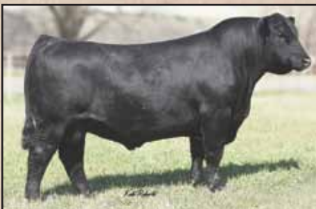
Ellingson Versatile, a maternal brother to the dam of Lots 56 and 57.