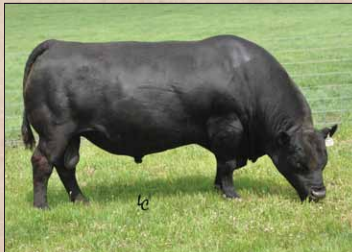
Tehama Blackcap Revolution, the maternal grandsire of Lots 116 and 117.

The Juneau-Revolution cross has been successful time and time again. Lot 116's full brother was a performance stand-out amongst last year's contemporaries and sold to Double Bar 7 Ranch. This bull came off his dam at 965 pounds and ratioed 105. His Pathfinder dam has a nursing ratio of 5/107, a yearling ratio of 3/105 and a ribeye ratio of 1/103. She hails from the Hyalite Lady cow family, which has the most representatives of any cow family on our embryo transplant team. If you are serious about weaning heavy feeder calves, this bull should fit the bill.