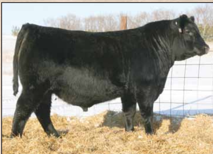
Ellingson Branding Iron 0123, a maternal brother to Lot 142's dam.

This is a maternal brother to Ellingson Identity 9104, the high-selling bull in our 2010 sale. Identity has went on to leave a lasting impact on many progressive commercial and registered outfits. We have many of Lot 140's sisters retained in our cowherd, including a full sister that is a standout amongst the bred heifers.