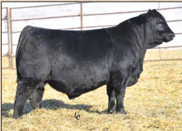
Lot 64, Ellingson Transcend 8234.