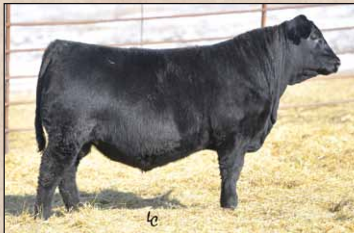
Lot 165, Ellingson Plateau 8230.