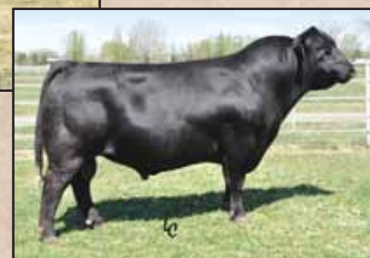
Right: Benfield Substance 8506, the maternal grandsire of Lots 99-103.