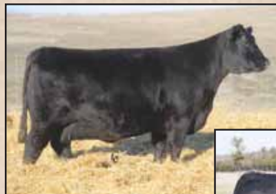
Right: Ellingson Identity 9104, the maternal brother to the dam of Lots 150-156.

This is a wide-based performance prospect from an impressive flush. He offers as much rib shape and middle as any of his brothers. He will mature into an easy-keeping, modest-framed bull. His EXT 6106 granddam is one of the most influential females in the history of our ranch.