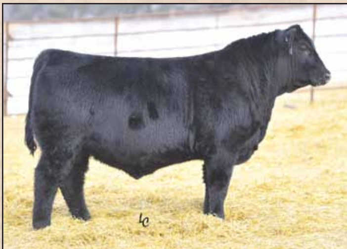
Lot 32, Ellingson Homegrown 8053.