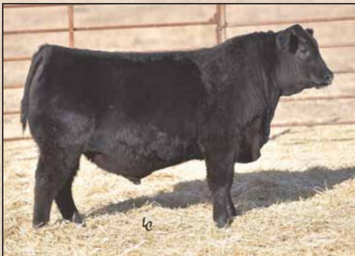
Ellingson Roughrider 7256, a maternal brother to Lot 87's dam.