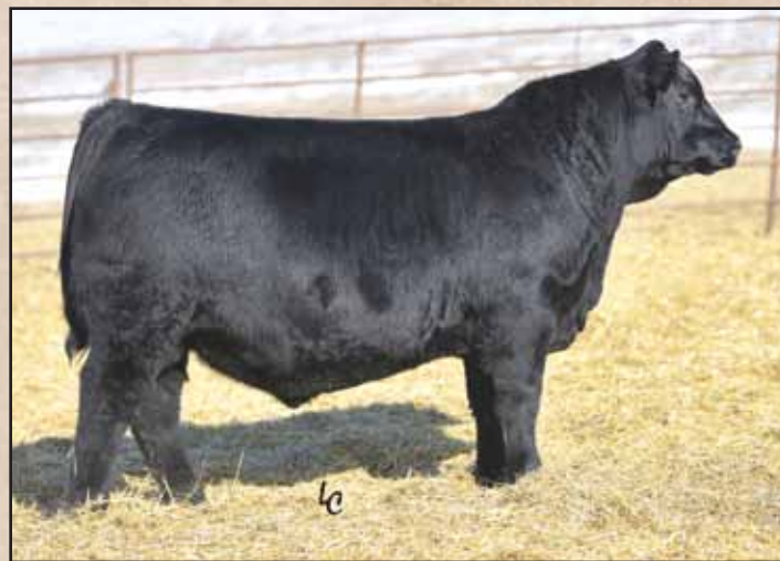
Lot 1, Ellingson Homestead 8202.

There is no better way to lead off an offering of bulls that represent our finest work yet than with a bull of this caliber. Ellingson Homestead 8202 may be the most balanced individual in the entire sale. He features common-sense traits that are critical to the bottomline of real-world cattle producers. Lot 1 was an early favorite alongside his donor dam by Advance, and he continues to be impressive. He replicates the same unmistakable herdbull presence that his sire did as he captured the attention of Angus breeders worldwide. Lot 1 weaned off his dam at 990 pounds and earned a weaning ratio of 112. His dam is one of the best young females in our cowherd. She is the first of what will be many Advance daughters to find their way onto our donor roster. This distinctive female solidifies our trust that Lot 1 will be a valuable breeding machine wherever he goes. His maternal brother by Remedy was a standout in his calfcrop and was selected by the Harris Ranch, where he is being used with success in the family's large commercial heifer breeding program. Lot 1's maternal sister is one of our favorites in the bred heifer pen this year.