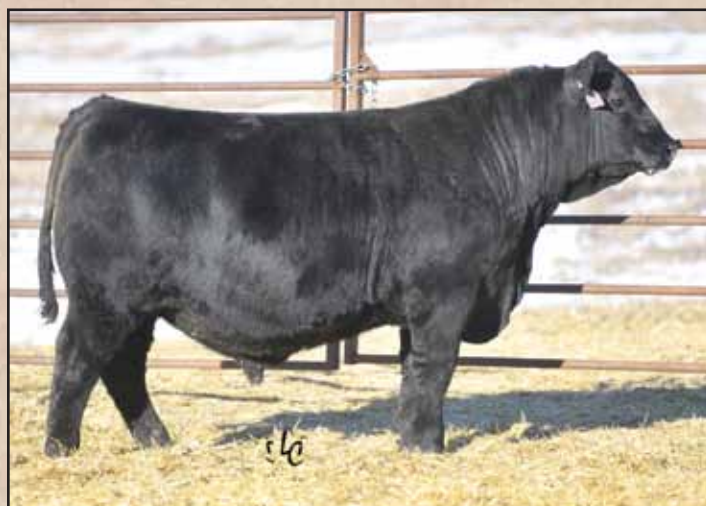
Lot 151, Ellingson Cowboy Up 8601.

Ellingson Cowboy Up 8601 is a soggy-made, embryo-transfer Cowboy Up son that was mated with our commercial customers who sell their calves by the pound in mind. Lot 151's International dam is a promising young female with for-the-long-haul features. She is a maternal sister to the $25,000 Ellingson Identity 9104, an influential sire in our program.