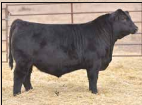
Ellingson Traction 6380, Lot 244's son.

EA Emblynnette 1195 is one of the special females on the ranch and one of the easiest cows to mate, because she works on about any bull. She is a soft-middled, broody cow with added substance and one of the freest traveling animals you'll ever appraise. She is a distinguished second-generation Pathfinder dam. She has a production nursing ratio of 6/106, a yearling ratio of 4/109 and a ribeye ratio of 2/105. Her sons have been past sale headliners and were purchased by Harris Ranch and Double Bar 7 Ranch. Her daughter by Commanche is one of our best young females and has a nursing ratio of 2/105. Her Juneau 797 son is featured in this offering as Lot 104 and has been popular with some very astute cattle producers. We excitedly await our 1195 embryo transplant progeny due this spring. She sells safe in calf to the $130,000 Ellingson Homestead 6030 for a late-February calf. We reserve the right to two future IVF aspirations at the new owner's convenience and our expense.