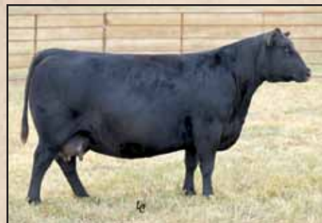
EA Blanche 7844, Lot 223's great-granddam.