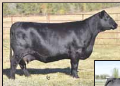
Left: EA Madame Pride 3295, Lot 102's maternal sister.