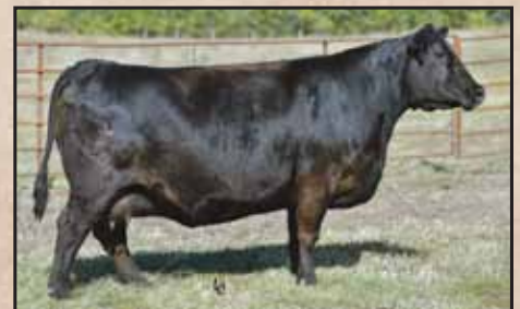
EA Primrose 9155, the dam of Lots 6-10.