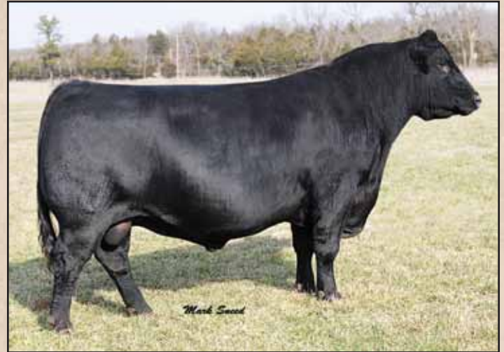
Ellingson Identity 9104, a maternal brother to Lots 140 and 141 and the maternal grandsire of Lots 145, 146 and 147.

Ranchers who run in tough range conditions should make sure to study this bull thoroughly. Ellingson Roughrider 8285's mother by Identity is one of the easiest maintaining females on the ranch. Two of his maternal sisters are working here in the herd as well.