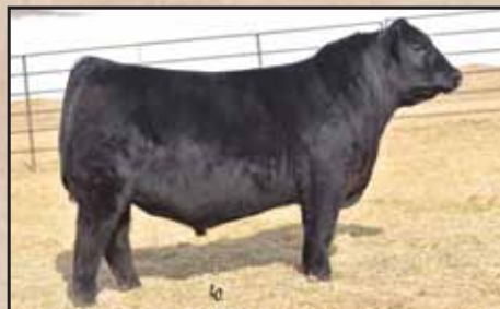
Ellingson Drover 6034, a maternal brother to Lots 6-10.