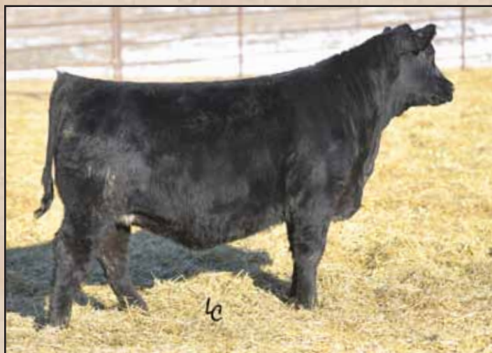
Lot 235, EA Enchantress 8223.

EA Enchantress 8021 is the only daughter of the $350,000 HA Cowboy Up 5405 that is in the sale. She is being offered as a special sale attraction. This female is long sided, feminine fronted and soundly constructed. She has Cowboy Up, Identity, Bandwagon and Tradition in her pedigree. Her maternal sister is a model Angus cow that was selected by Boyd Beef Cattle in Kentucky and is pictured as a 2-year-old.