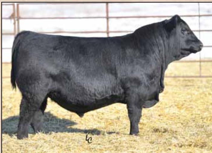
Lot 65, Ellingson Transcend 8125.