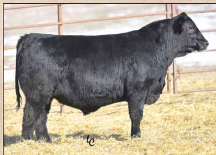
Lot 101, Ellingson 797 Juneau 8135.