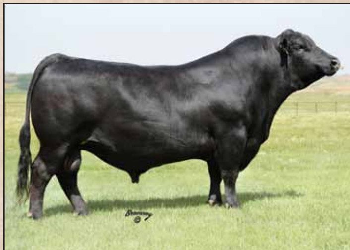
Ellingson Starman 4157, Lot 168's maternal brother.