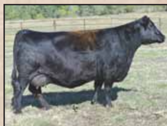
EA Rosetta 1127, Lot 13's dam.