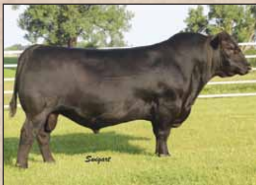
Werner EA Motivation 2031, Lot 78's maternal grandsire.