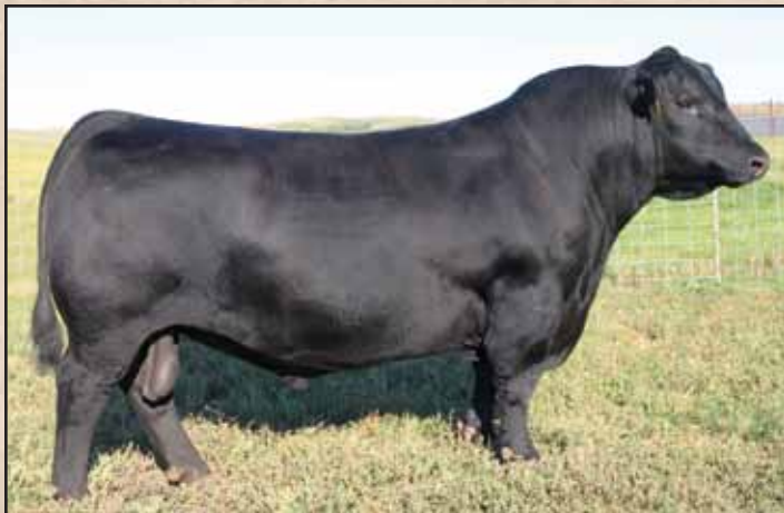
SAV Recharge 3436, the sire of Lots 75 and 76.