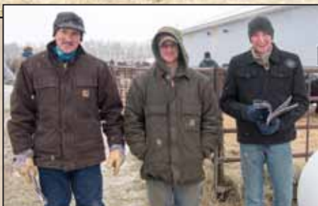
Top: Ellingson Remedy 6446, Lot 190's maternal brother.