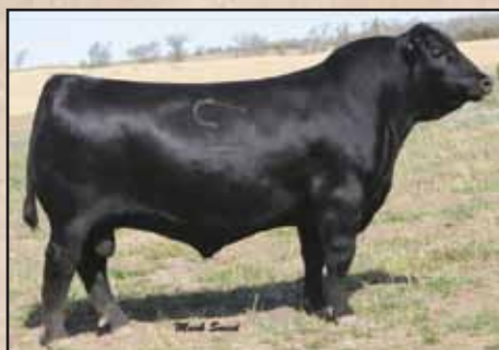
Connealy Earnan 076E's influence sells.