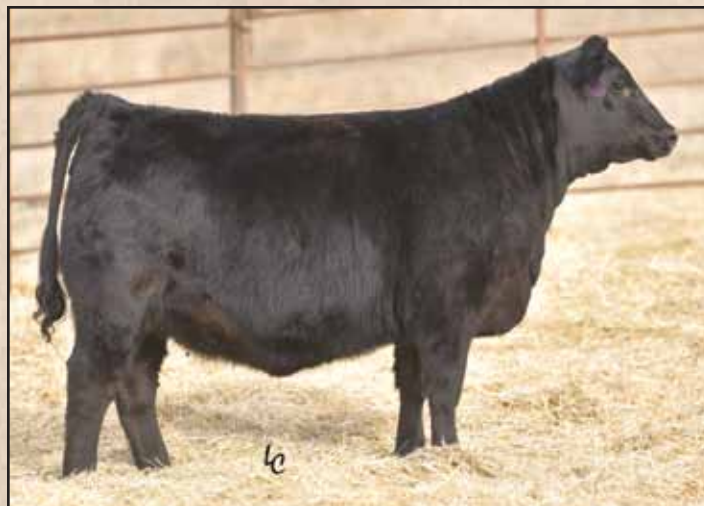
EA Emblynette 7599, a maternal sister to Lot 230's dam.