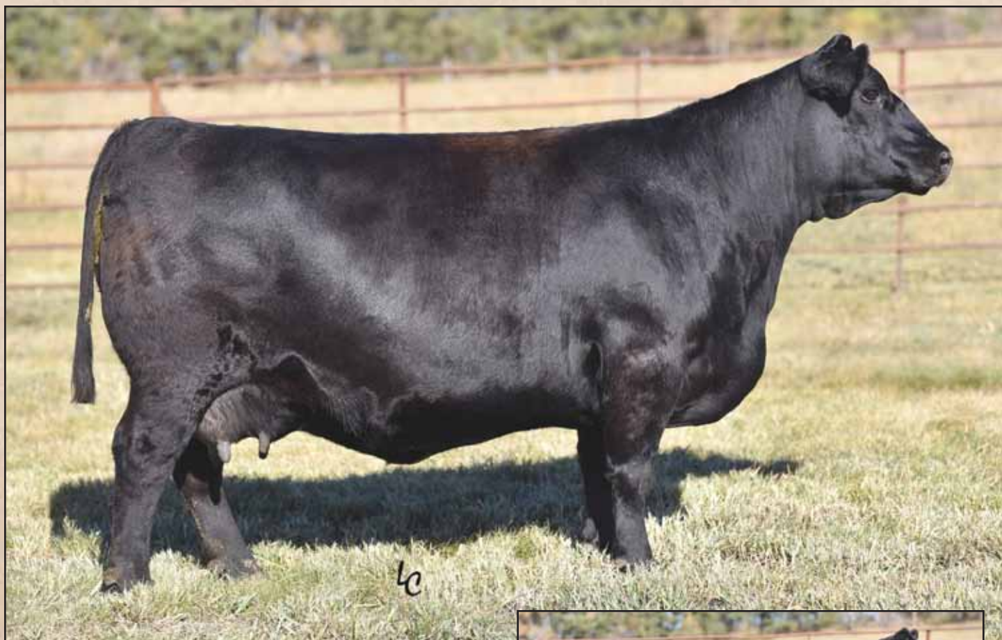
Lot 246, EA Emblynnette 2091.