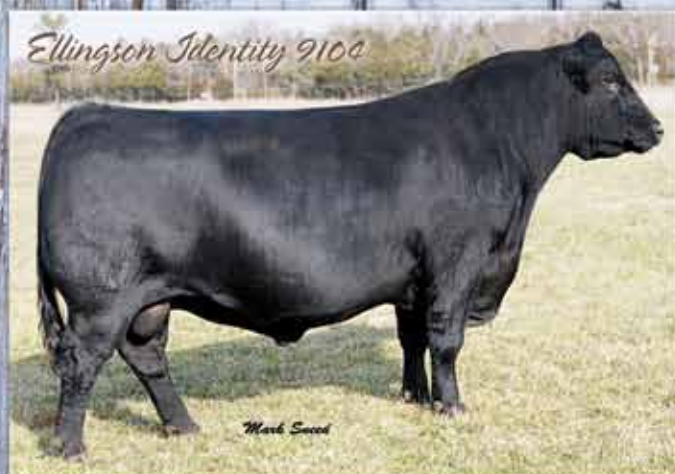
Ellingson Identity 9104

Sire: TC Aberdeen 759 • MGS: Wulffs EXT 6106 Owned with: Maher Ranch, SD, & Carstens Farms Ltd., IA