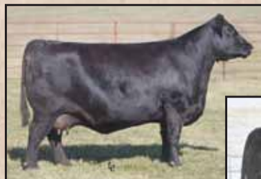
EA Madame Pride 3072, Lot 85's dam.

Here is a stout-rumped, big-stifled bull with outstanding muscle expression. His dam is a powerhouse with tremendous depth of flank and extension. She hails from the Madame Pride cow family and traces to EA Pride 346, the matriarch of the family and the dam of Ellingson Boardwalk 3032. This bull is bred to perpetuate real-world qualities.