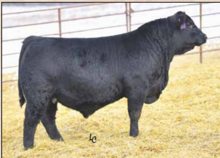
Lot 79, Ellingson Chaps 8035.