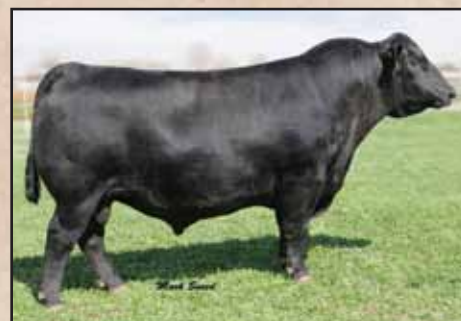
SAV Efficiency 7056's influence sells.