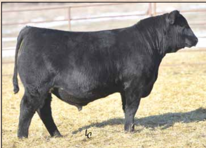
Lot 51, Ellingson Powerpoint 8184.