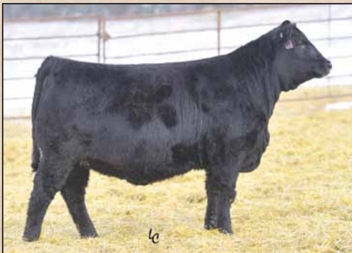
Lot 230, EA Emblynette 8806.