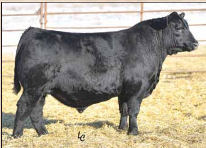
Lot 126, Ellingson Roughrider 8102.