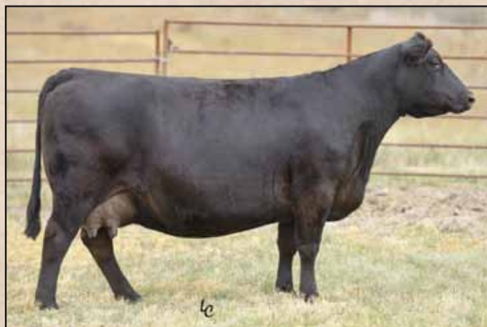
EA Queen Dolly 9205, Lot 107's maternal sister.