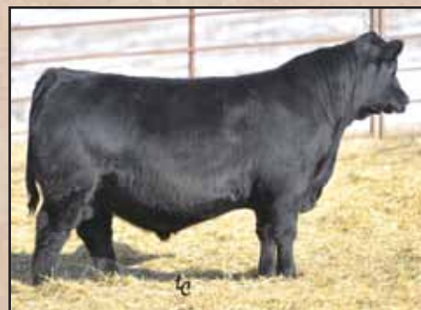
Ellingson 797 Juneau 8245, Lot 245's son that sells as Lot 104.