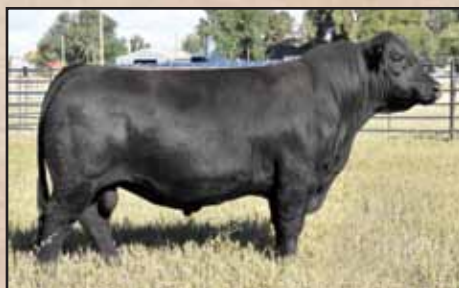
Ellingson Top Shelf 5050, Lot 109's maternal brother.