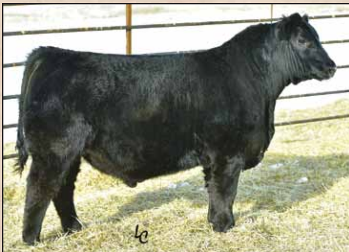
Ellingson Reservoir 4099, Lot 128's maternal brother.