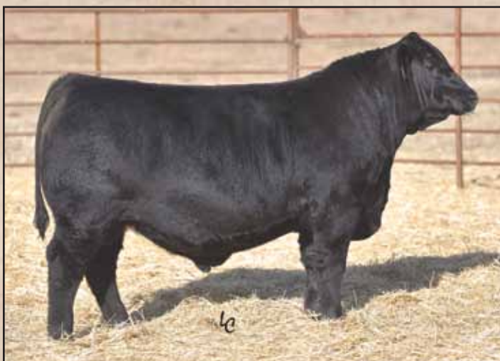
Ellingson Chaps 7152, Lot 216's maternal brother.