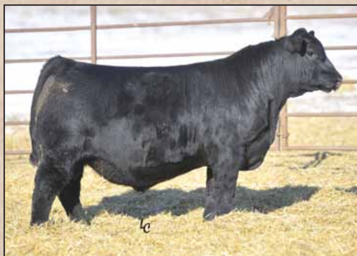
Lot 158, Ellingson Cowboy Up 8002.

Here is a wide-based son of a $350,000 powerhouse, HA Cowboy Up 5405. He is a replica of his popular sire with a distinguished herd bull look. He will mature into an ideal-sized individual with traditional Angus breed character. He carries a tremendous amount of natural shape with extra volume and an impeccable set of feet and legs. His tremendous Net Income dam reigns from the Primrose cow family that has garnered international attention for its phenotype and production capabilities. His dam has a nursing ratio of 6/102 and a yearling ratio of 3/102 and boasts a calving interval of 360 days on six calves.