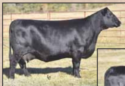
Left: EA Madame Pride 3295, Lot 204's dam.