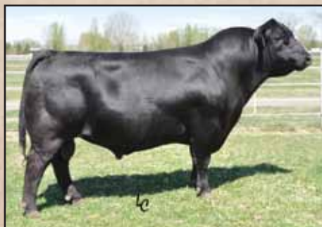
Benfield Substance 8506's influence sells.