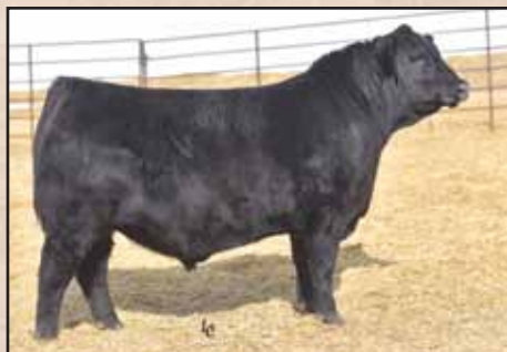
Ellingson Homegrown 6035, produced from a maternal sister to Lot 222's dam.