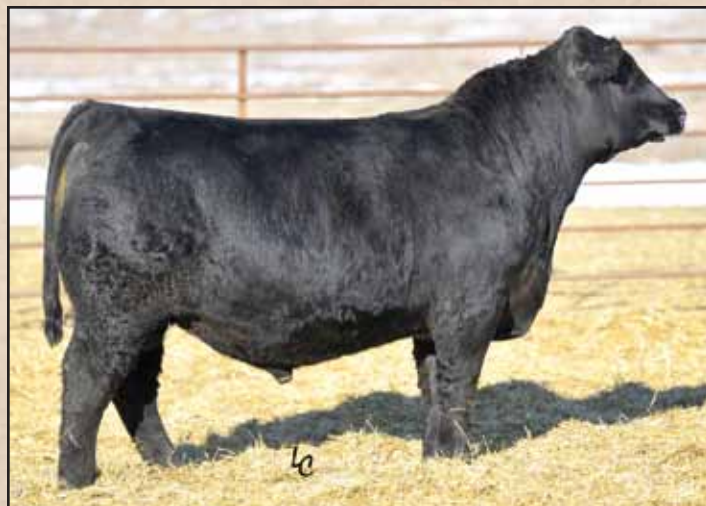
Lot 191, Ellingson Advance 7912.

This bull will move the needle in the traits vital to your success, including making females that raise the genetic merit of your herd. He earned a weaning ratio of 110 and a yearling ratio of 106. He is bold sprung, square made and fluently constructed. His dam is a full sister to Ellingson Finale 0054, a $15,000 purchase of Wooden Shoe Farms and one of the best Final Answer sons we have raised. Prairie Diamond Ranch owns a maternal brother. This is a fall-born bull.