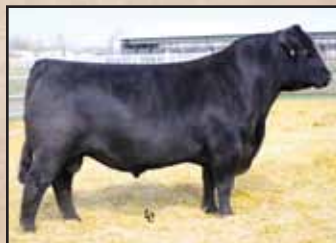
Ellingson Plateau 1155, Lot 53's maternal grandsire.