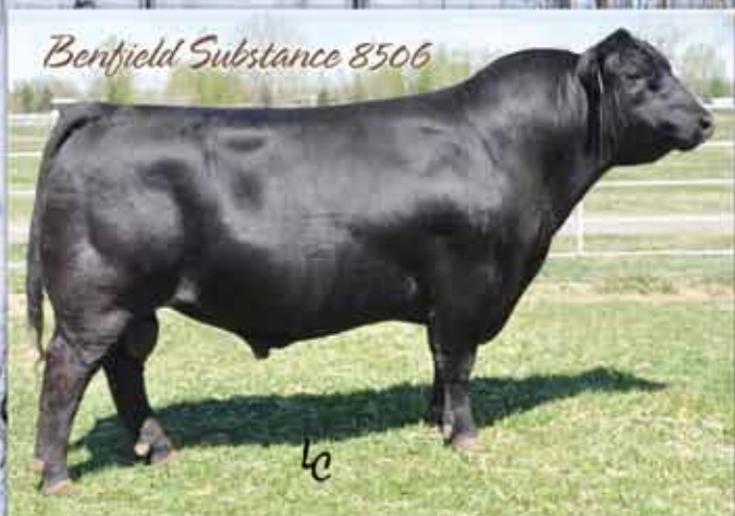
Benfield Substance 8506