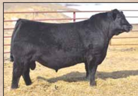
Ellingson Homestead 6030, a maternal brother to Lot 203's dam.