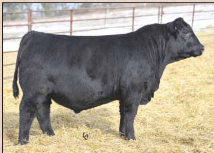
Lot 16, Ellingson Homestead 8071.

Here is a thick-topped and big-hipped bull that has a rugged herdbull appearance. He has the structural build and foot design to improve the function in any female he is mated to. He weaned off his dam at 970 pounds and earned a 106 weaning ratio. The most impressive thing about this bull is the maternal heritage he is rooted in. The females that are in his pedigree are time-tested for production, structural soundness and fleshing ease. His dam is now 9 years old and remains in tremendous condition with a picture-perfect udder. A maternal brother was selected by Castle Butte Angus in last year's sale, while three of his maternal sisters are leaving their mark on our operation. One of them had a high-selling heifer in our 2018 production sale.