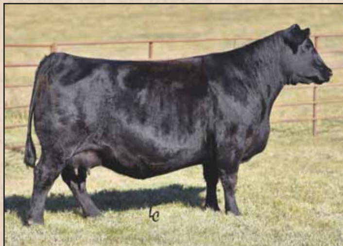
EA Blanche 1137, Lot 184's maternal granddam and a maternal sister to Lot 183's granddam.