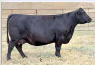
EA Madame Pride 0040, a full sister to Lot 97's granddam.

Cattle ranchers who run in the toughest of conditions, take a close look. This bull will sire moderate-framed, forage-efficient females that can go out and get the job done on their own. His Madame Pride dam is one of the broodiest cows on the operation.