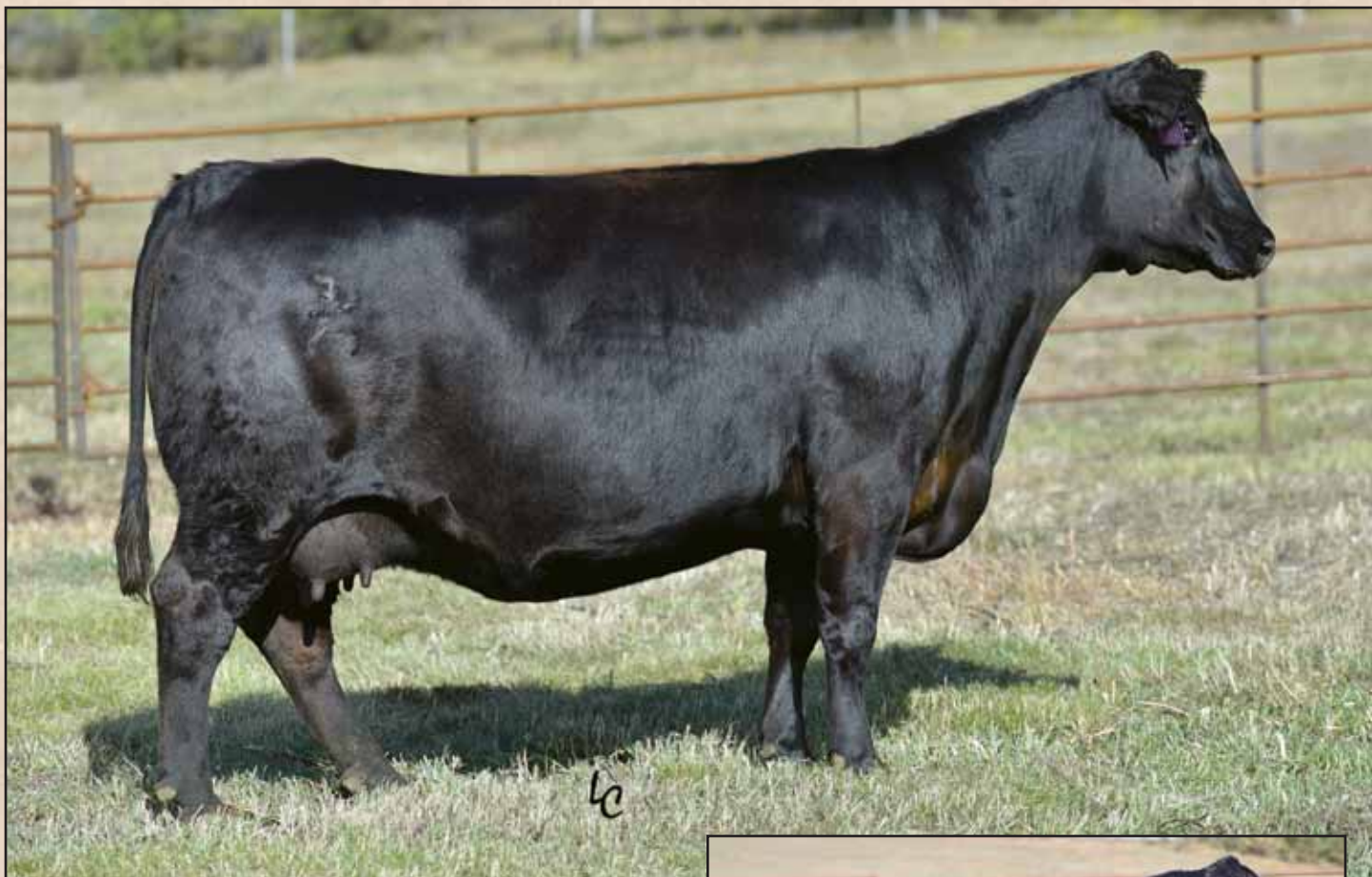
Lot 242, EA Lucy 2218.