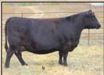
EA Queen Dolly 8804, Lot 53's maternal granddam and a maternal sister to Lot 54's dam.