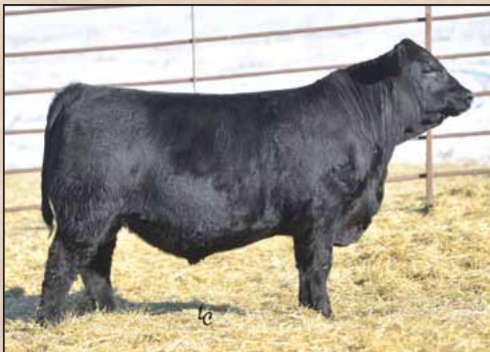
Lot 71, Ellingson Transcend 8068.