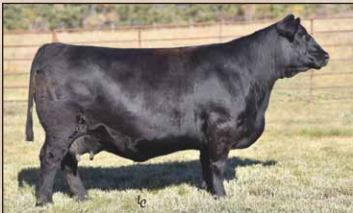
EA Emblynette 2091, a maternal sister to Lot 19's dam.