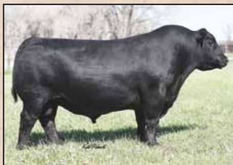
Ellingson Roughrider 4202's influence sells.