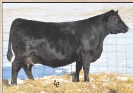
EA Pride 346, the paternal granddam of Lots 203-210.