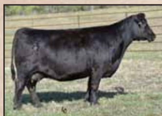
EA Emblynnette 1173, Lot 105's dam.