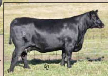
Right: EA Blackclass 6821, Lot 208's maternal granddam.