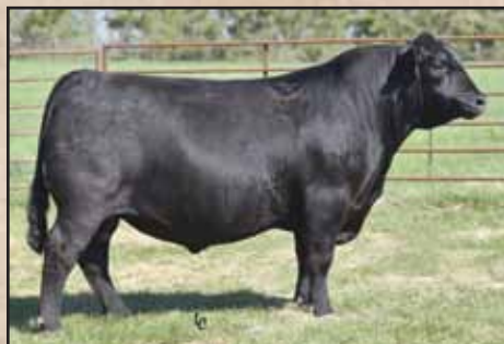
Ellingson Accelerate 5264, a maternal brother to Lot 241's dam.

This is a low-birthweight, high-CED heifer that has the softness and soundness to leave a lasting impact. Her dam is a daughter of Werner EA Motivation 2031. The Motivation daughters are some of the nicest young females at the ranch. Her dam is a maternal sister to Ellingson Accelerate 5264, a calving-ease and maternal sire featured at ST Genetics.