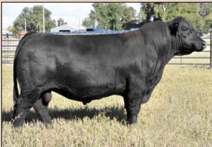
Ellingson Top Shelf 5050, Lot 172's sire.