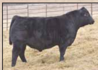
Ellingson Cherokee 6107, Lot 104's maternal brother.

Cattlemen who appreciate proven maternal lines will appreciate this guy. He puts together the Juneau, Territory and Bushwacker lines and is the kind that somebody can use to build a cowherd. His dam has an amazing production record and a brood-cow look to match. Maternal brothers are working for Ottmar Ranch and Katus X7 Ranch. Another was the $14,000 selection of Lazy JB Angus in 2017. Two maternal sisters have been retained in the cowherd, including EA Emblynnette 5169, best known as the dam of the $77,500 Ellingson Authorize 7057 featured at ABS Global.