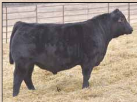
Ellingson Cherokee 6107, Lot 245's son.