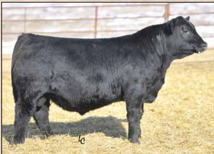
Lot 114, Ellingson 797 Juneau 8103.