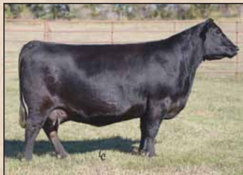
Left: EA Queen Dolly 2133, Lot 103's dam.