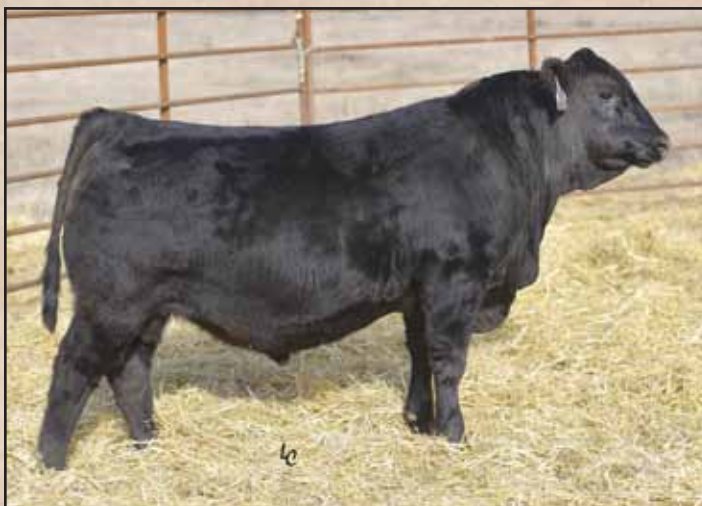
Ellingson Resource 5052, Lot 90's maternal brother.