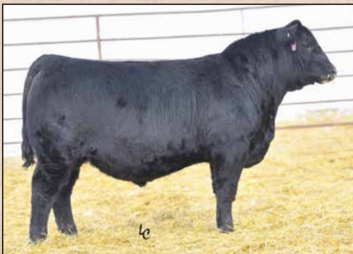
Lot 89, Ellingson Chaps 8393.