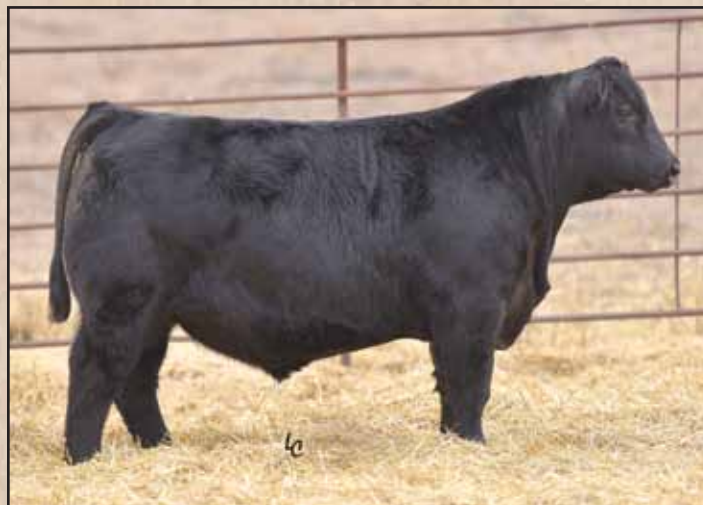
Ellingson Boardwalk 6065, Lot 66's maternal brother.