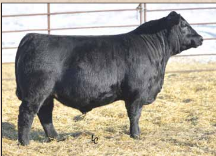
Lot 127, Ellingson Roughrider 8076.