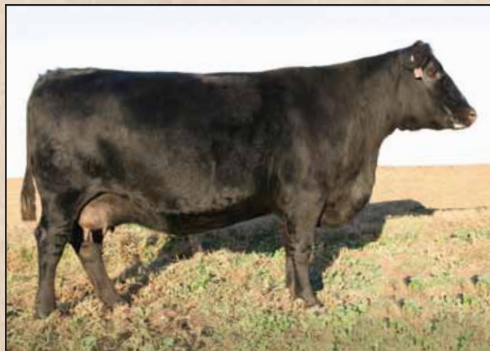
EA Emblynette 434, the granddam of Lots 122 and 123.