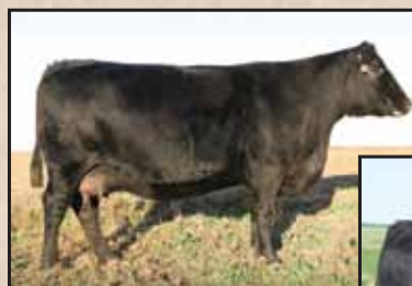
EA Emblynette 434, Lot 2's great-granddam.