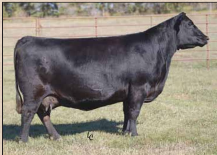
EA Queen Dolly 2133, Lot 211's maternal granddam.

This bull will be safe to use on heifers. He is really deep sided and sound and has performed well. His dam is one of our favorites in our fall program with her powerhouse phenotype and perfect udder suspension and teat size. His Substance granddam is a distinguished Pathfinder dam that boasts a nursing ratio of 5/107. This is a fall-born bull.