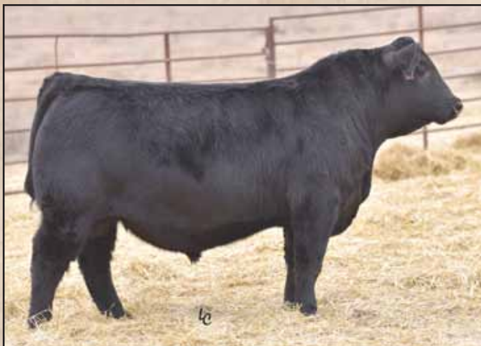
Ellingson Boardwalk 6044, Lot 65's maternal brother.