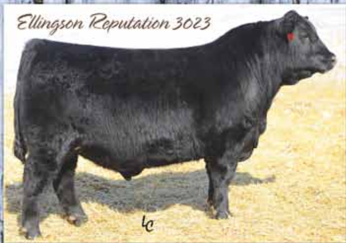
Ellingson Reputation 3023

Owned with: Brenner Angus, ND; Hatfield Angus, KY; & Select Sires Beef, OH