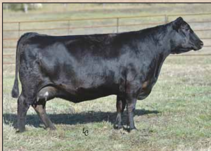
EA Emblynette 0068, a full sister to Lot 119's granddam.