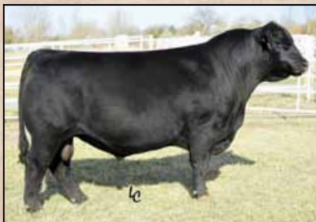
Ellingson Guaranteed 0023's influence sells.