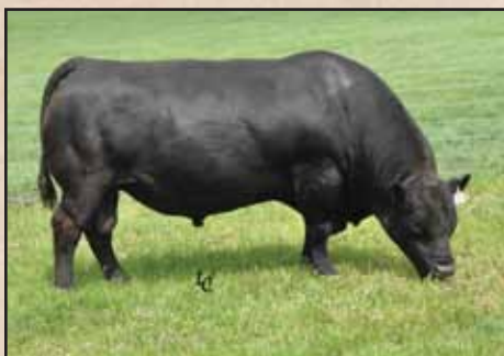
Tehama Blackcap Revolution's influence sells.