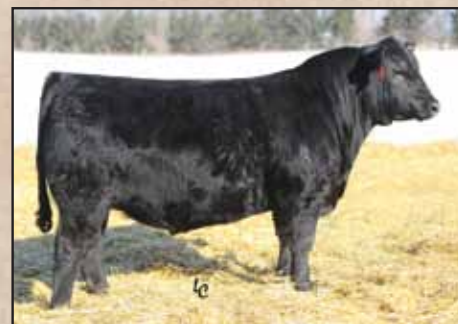
EA Emblynette 4274, Lot 174's maternal sister. Ellingson Identity 3161, Lot 174's maternal brother.