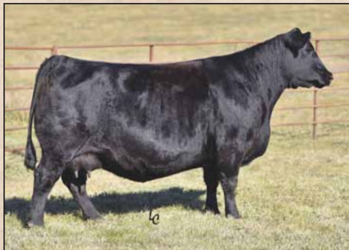
EA Blanche 1137, Lot 138's dam and a maternal sister to the dam of Lot 137.

If you are wanting to improve rib shape and fleshing ease, this Roughrider-Advance bull may be the answer. He weaned off his dam at 834 pounds to earn a weaning ratio of 101. He offers a more modest birthweight than most from his sire group, but he still boasts outstanding growth figures. His genomics have also identified him as an outstanding heifer pregnancy bull, which means he should enhance herd fertility. A maternal sister is working in the Spring Grove Ranch program.