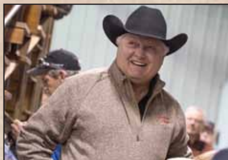
Jim Swenson owns a maternal brother to Lot 203.