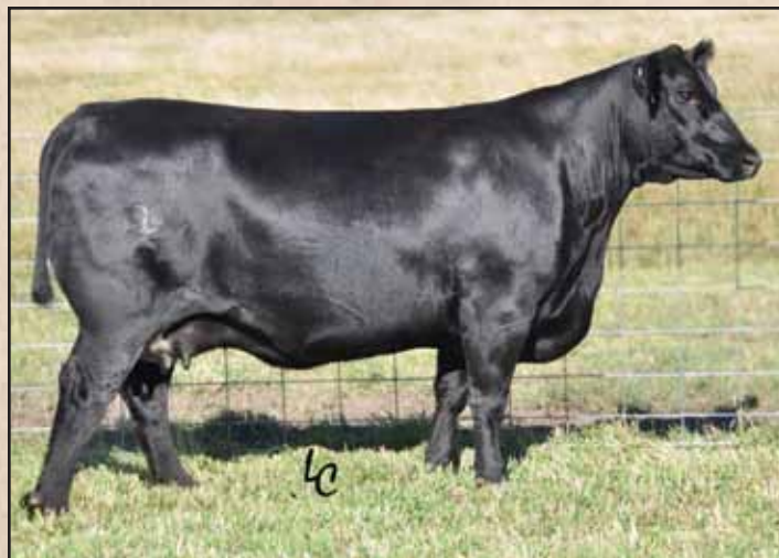
EA Blackclass 6821, Lot 15's maternal granddam.

This is another high-growth son of Homestead from a cow line that has produced numerous lead-off and high-selling individuals at our ranch over the past decade. His performance and genomic records indicate he should inject pounds into his progeny that will have a strong appetite to gain. His Resource dam is a model Angus female with an exquisite amount of volume and capacity. She is the type and kind to thrive on minimal inputs. He is a maternal brother to Ellingson Progressive 7170, a bull selected by the Katus X7 Ranch as a $21,000 feature in last year's production sale.