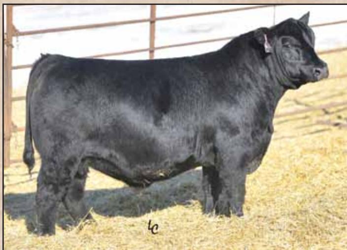
Lot 69, Ellingson Transcend 8024.

Ellingson Transcend 8024 is a stout-rumped Transcend son with unrivaled base width and muscle expression. For those who are looking to moderate frame score in a set of females without sacrificing power and performance, this is the bull to do just that. He came off his dam at 915 pounds to earn a weaning ratio of 101. A maternal brother was selected by Birker Cattle Company in Iowa in our 2018 production sale and was the top IMF bull of his calfcrop, earning a ratio of 153. His maternal sister was one of the best 2-year-olds we calved last spring. You will have an easy time picking out this powerhouse on sale day.