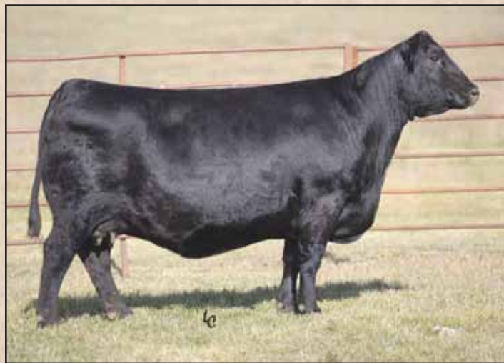
EA Blackclass 9232, Lot 176's dam.