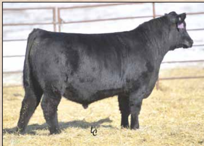
Lot 156, Ellingson Cowboy Up 8611.

This is a well-balanced Cowboy Up son that is stout and deep middled with fluent structure. His strong phenotype and genotype make him a safe bet to maximize predictability. His young Resource dam is one of the most impressive cows on the ranch and has a promising future ahead of her. If you want to achieve ample performance and still make productive, sound and easy-fleshing cows, this bull has the tools in his toolbox to do it.