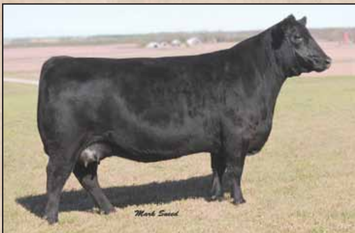
EA Blackbird 7818, the dam of Lots 75 and 76.

"Be sure to taste your words before you spit them out."