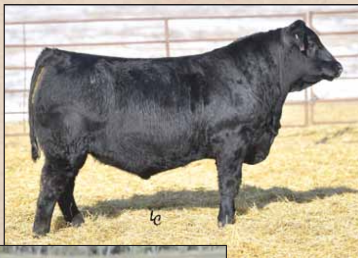
Above: Lot 100, Ellingson 797 Juneau 8154.