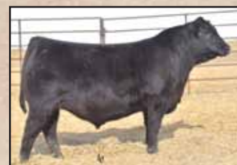
Ellingson Sagebrush 6234, Lot 105's maternal brother.