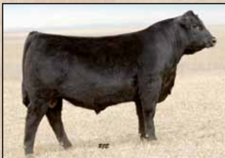
Ellingson Scotsman 0010's influence sells.