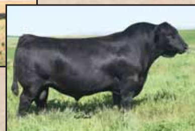
Ellingson Chaps 4095, Lot 2's maternal grandsire.