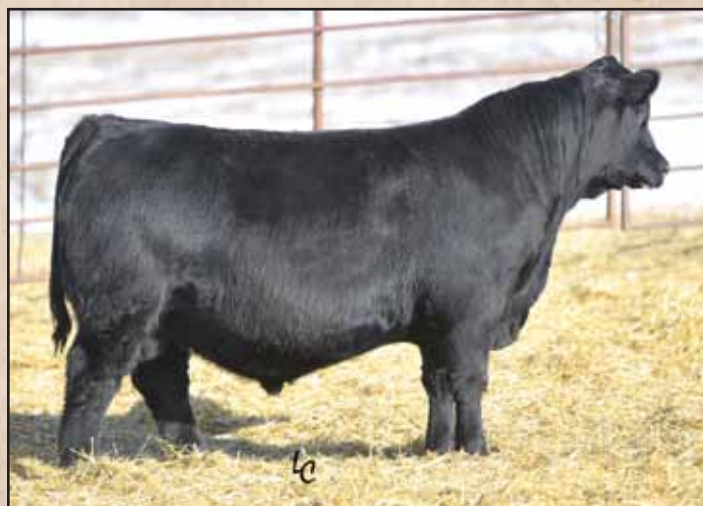
Lot 104, Ellingson 797 Juneau 8245.

Ellingson 797 Juneau 8245 was mated specifically with our commercial customers in mind. He combines Juneau 797, Territory and the Emblynnette cow family for a pedigree saturated with elite maternal genes. The daughters from this bull should possess the functional characteristics to be lasting contributors for many years. His Pathfinder dam is part of our donor team and has a nursing ratio of 6/106, a yearling ratio of 4/109 and a ribeye ratio of 2/105. Maternal brothers have highlighted past sales and have been purchased by Harris Ranch and Double Bar 7 Ranch.