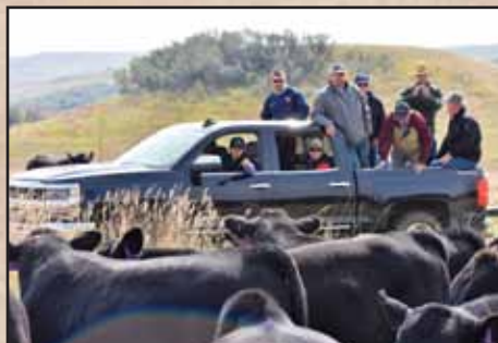
The ST Genetics sales team toured the ranch in September.