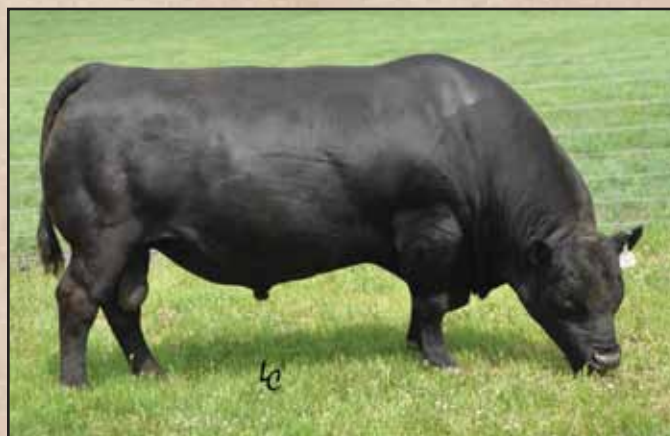
Tehama Blackcap Revolution, Lot 242's sire.