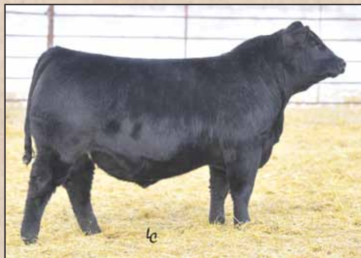
Lot 203, Ellingson Boardwalk 8359.